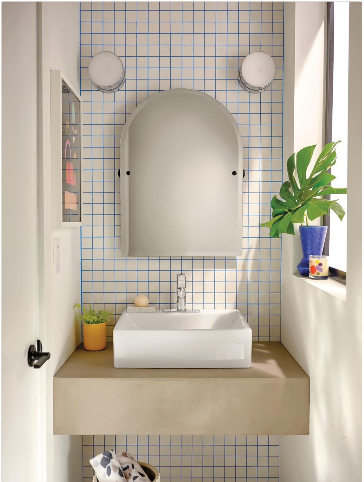
Figure 4: The Moen Laris faucet installed in a contemporary bathroom, demonstrating its integration with a square basin and tiled wall.