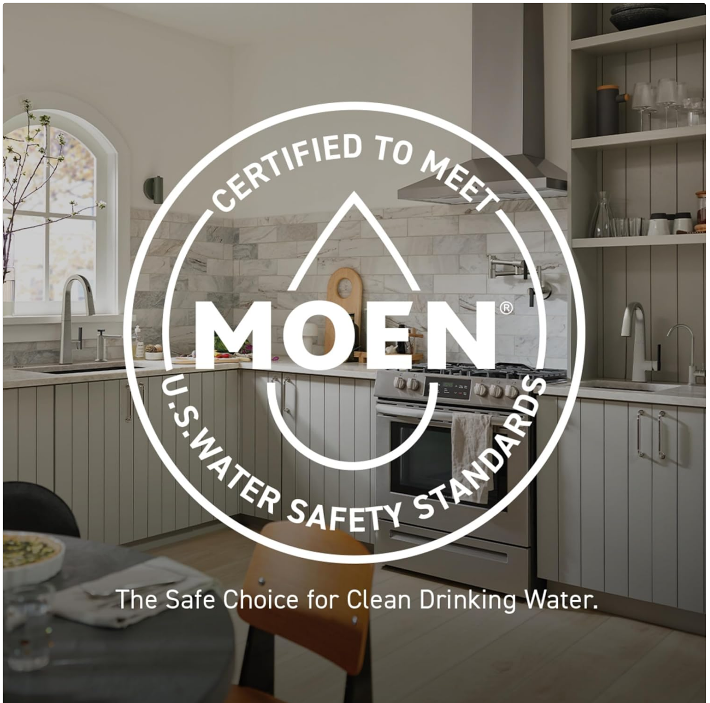
Figure 6: Moen's certification for U.S. Water Safety Standards, indicating a commitment to safe drinking water.