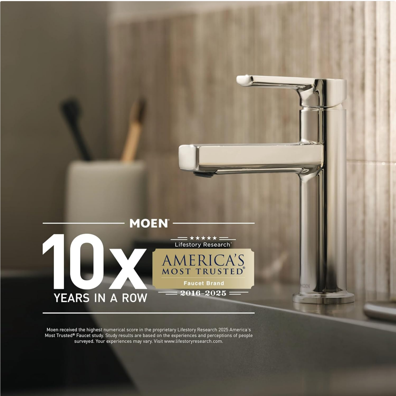
Figure 7: Recognition of Moen as "America's Most Trusted Faucet Brand" for 10 consecutive years, based on Lifestory Research.

© 2025 Moen Incorporated. All rights reserved. For more information, visit www.moen.ca