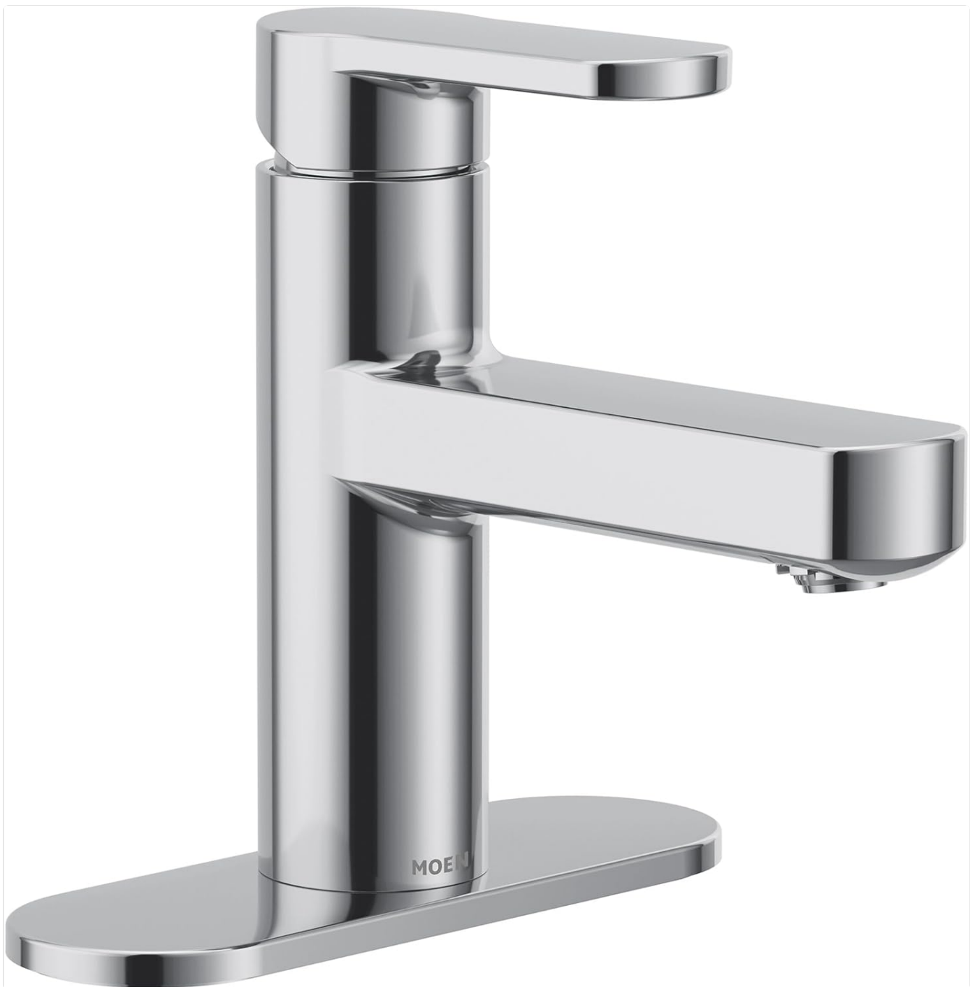
Figure 1: Moen Laris One-Handle Single Hole Modern Bathroom Sink Faucet, showcasing its sleek chrome finish and modern design.