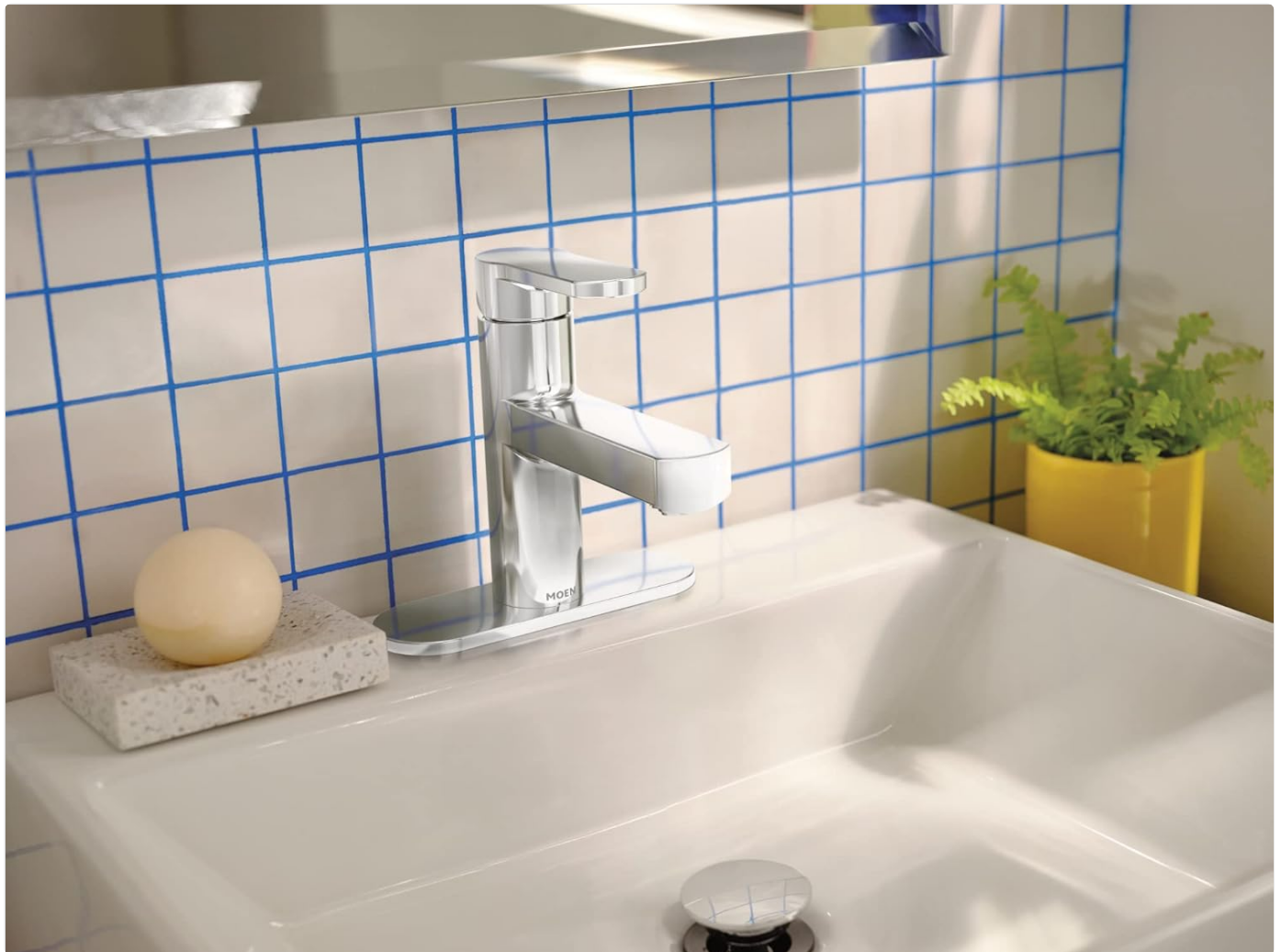
Figure 5: A detailed view of the Moen Laris faucet, highlighting its polished chrome surface and the single handle design, emphasizing the importance of regular cleaning.