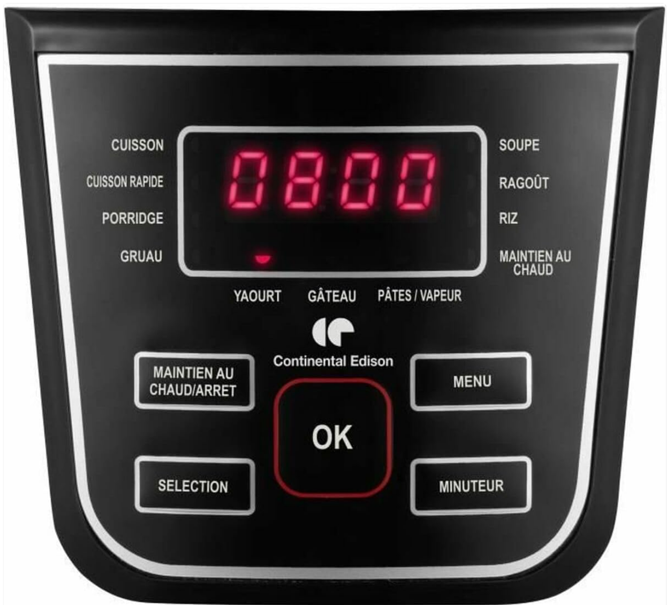
Figure 4.1: Multicooker Control Panel. This close-up image shows the digital display and various function buttons including 'Cuisson', 'Soupe', 'Riz', 'Yaourt', 'Gâteau', 'Pâtes/Vapeur', 'Maintien au Chaud/Arrêt', 'Sélection', 'OK', 'Menu', and 'Minuteur'.