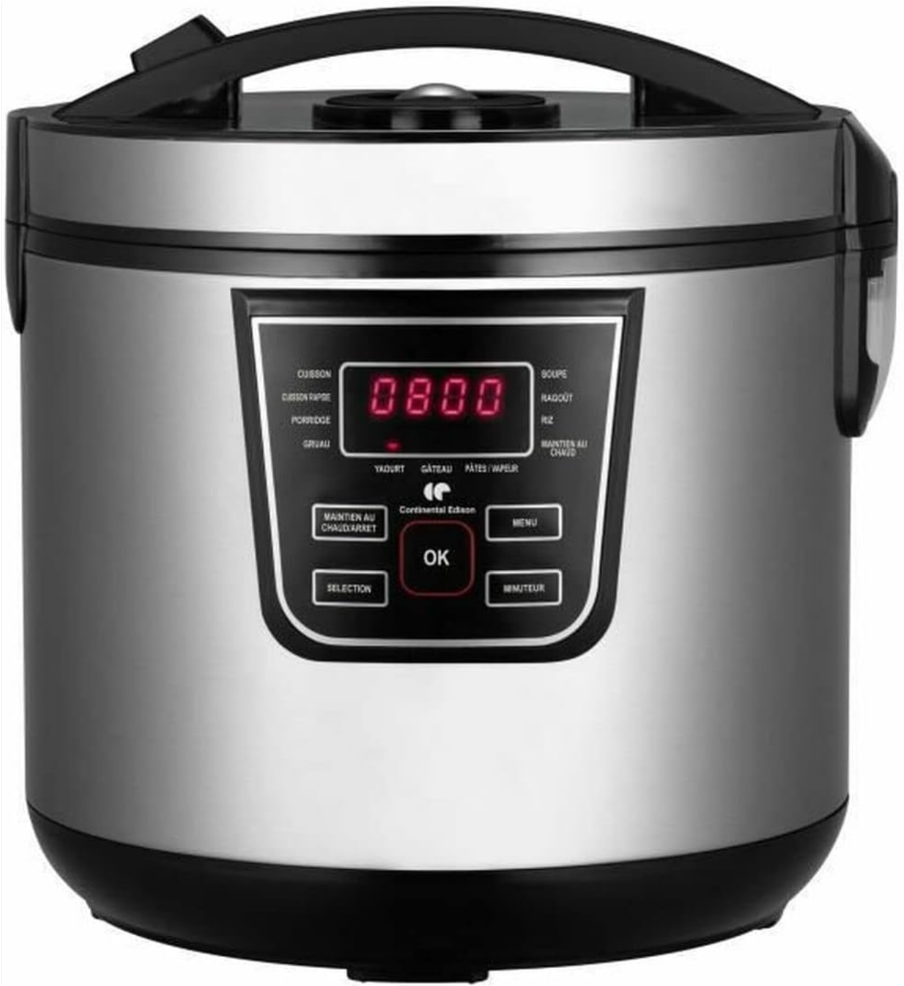
Figure 2.1: Continental Edison MC860IN Electric Multicooker. This image shows the complete multicooker unit with its sleek silver and black design, featuring the digital control panel on the front.