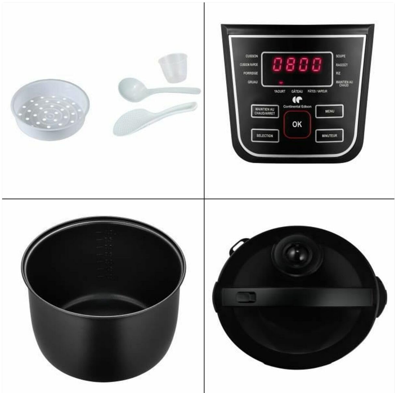
Figure 2.2: Multicooker Components and Accessories. This image displays the main components: the inner pot, the control panel, the lid, a steamer basket, a measuring cup, and two serving utensils (a ladle and a rice paddle).