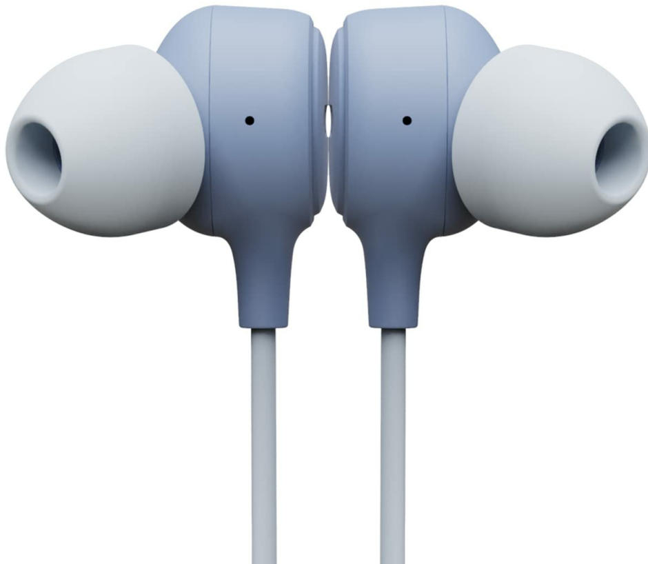
Image: The boAt Bassheads 103 earphones with magnetic earbuds connected for tangle-free storage.