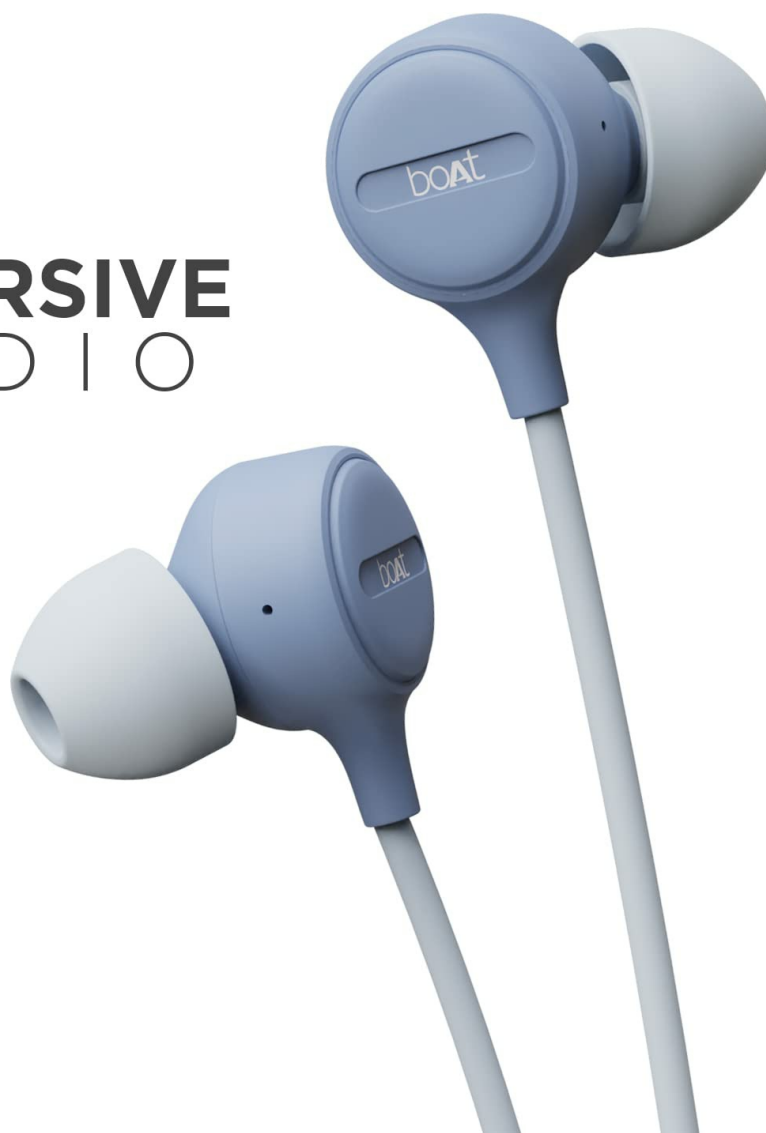
Image: The boAt Bassheads 103 earphones, highlighting their immersive audio capabilities.