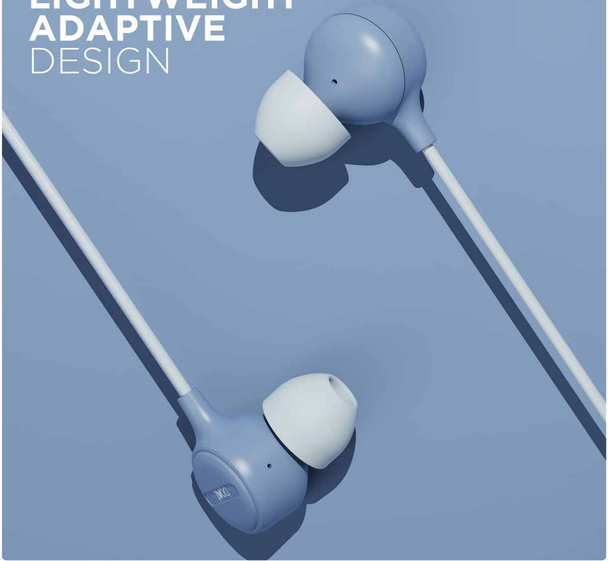
Image: The boAt Bassheads 103 earphones, showcasing their lightweight and adaptive design.