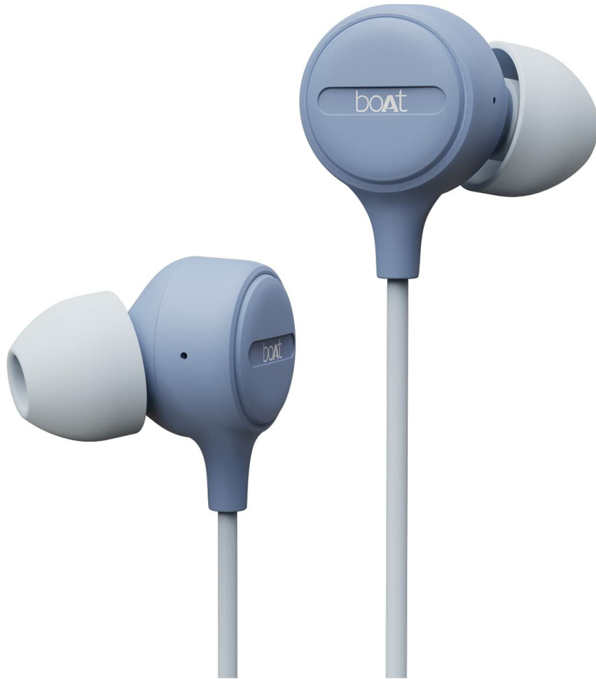
Image: The boAt Bassheads 103 earphones, illustrating their passive noise isolation feature.