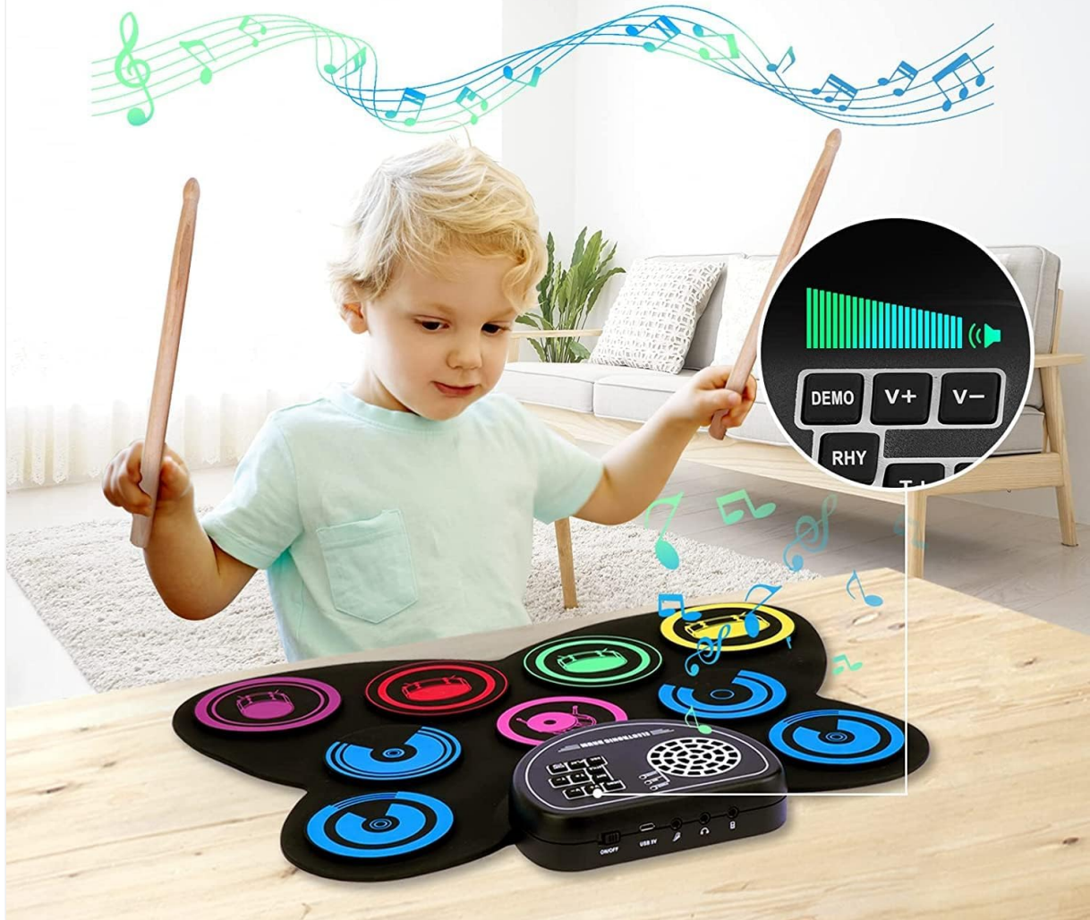
Image: A child playing the electronic drum set, highlighting the built-in stereo speakers for sound output.