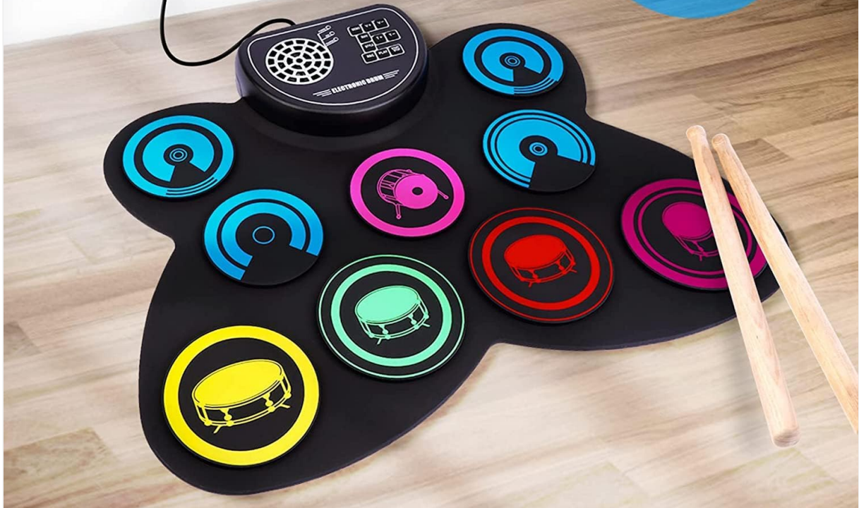
Image: The electronic drum set connected to a wall adapter via a USB cable, illustrating the charging process and indicating 10 hours of playtime.