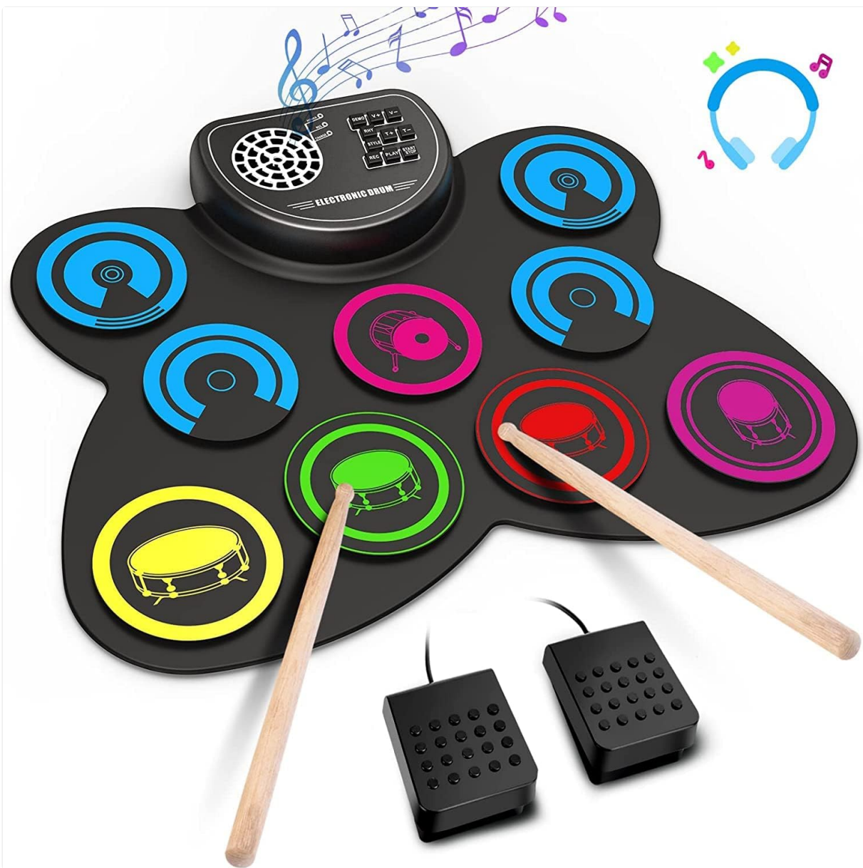
Image: The EKEMOND G769 9-Pad Electronic Drum Set, showing the main drum pad, drumsticks, and foot pedals.