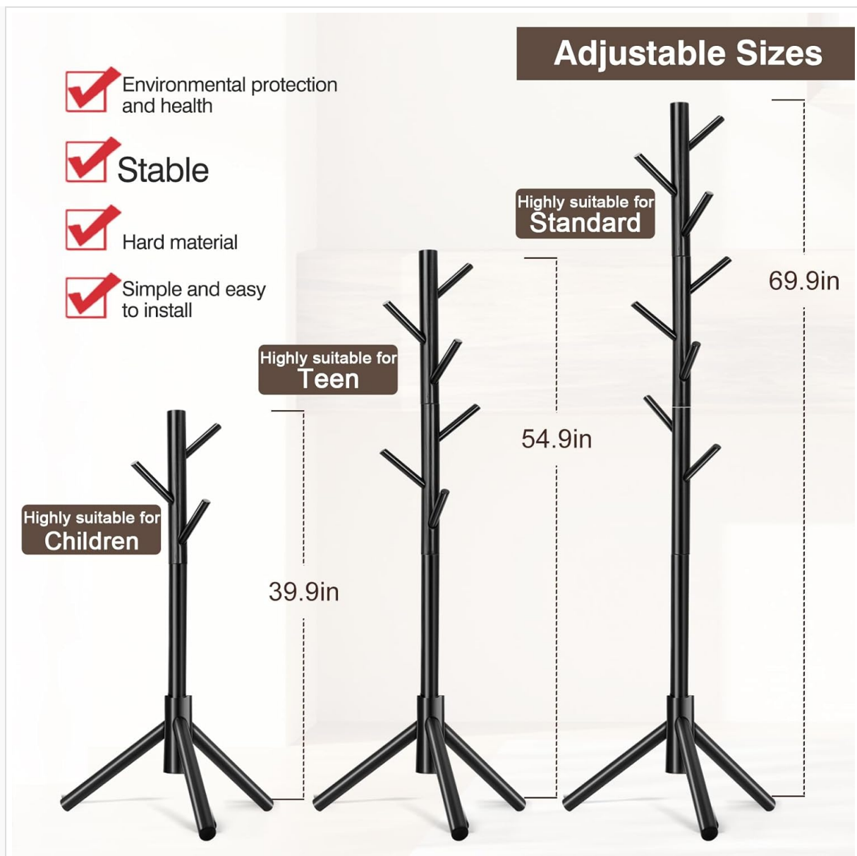
Image 5.2: Visual representation of the coat rack's adjustable heights, showing configurations for children, teens, and standard adult use.