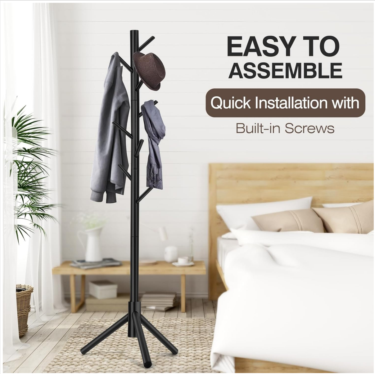
Image 4.1: Detailed view of the assembly process, showing how components connect securely without gaps, ensuring a stable structure.