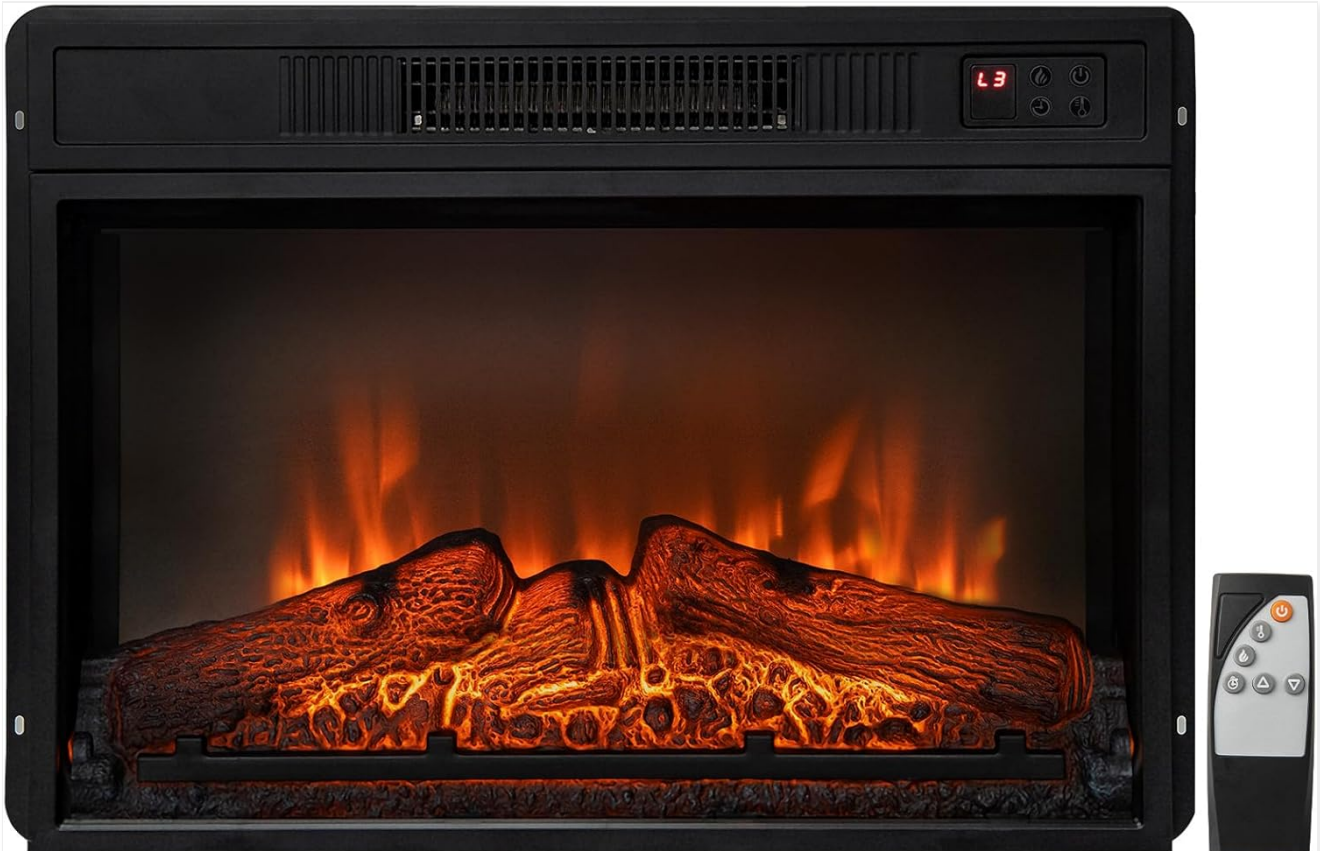
Image: Front view of the COSTWAY Electric Fireplace Insert, showcasing the realistic log and flame effects, with the remote control

Thank you for purchasing the COSTWAY Electric Fireplace Insert. This 23-inch wide, 1400W recessed fireplace heater is designed to provide both warmth and aesthetic appeal to your indoor spaces. It features a remote control, three LED flame effects, and a 6-hour timer for convenient operation. This manual provides essential information for safe installation, operation, maintenance, and troubleshooting to ensure optimal performance and longevity of your unit.