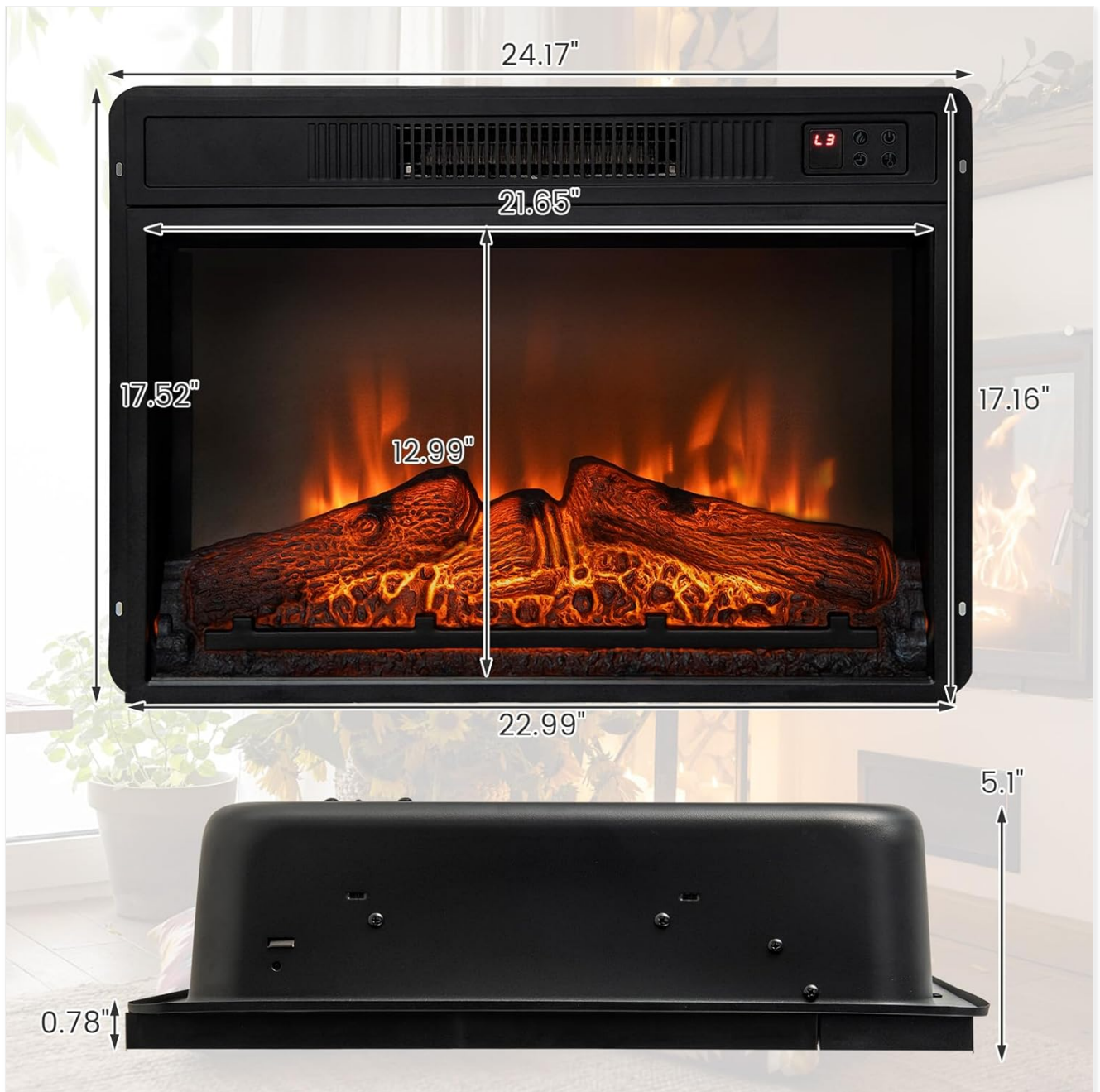
Image: A detailed diagram illustrating the overall length, width, and height of the fireplace insert, along with internal measurements. When the product is recessed installed, ensure the air inlet is kept at least 2 inches (5 cm) away from any surrounding board or wall to allow for proper ventilation and prevent overheating.