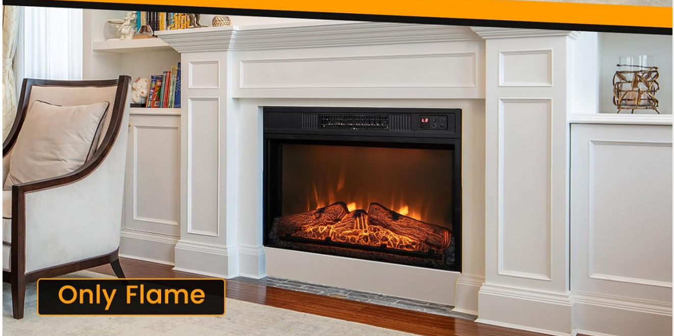
Image: Two scenes showing the fireplace installed in a mantel, one with both flame and heat active (indicated by upward heat lines), and the other with only the flame effect for ambiance.