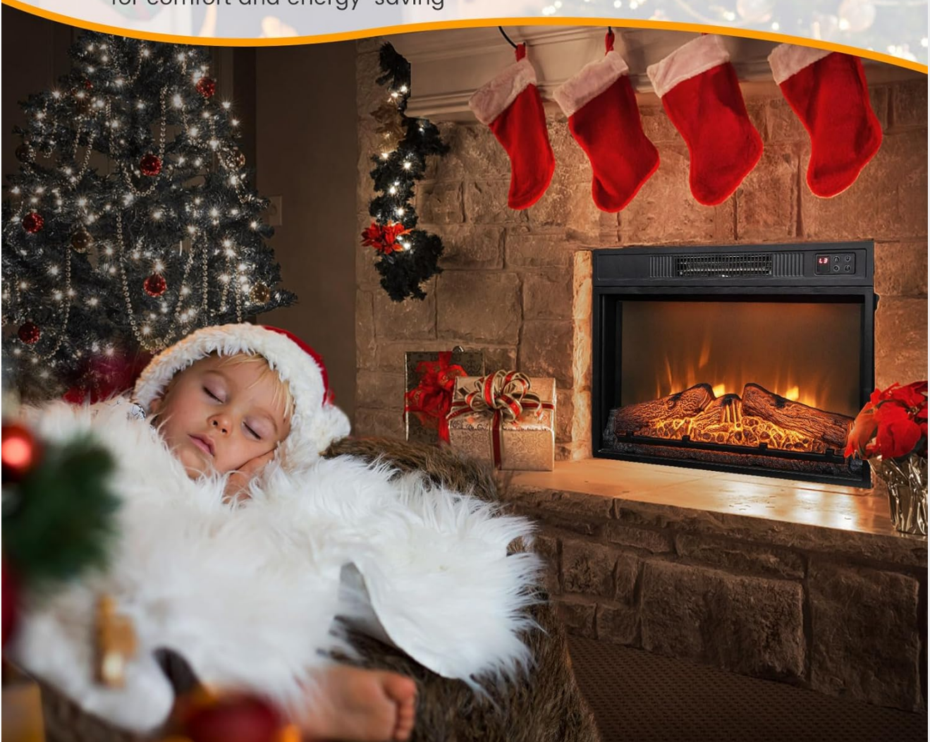
Image: A cozy scene with the fireplace operating, highlighting the 62°F-82°F thermostat range and promoting quiet operation for a comfortable experience.

Keep the room at your desired temperature for comfort and energy-saving