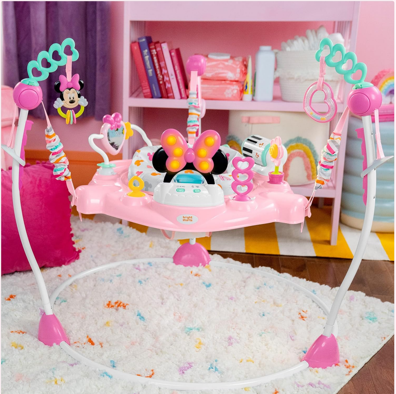
Figure 3: Front view of the assembled activity jumper.