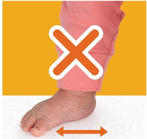
Figure 5: Check child's foot position to ensure proper height adjustment.