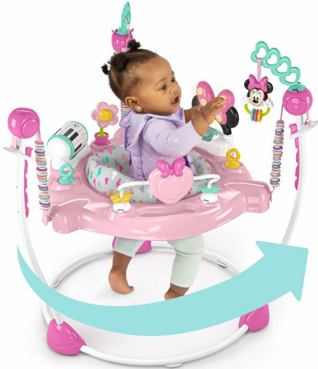
Figure 11: The fabric seat pad is machine washable for convenience.