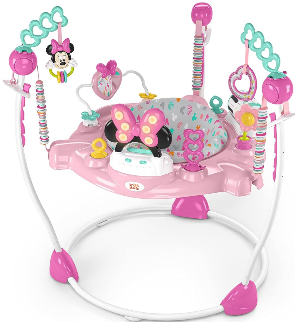
Figure 1: Bright Starts Disney Baby Minnie Mouse Activity Center Jumper.