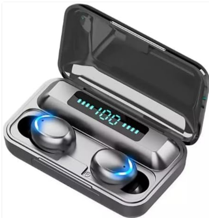
Image: TWS Bluetooth Earbuds in their charging case, displaying the battery level.

The TWS Bluetooth Earbuds offer a wireless audio experience with immersive bass, noise cancellation, and a portable charging case. The package includes the two earbuds and the charging station.