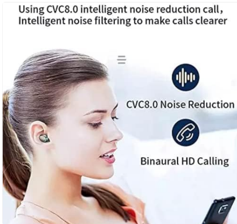
Image: Illustrates the CVC 8.0 Noise Reduction and Binaural HD Calling features for clear calls.