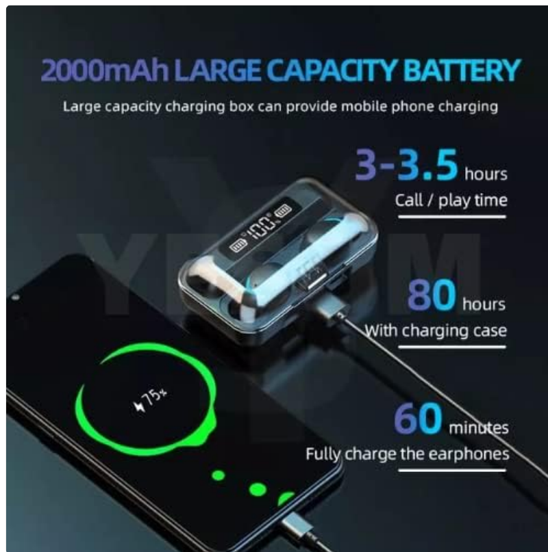
Image: The 2000mAh charging case charging a mobile phone, highlighting its large capacity and extended playback time.