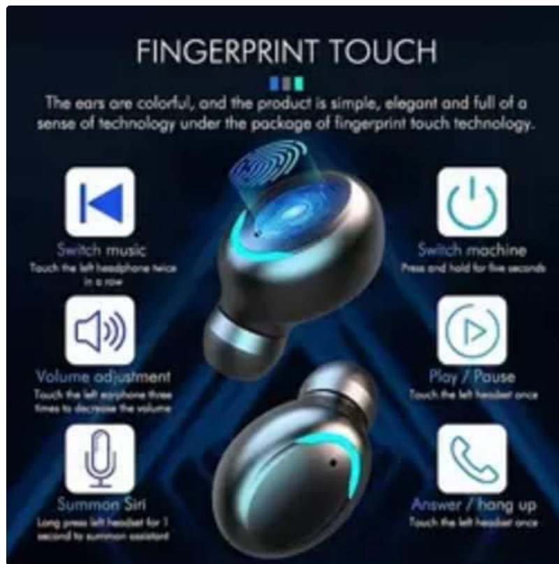
Image: Detailed diagram of touch control functions on the earbuds.