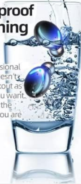
Image: Earbuds submerged in water, demonstrating their IPX7 waterproof rating.

Pair it with multi-format earmuff, and the earphone will always stay on, whether you are working out, cycling or running.