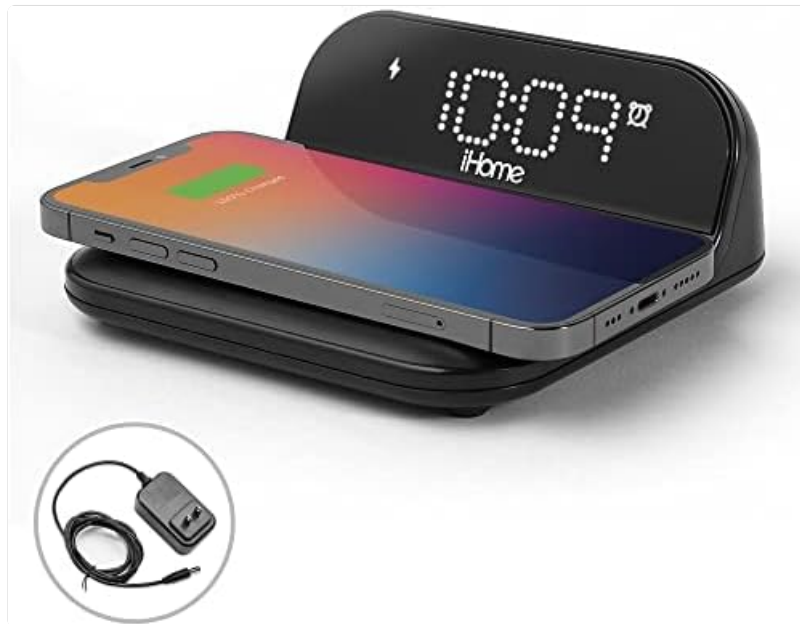
Figure 2: The iHome IOP18 unit with its power adapter, ready for connection.

Connect the included AC adapter to the DC jack located on the back of the iHome IOP18 unit. Plug the other end of the adapter into a standard wall outlet (100V - 240V universal voltage compatible).