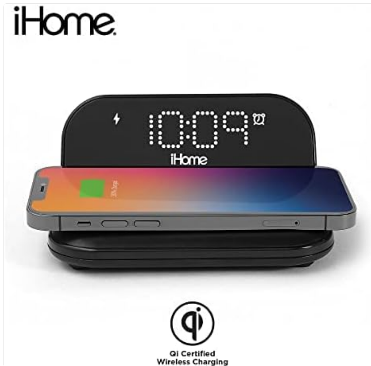
Figure 5: A smartphone positioned on the wireless charging pad, indicating active Qi-certified charging.