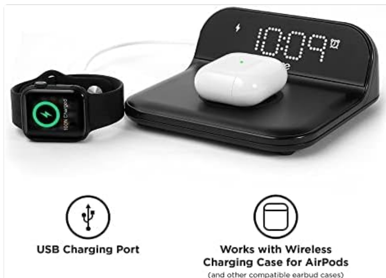
Figure 6: The iHome IOP18 demonstrating simultaneous charging of an Apple Watch via the USB port and AirPods wirelessly.

Connect your secondary device (e.g., another smartphone, smartwatch, or earbuds) to the 5W USB Type-A port located on the back or side of the unit using your device's charging cable (not included).