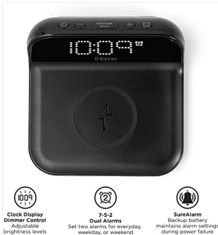
Figure 4: Top view of the iHome IOP18, highlighting the control buttons for time, alarm, and snooze settings.