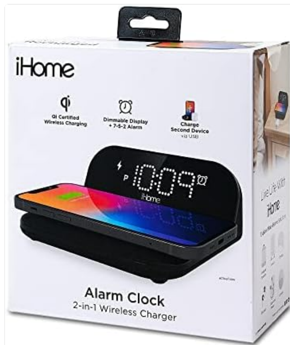
Figure 1: The iHome Alarm Clock with Wireless Charging, Model IOP18B, shown in its retail packaging.

The iHome IOP18 is a versatile 2-in-1 device combining a digital alarm clock with a wireless charging station. Designed for convenience, it allows you to charge Qi-compatible mobile devices wirelessly and a secondary device via its 5W USB port. This compact unit features an adjustable brightness display and programmable snooze, making it an ideal addition to any bedroom or home office.