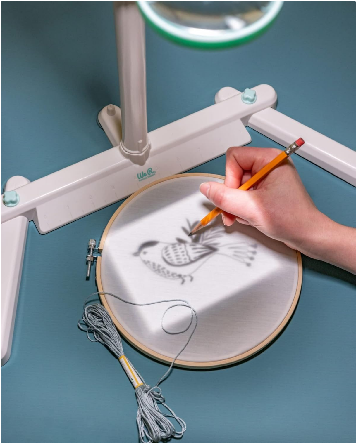
Image: A hand tracing a bird design onto an embroidery hoop, guided by the projected image.