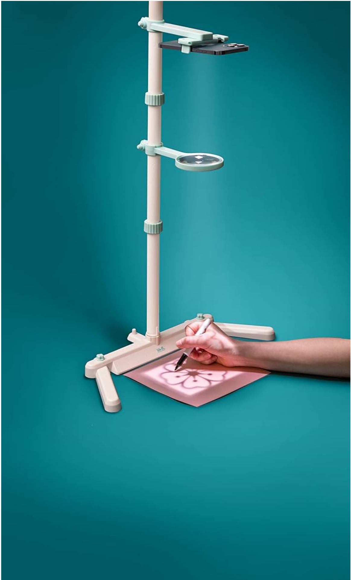
Image: The Craft Projector in active use, projecting a floral pattern onto a surface for tracing.