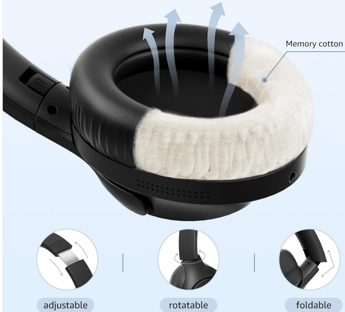
Image: Close-up of the memory foam earcups and illustrations showing the adjustable, rotatable, and foldable features of the headphones.