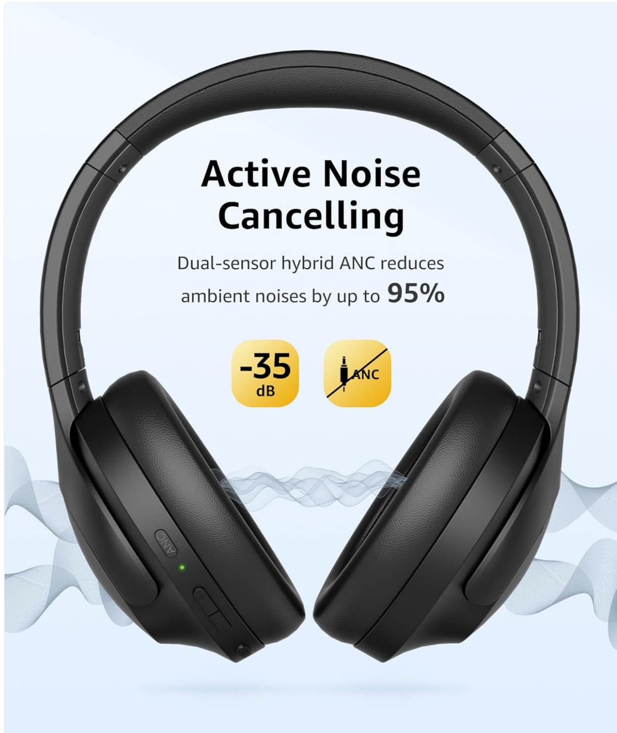
Image: Visual representation of the Active Noise Cancelling feature, showing noise reduction by -35dB.

The headphones feature Active Noise Cancelling technology, which reduces ambient noise by up to 95%. To activate or deactivate ANC, press the dedicated ANC button located on the earcup. This function is ideal for noisy environments such as airplanes, subways, or offices.