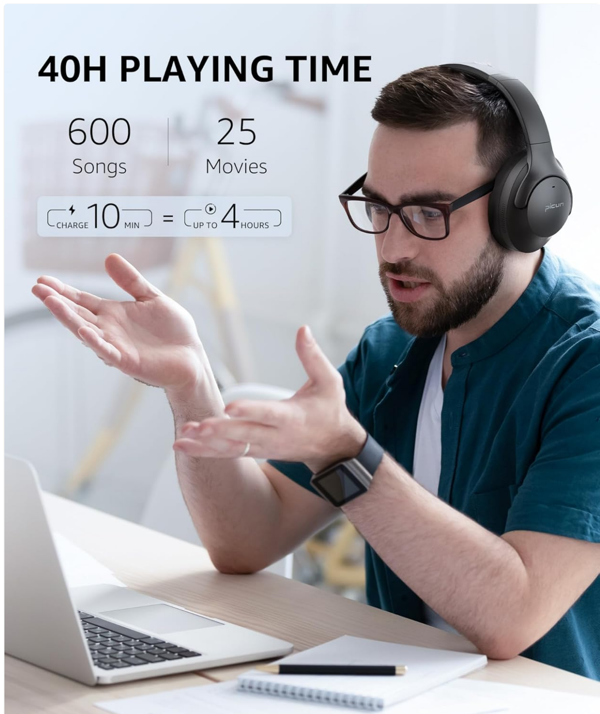
Image: Illustration showing the headphones charging via USB-C and highlighting the 40-hour playing time.

Before first use, fully charge the headphones. Connect the supplied USB-C cable to the charging port on the headphone and the other end to a compatible USB power source (e.g., computer USB port, wall adapter). The charging time is approximately 2.5 hours for a full charge. A 10-minute charge provides up to 4 hours of listening time.