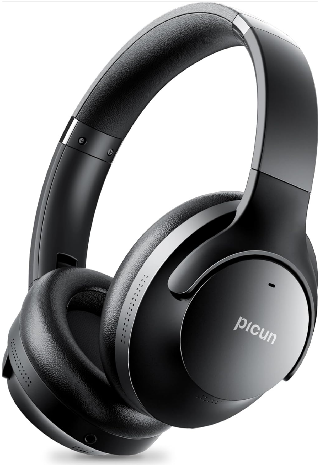
Image: Front view of the Picun ANC-05L Active Noise Cancelling Headphones in black.