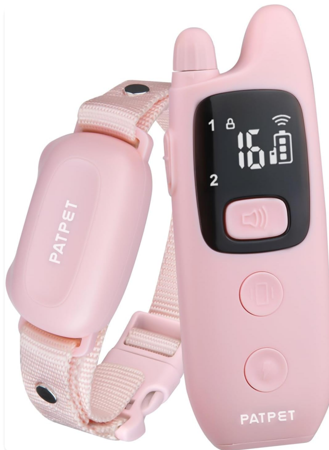
The PATPET Dog Shock Collar with Remote, featuring a pink remote and collar unit.

This instruction manual provides detailed guidance for the safe and effective use of your PATPET Dog Shock Collar with Remote. Please read this manual thoroughly before operating the device to ensure proper training and care for your dog.