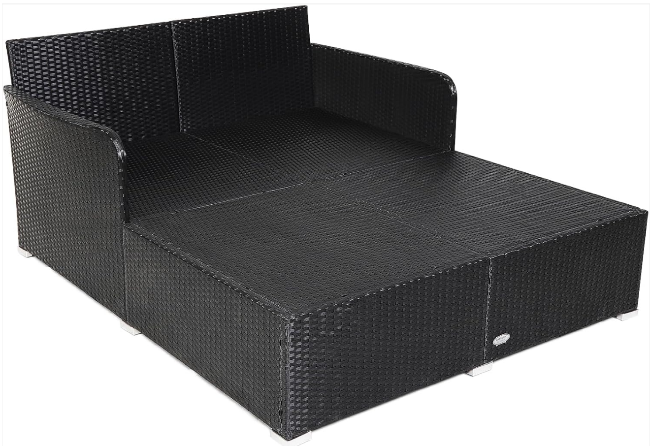
Image: The rattan frame of the daybed without cushions, illustrating the structural components before cushion placement.