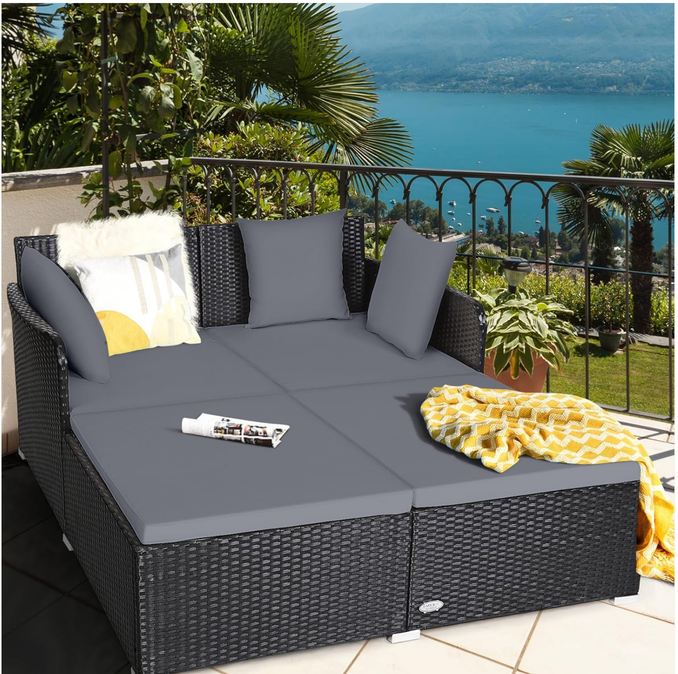
Image: The assembled HAPPYGRILL Outdoor Rattan Daybed with grey cushions and decorative pillows, situated on a balcony overlooking a body of water.