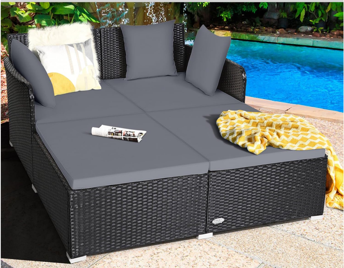
Image: The daybed positioned in a lush garden, demonstrating its suitability for various outdoor environments.