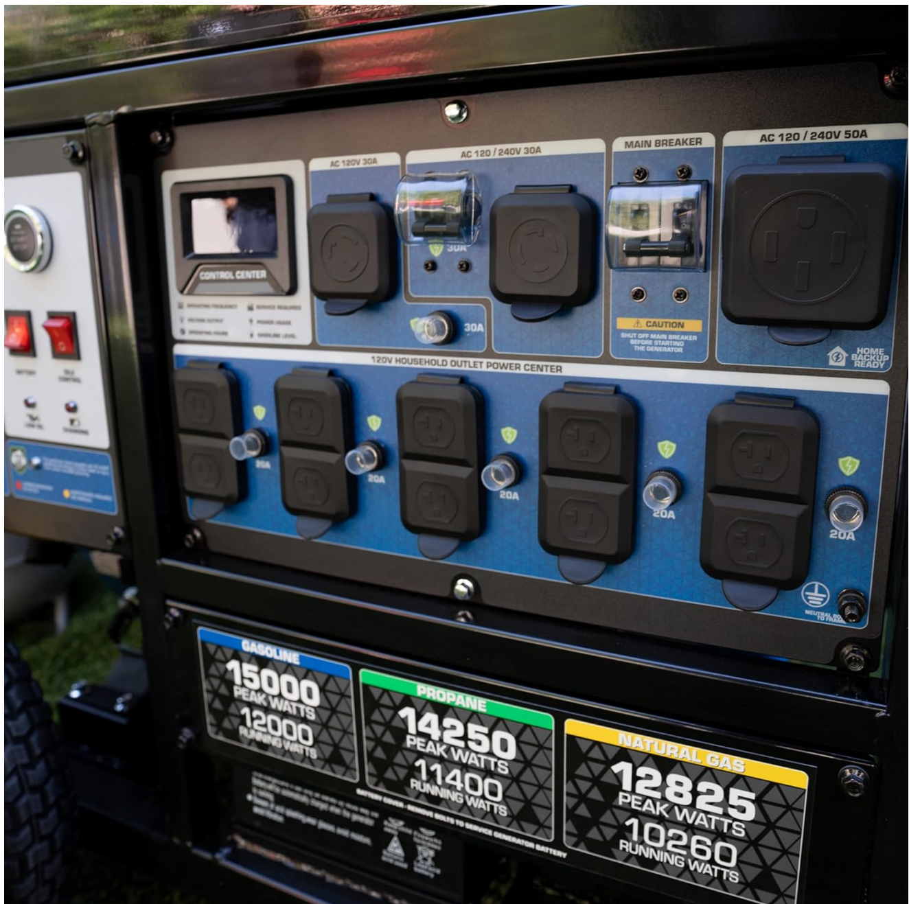
Image: Close-up of the 120/240V 50A HEAVY DUTY outlet on the DuroMax XP15000HXT, indicating it is home backup-ready.

Your browser does not support the video tag.