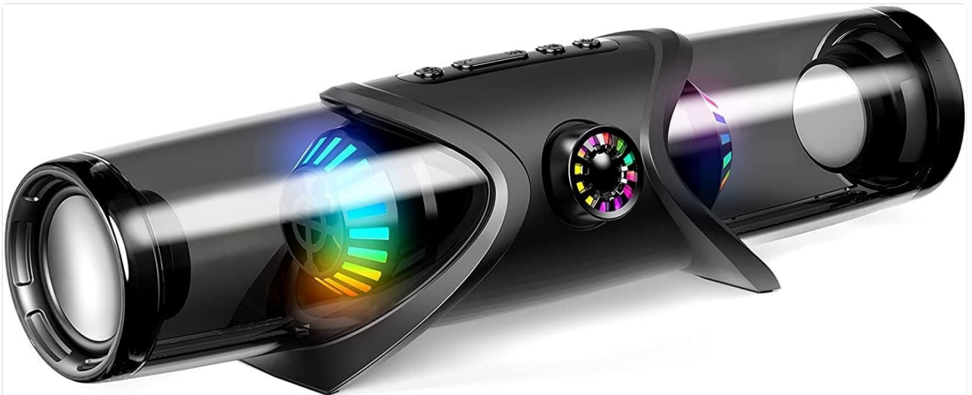
Figure 1.1: Front view of the HY-101-DHG Bluetooth Speaker, showcasing its sleek design and integrated RGB lighting.

The Generic HY-101-DHG Wireless Portable Bluetooth Speaker delivers powerful, distortion-free sound with enhanced bass, perfect for various settings including home, dorm rooms, kitchens, bathrooms, cars, and parties. It features a unique design with adjustable RGB colorful streamer ring lights and intuitive controls for a dynamic audio-visual experience.