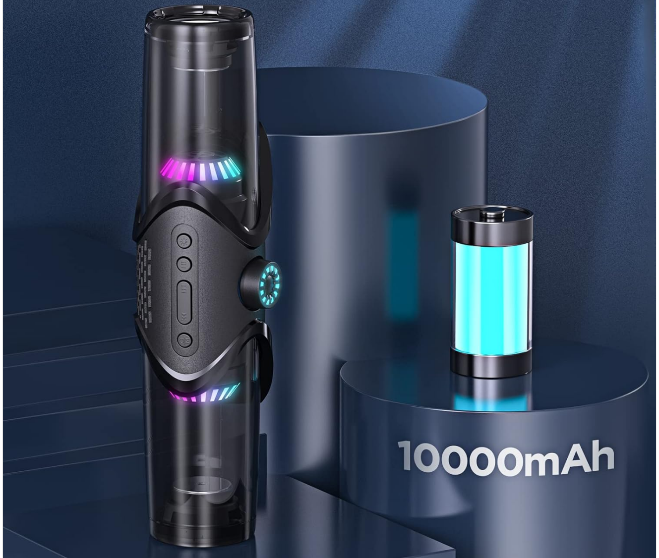
Figure 2.4: Visual representation of the speaker's 10000mAh battery capacity, ensuring long hours of music playback.