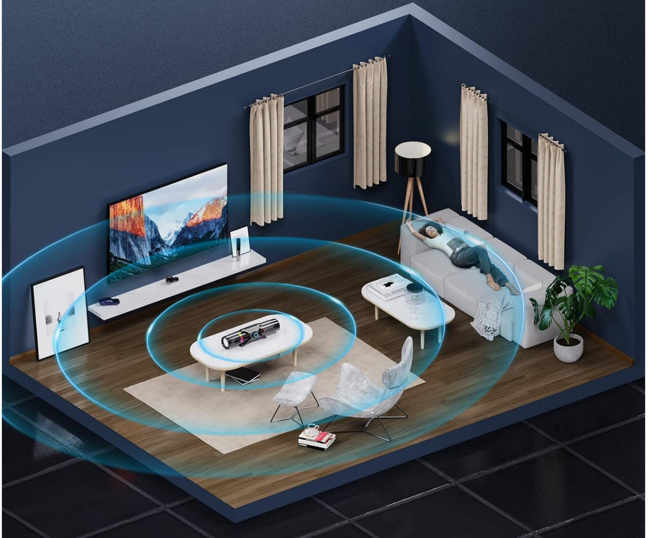
Figure 2.3: The speaker positioned in a living room, illustrating its ability to deliver room-filling sound.