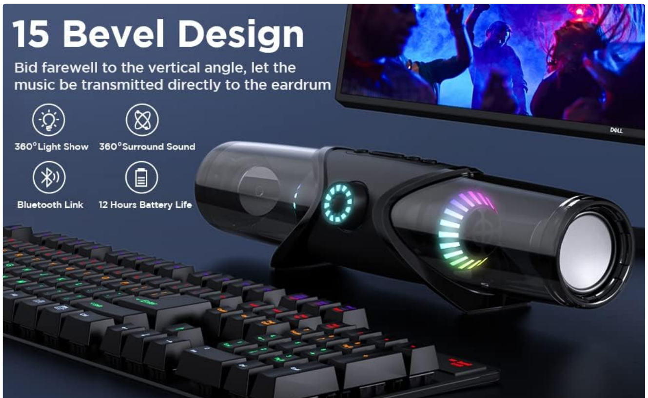
Figure 2.5: The speaker's 15-degree bevel design, optimized for direct sound projection, shown in a desktop setup.