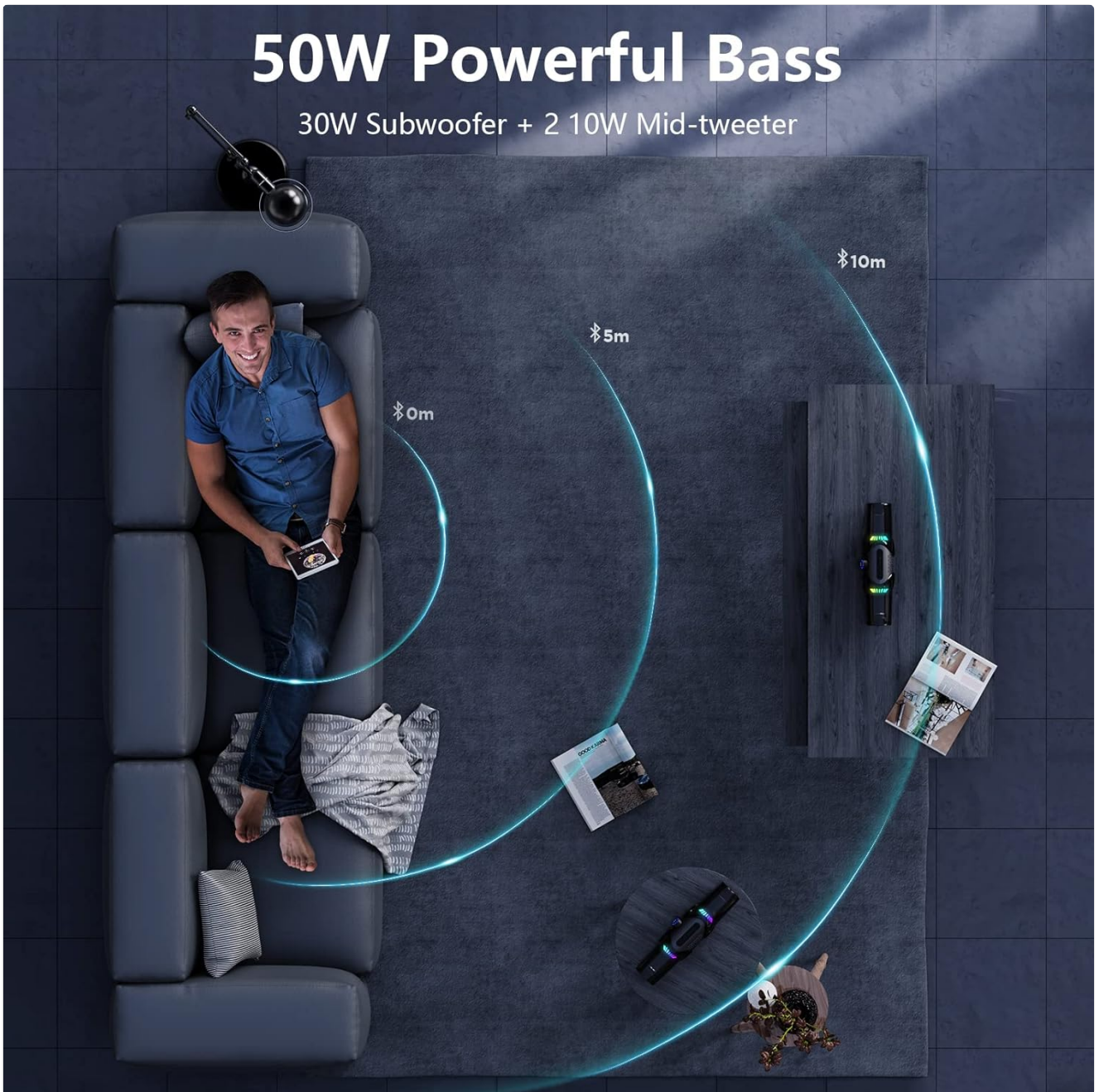
Figure 2.1: Illustration of the speaker's wireless range, demonstrating its connectivity capabilities within a 10-meter radius.