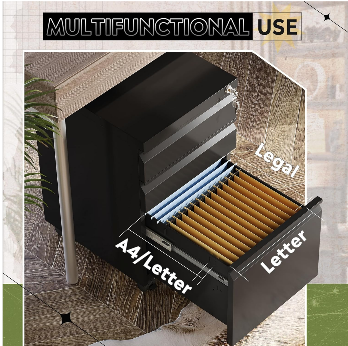
Image: The bottom drawer open, illustrating its capacity for Letter, Legal, and A4 size hanging files.

The bottom drawer is designed for hanging files and includes a removable hanging bar. This drawer accommodates Letter, Legal, and A4 size folders. Adjust the hanging bar as needed to fit your preferred file size.