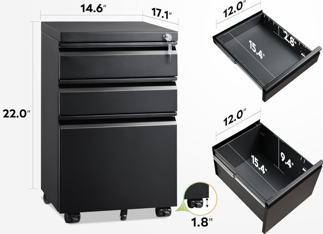
Image: Detailed product dimensions, including width, depth, and height, with and without casters.