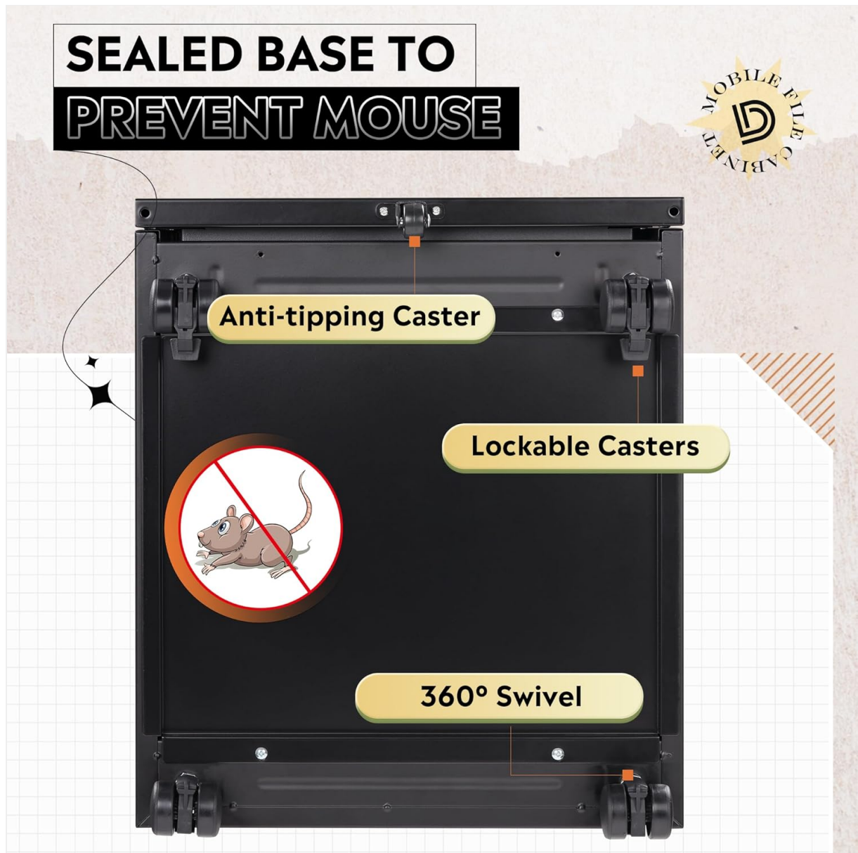
Image: Underside view of the cabinet with all five casters installed. This includes four main swivel casters and one anti-tip caster positioned under the front of the bottom drawer for enhanced stability.