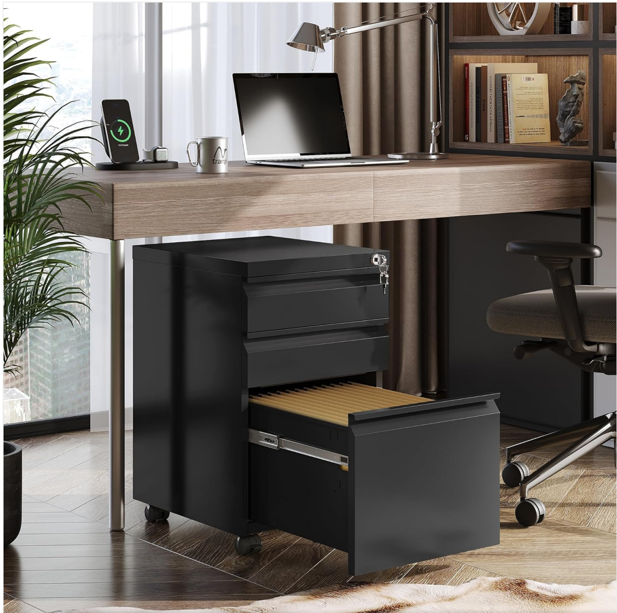
Image: The file cabinet placed under an office desk, demonstrating its mobile functionality and how the open bottom

The cabinet is equipped with five casters for easy mobility. Two of the front casters have locking brakes. To move the cabinet, unlock the casters. To keep the cabinet stationary, engage the brakes on the front casters. The central anti-tip caster provides additional stability when the bottom drawer is open.