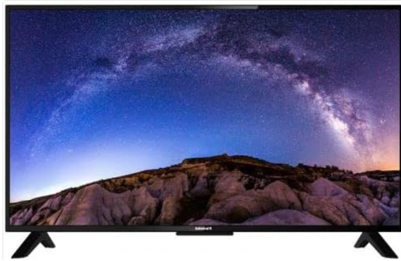
Image: Front view of the Admiral 50-inch Smart TV with its stand properly installed. This shows the display and the two support feet at the bottom.