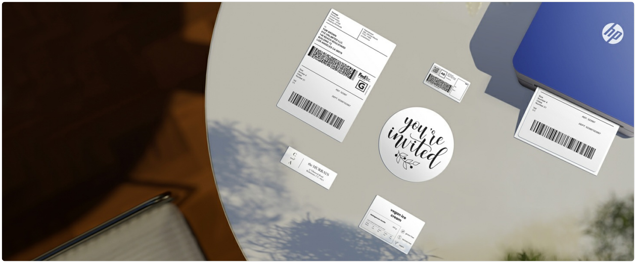
The HP KE203 is compatible with all major shipping platforms.