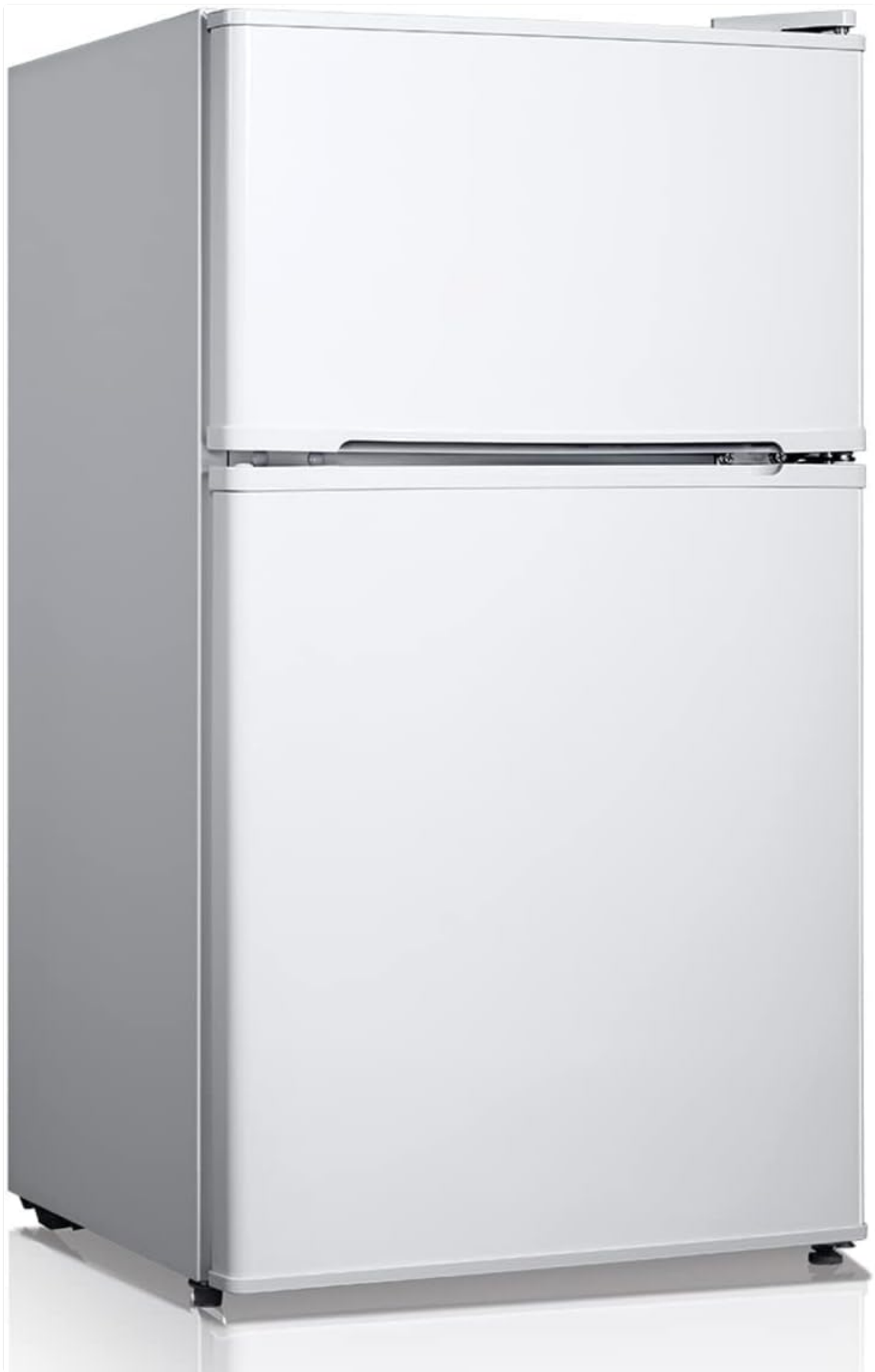
Figure 2.1: Front view of the Mabe RMF032PYMXB mini-fridge in white. This compact appliance features two distinct doors, one for the freezer compartment and one for the main refrigeration section, designed for efficient space utilization.