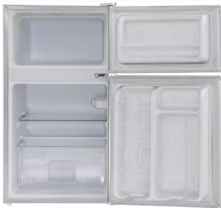
Figure 2.2: Interior view of the Mabe RMF032PYMXB mini-fridge. This image shows the upper freezer compartment and the lower fresh food compartment, complete with a tempered glass shelf and a crisper drawer with a glass lid, along with door storage.