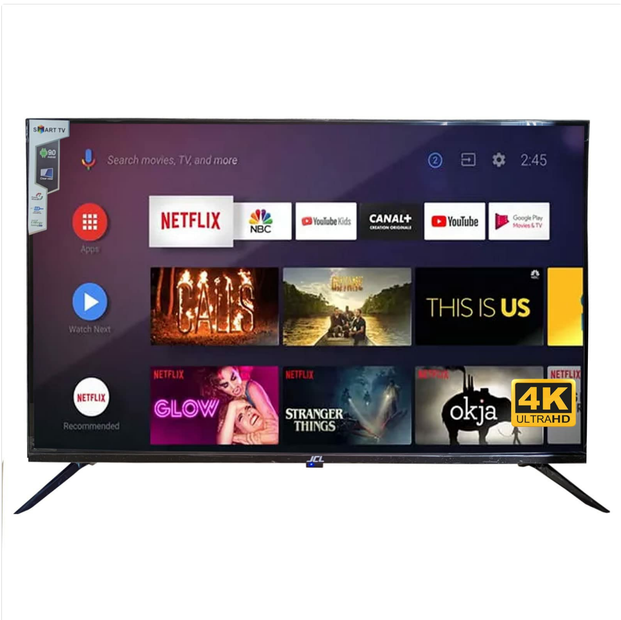
Figure 4: Front view of the JCL 43-inch 4K Smart TV, showing the Android TV home screen with various streaming

Your JCL TV runs on Android TV 9.0, providing access to a wide range of applications and services. The home screen displays recommended content and installed apps.