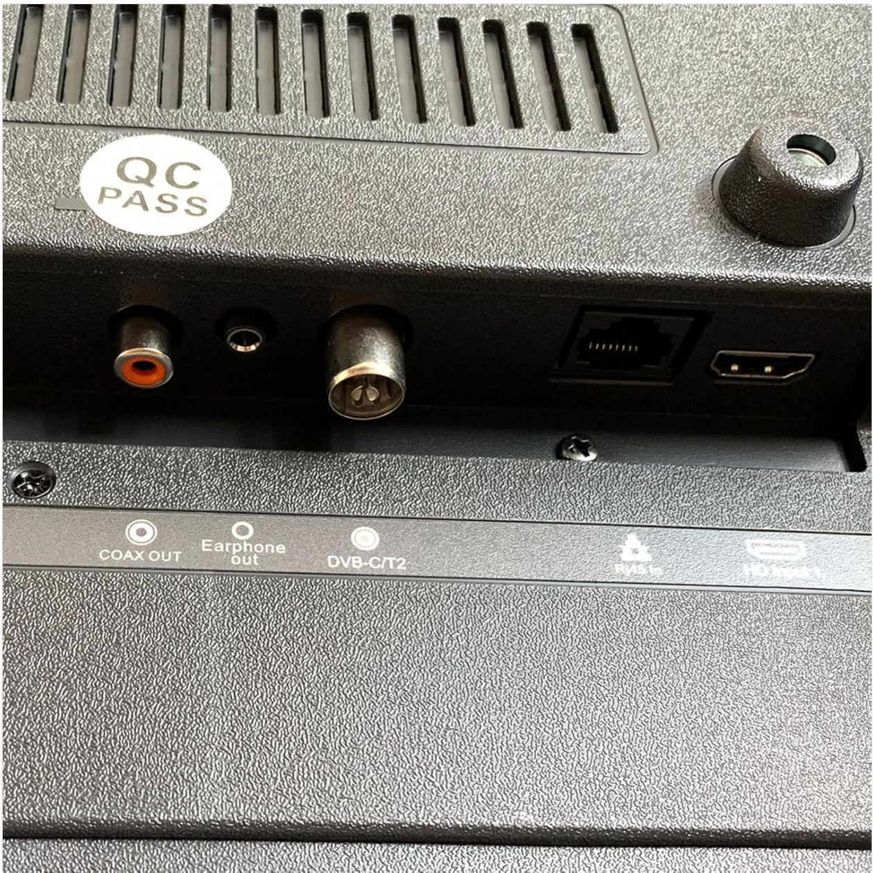
Figure 2: Close-up view of the right-side connectivity ports, featuring Coaxial Out, Earphone Out, DVB-C/T2 antenna input, RJ45 Ethernet port, and one HDMI input.