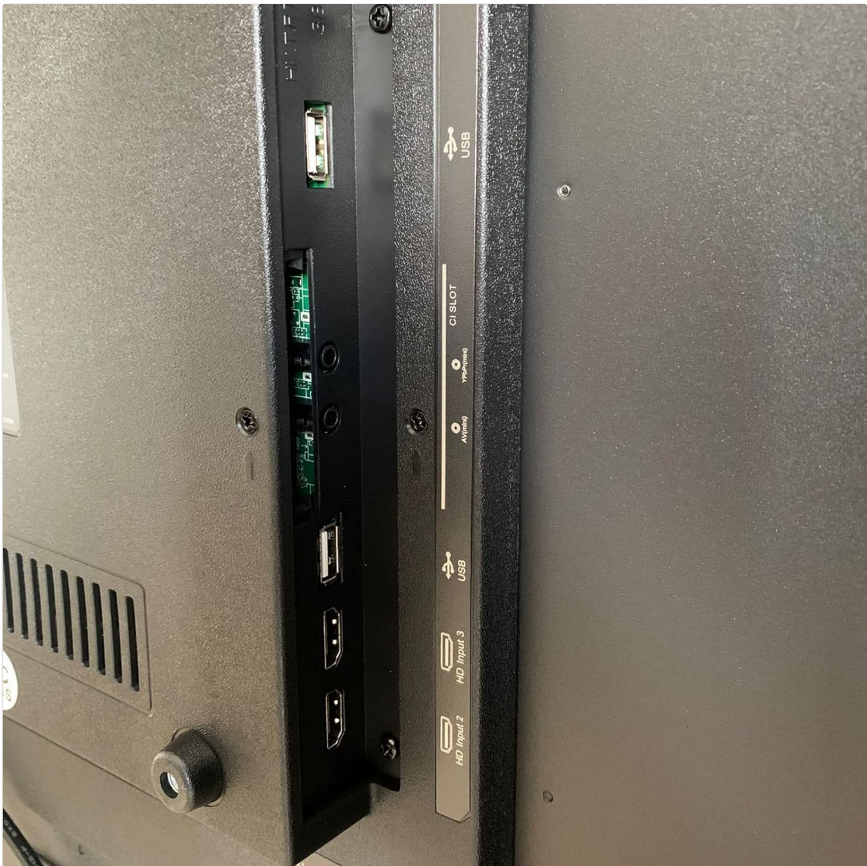
Figure 3: Close-up view of the left-side connectivity ports, showing two USB ports, a CI Card Slot, and two additional HDMI inputs.