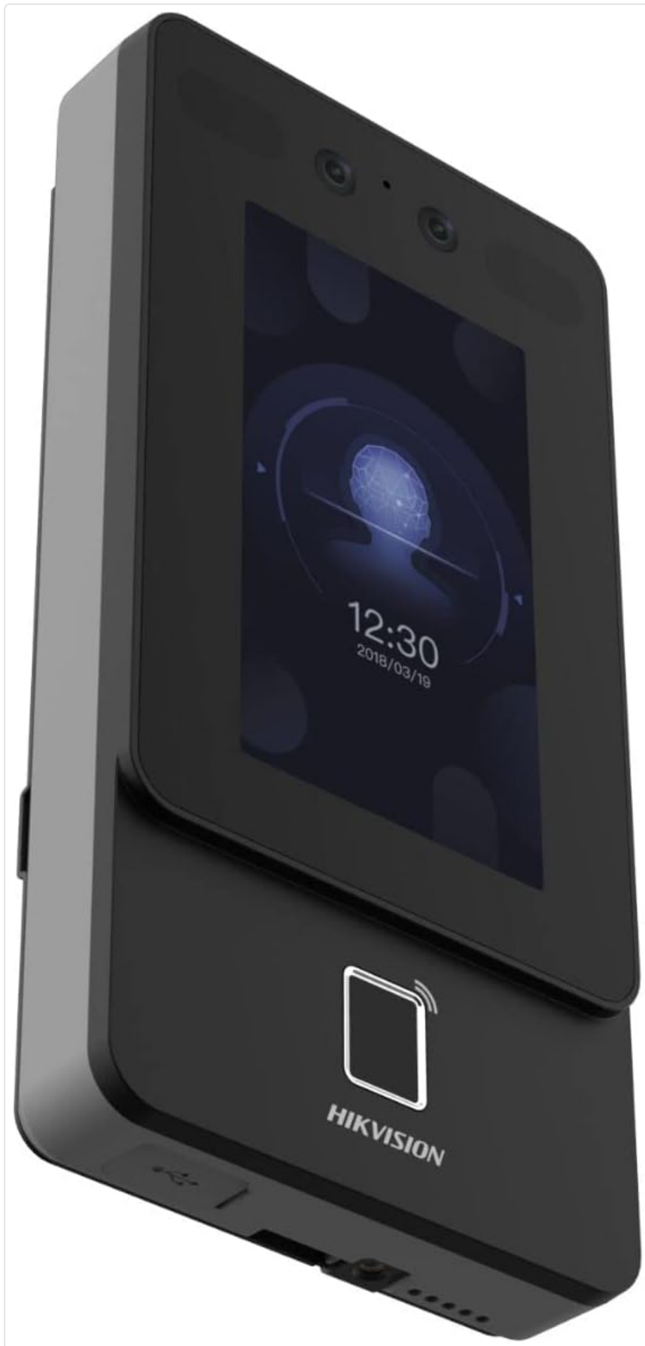
Figure 3: Bottom angled view, illustrating the various connectivity ports and interfaces.