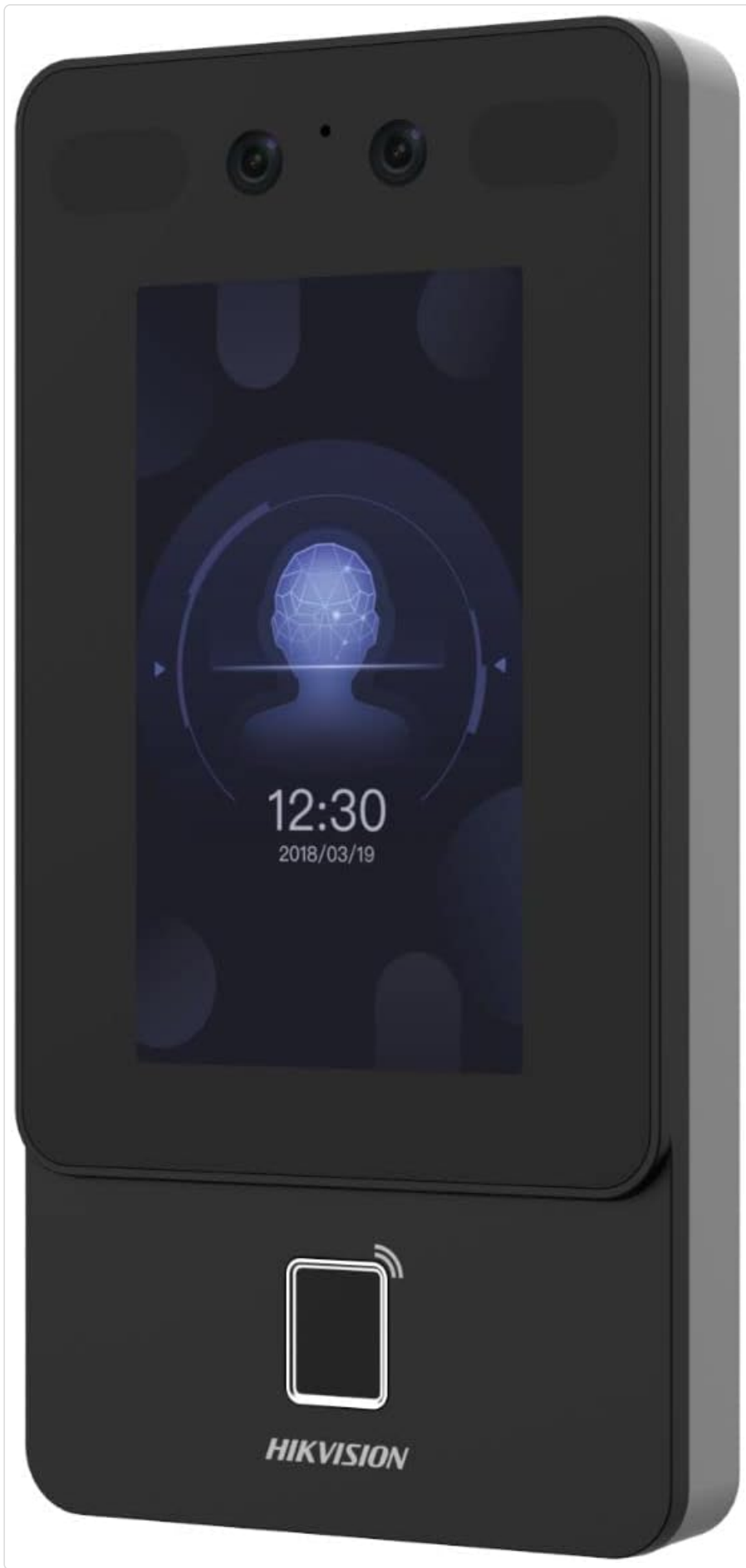
Figure 2: Angled view of the terminal, highlighting its slim profile and the integrated card reader area at the bottom.