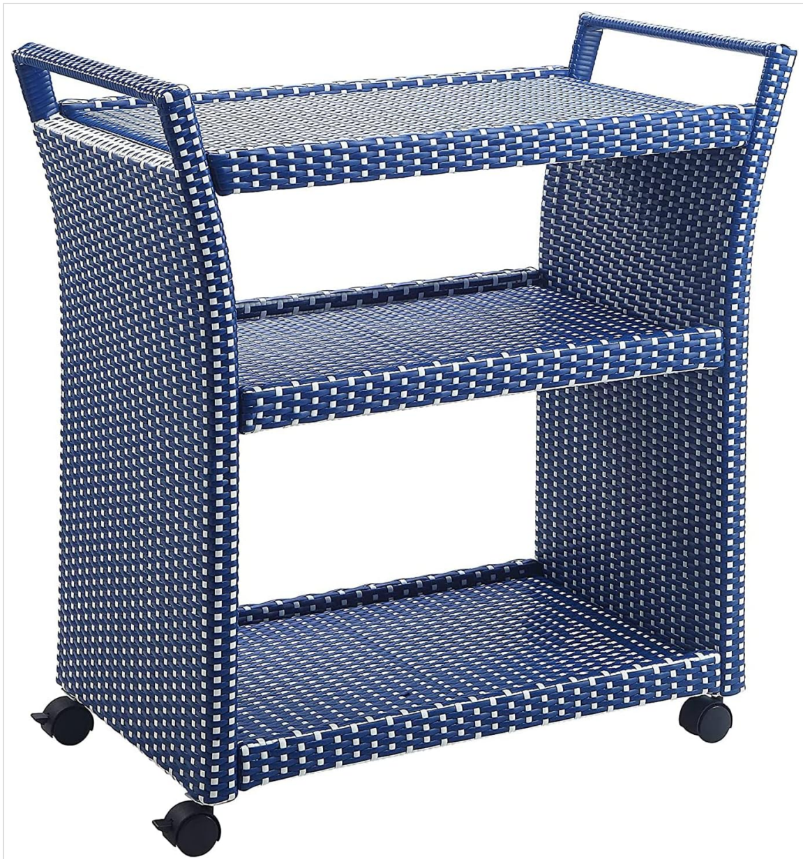
Image: The fully assembled PayLessHere Outdoor PE Wicker Rolling Bar Cart in blue, showcasing its three tiers and casters. This image represents the final product after assembly.