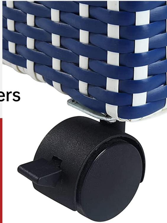
Image: A close-up of the PE wicker material, emphasizing its water resistance. This illustrates the material's durability against outdoor elements.

With 360 rotation, 2 lockable wheels, make the side table easy and convenient to pull in and out