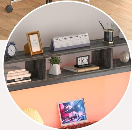
Figure 4.1: The Aheaplus desk configured as a long two-person desk, demonstrating its versatility and ample workspace for collaborative or dual setups.

The detachable top hutch of computer desk reserves more space for your desktop, which greatly improves the utilization rate of the desktop.