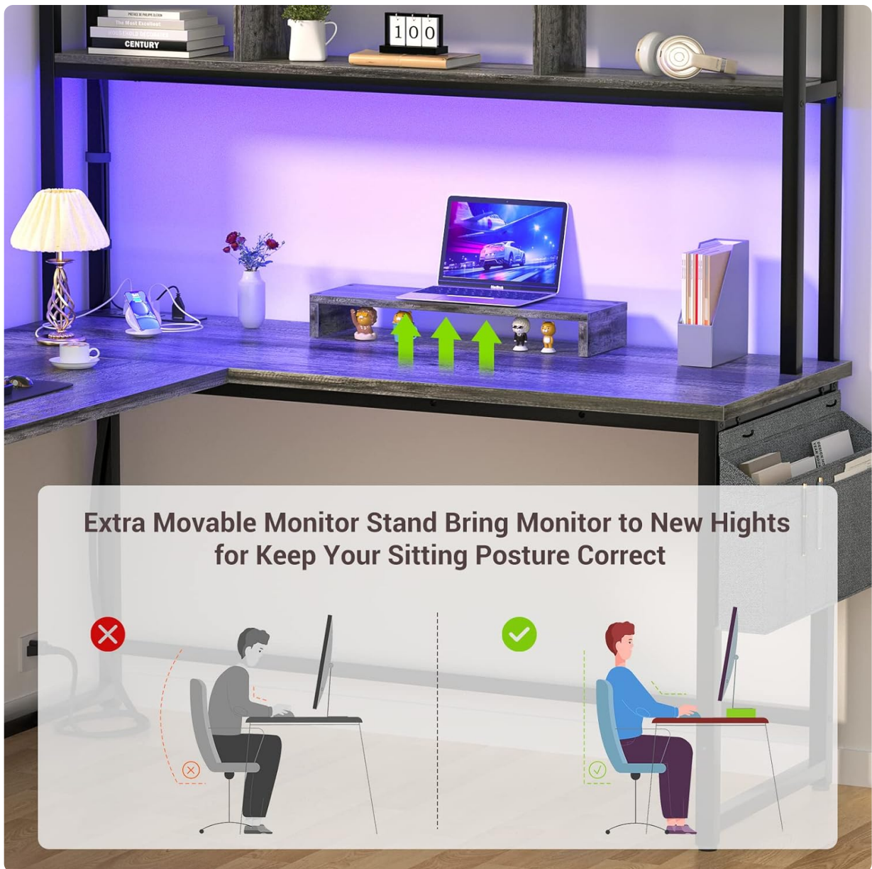
Figure 5.3: A visual guide demonstrating how the moveable monitor stand helps achieve and maintain a correct sitting posture, promoting cervical and spinal health during extended use.