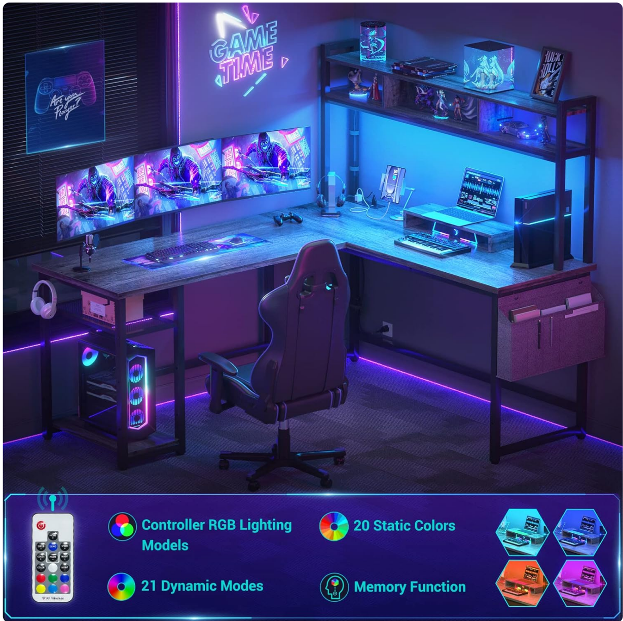
Figure 5.2: The Aheaplus L Shaped Desk illuminated by its LED strip, creating an immersive environment, particularly suitable for gaming setups. The image also shows the remote control for the LED lights.