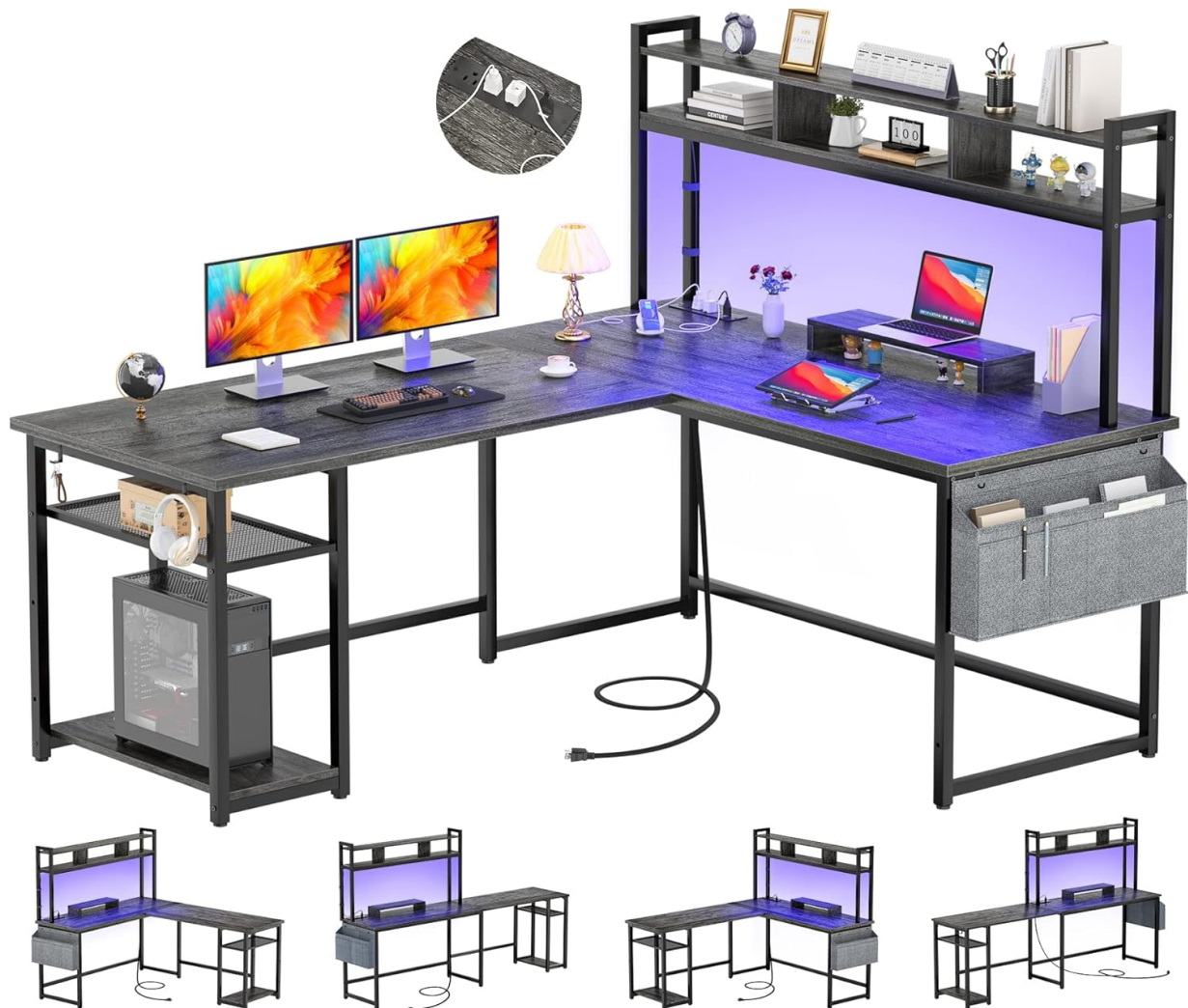
Figure 1.1: The Aheaplus L Shaped Desk, showcasing its L-shape configuration, integrated hutch, LED lighting, and power outlets. This desk is designed for home office, gaming, or general workspace use, offering a spacious and organized environment.