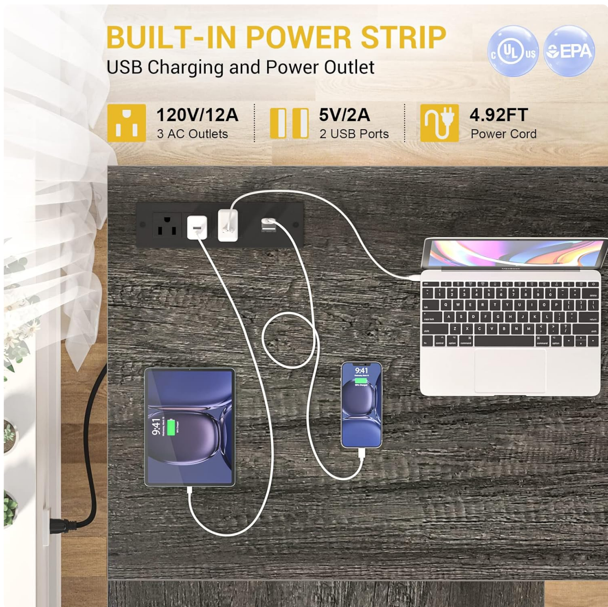
Figure 5.1: A detailed view of the integrated power strip, showing the 3 AC outlets and 2 USB ports, designed for convenient charging and powering of various devices directly from your desk.