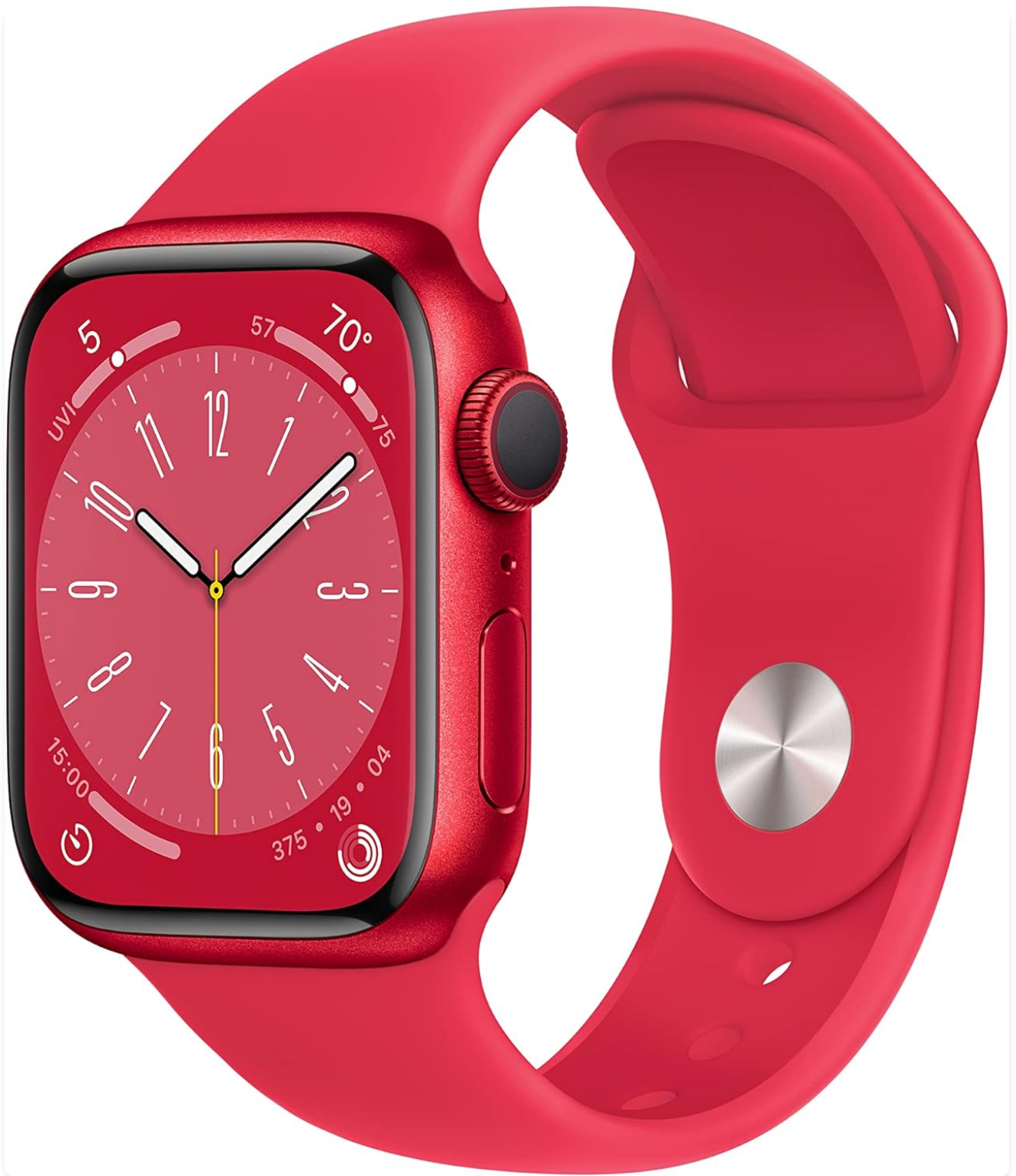
Image: Apple Watch Series 8 in (PRODUCT)RED, showcasing its vibrant display and sport band.