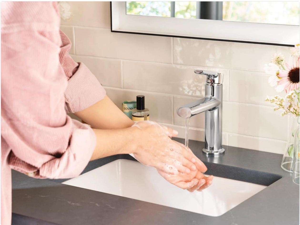
Figure 4: Demonstrating the single-handle operation for water flow and temperature.