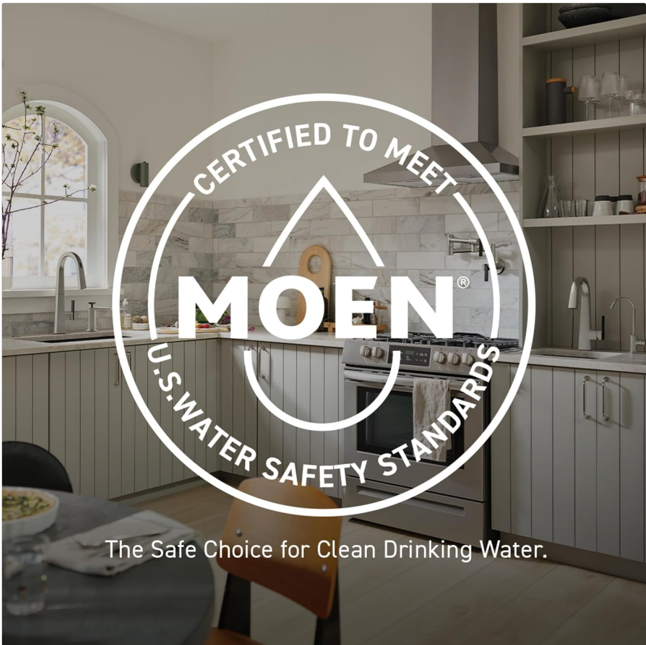
Figure 5: Moen faucets are certified to meet U.S. water safety standards.