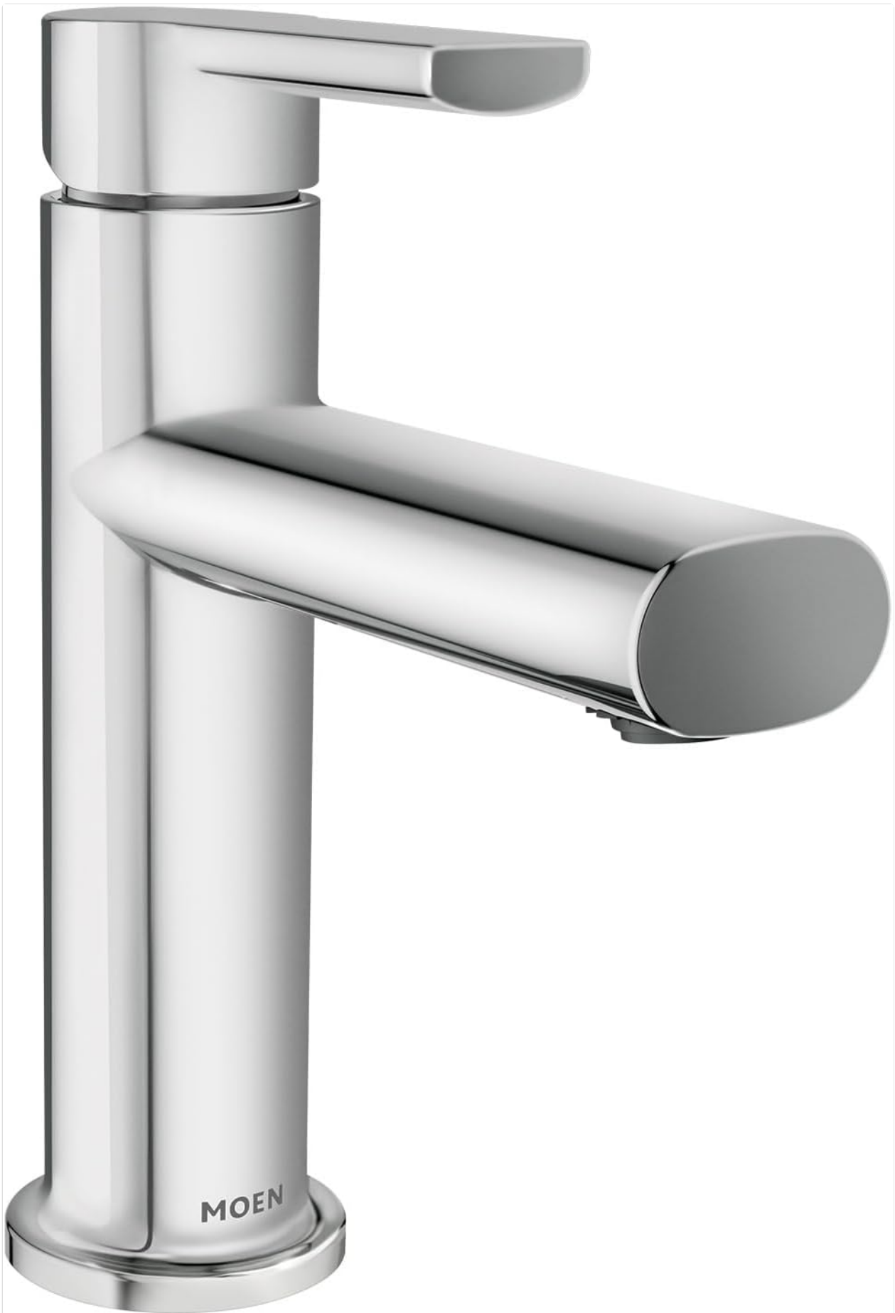
Figure 1: Moen Meena Chrome Single-Handle Bathroom Faucet, Model 84794.