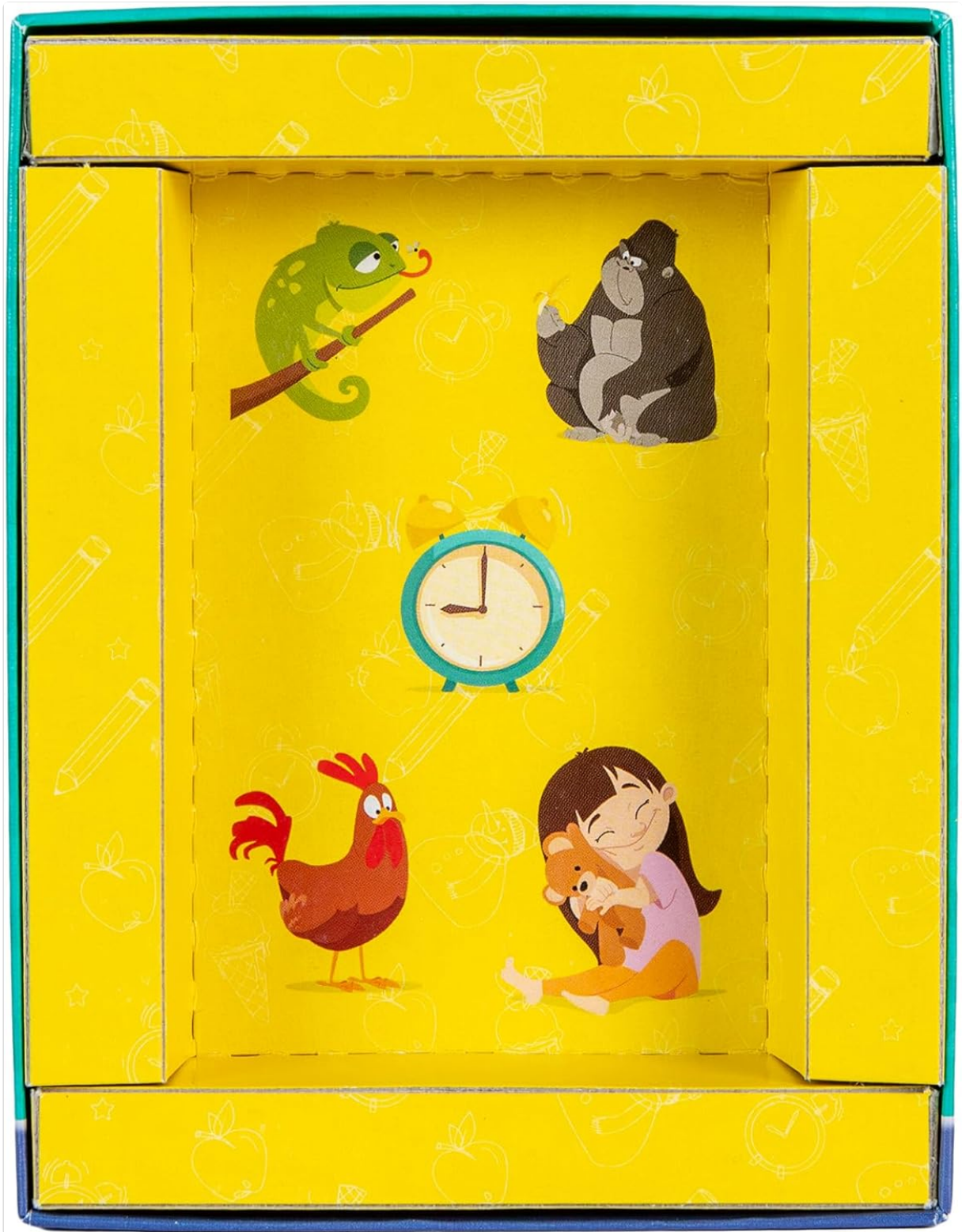
Image: The inside of the game box, featuring colorful illustrations that are similar to those found on the game cards, such as animals and everyday objects.

understand they are looking for a single alteration.