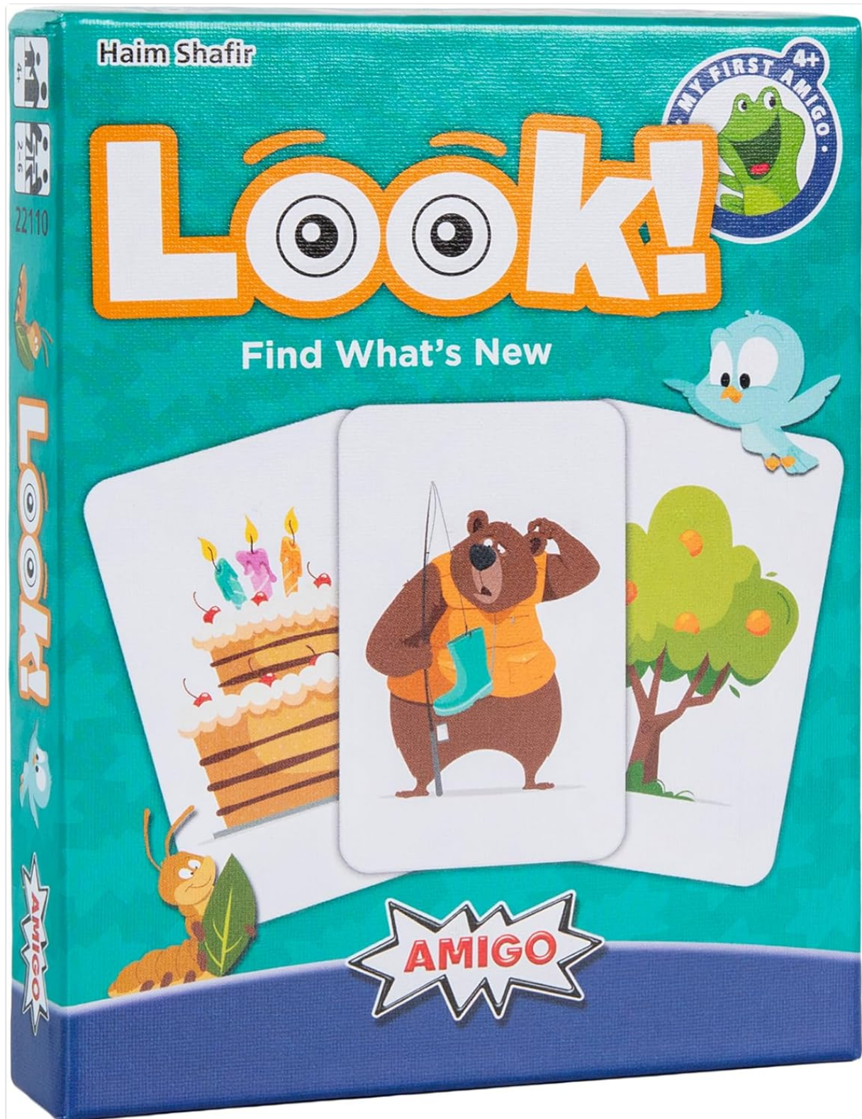
Image: The front of the game box, displaying the game title "Look!" and illustrations of game cards featuring a bear, a cake, and a tree.