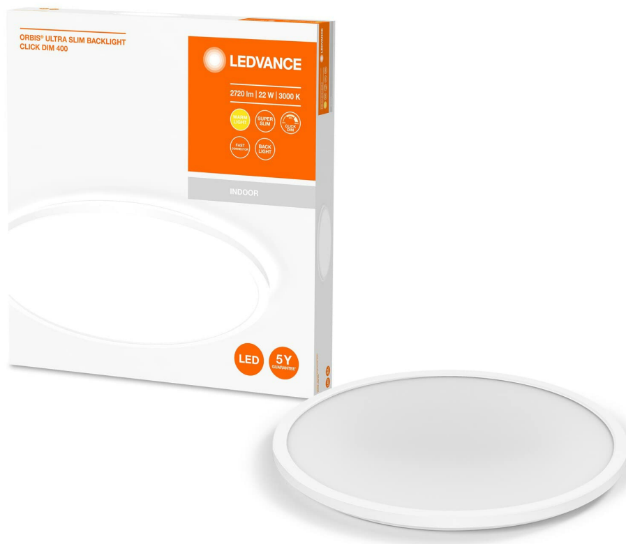
Image 1.1: Front view of the LEDVANCE ORBIS Ultra Slim 400mm Ceiling Light.