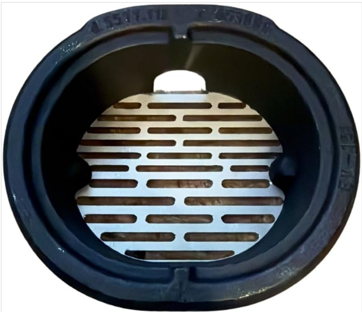
Figure 3: Internal view of the EDILKAMIN R656200 burn pot, illustrating the grate structure from below.