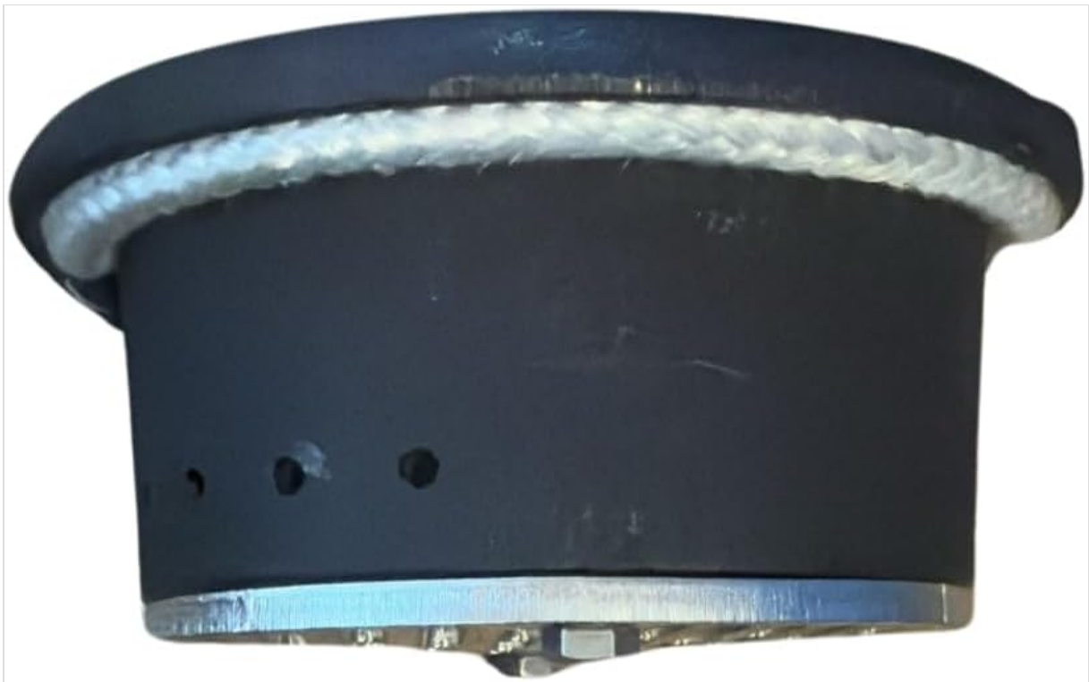
Figure 2: Side view of the EDILKAMIN R656200 burn pot, highlighting the integrated gasket and air intake holes.