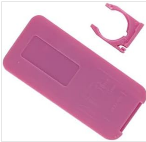
Image: Back view of the remote control, illustrating the battery compartment. The compartment cover is typically located on the lower half of the remote's back side.