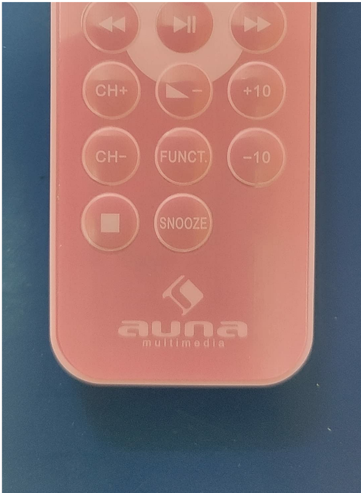
Image: Front view of the remote control, displaying its buttons. Key functions include Power, Mute, Volume Up/Down, Channel/Track navigation, Play/Pause, and Input/Function selection.