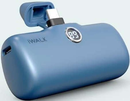
Image: A visual guide showing the iWALK portable charger’s compatibility with a range of USB-C devices from brands like Samsung, LG, and Google, along with a note indicating compatibility with iPhone 15/16 series.