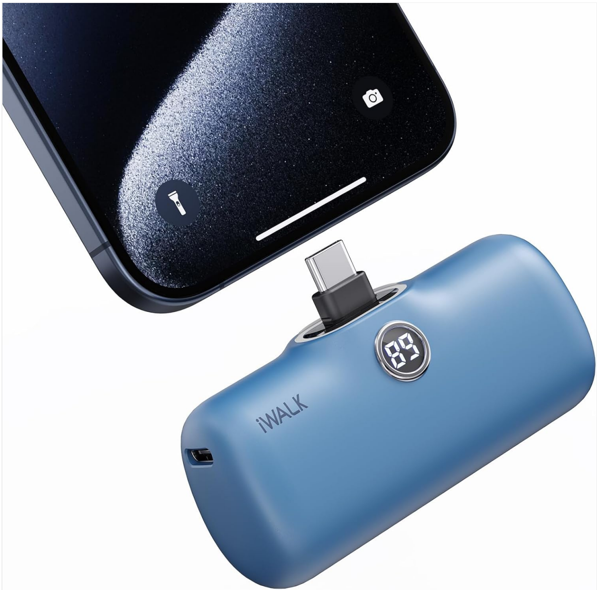
Image: The iWALK USB-C Portable Charger, Model DBL5000PC, in blue, directly plugged into the bottom of a smartphone. The charger's digital display shows "89".