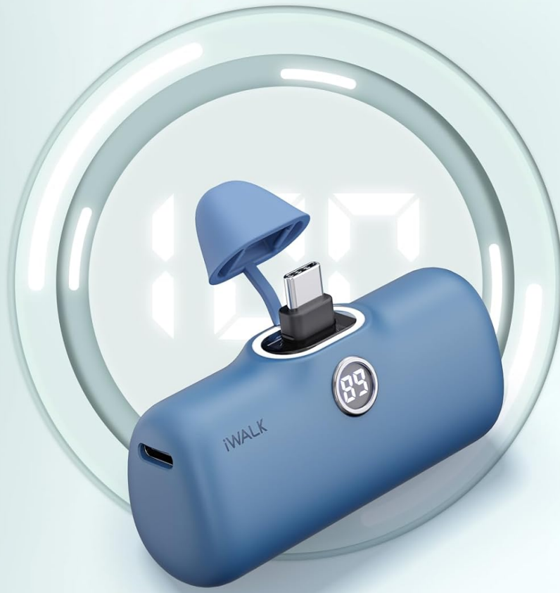
Image: A close-up of the iWALK portable charger highlighting its digital display, which shows the number "89" to indicate the current battery percentage.