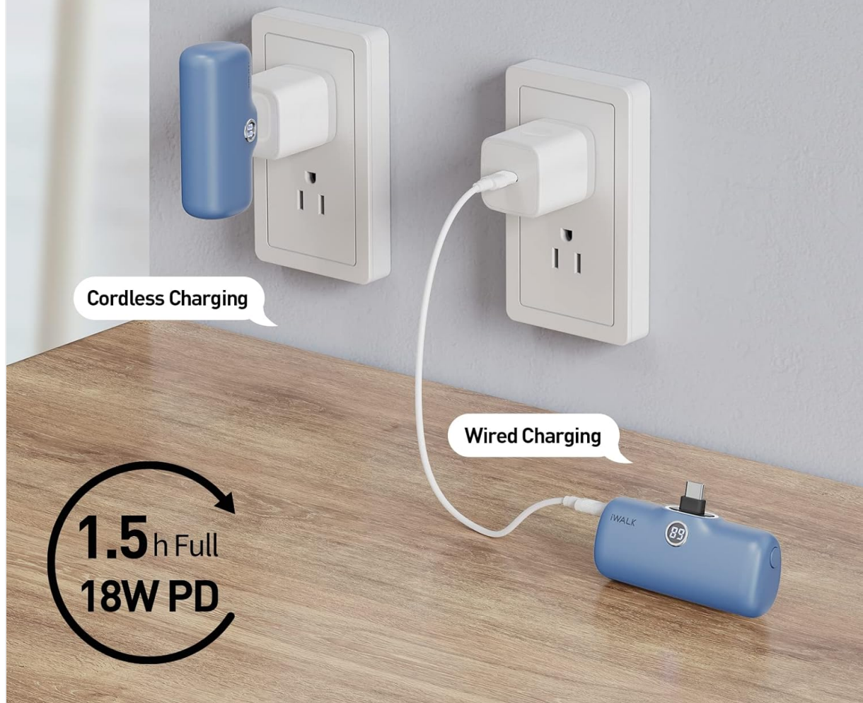
Image: Two iWALK portable chargers demonstrating charging methods. One is plugged directly into a wall adapter (cordless charging), and another is connected to a wall adapter via a USB-C cable (wired charging).