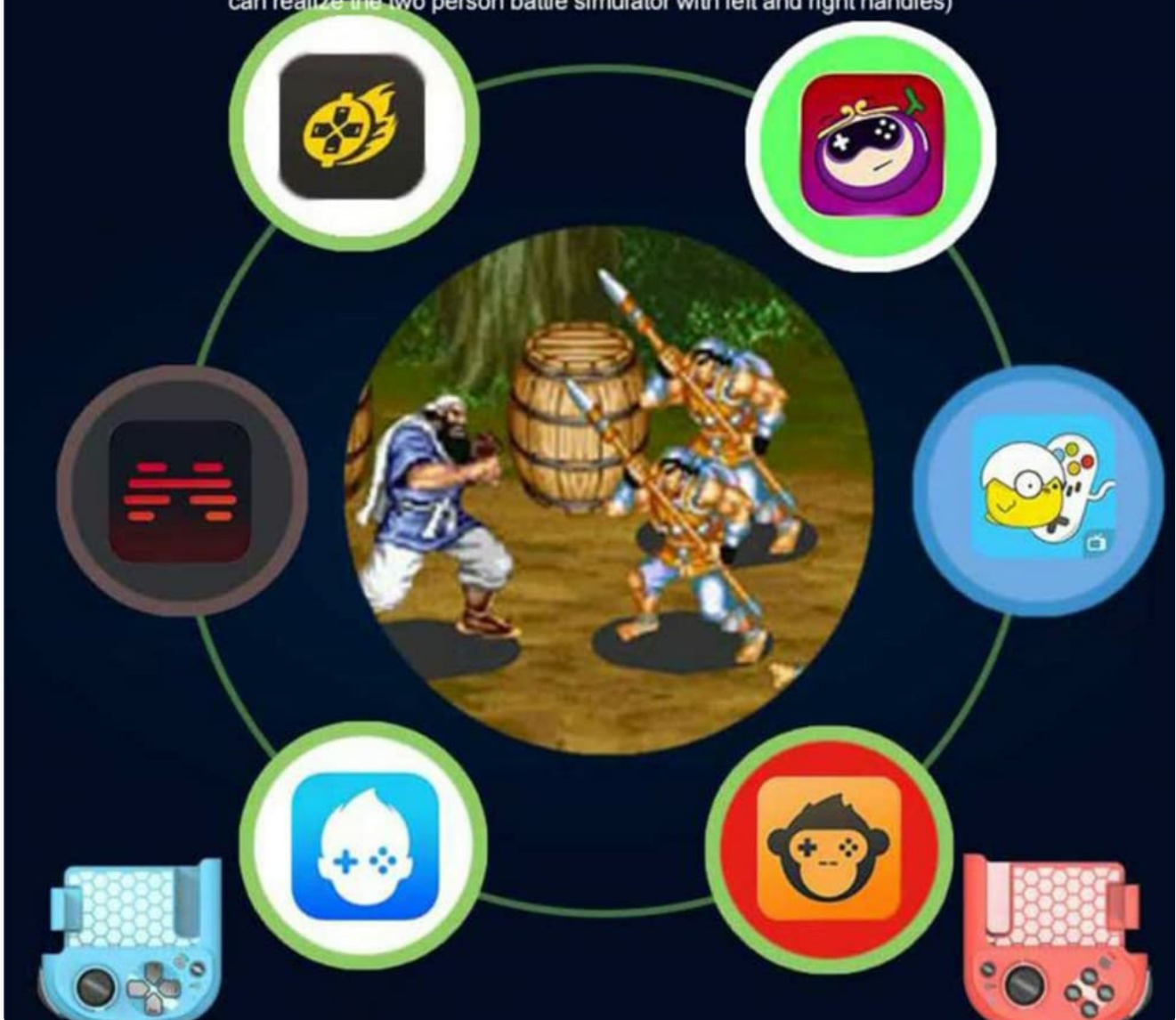
Image: A diagram illustrating the MOCUTE-061 gamepad's compatibility with multiple game halls and its ability to support various game types, including two-person battle simulators.

Mocute handle can be used in multiple game halls, Android: Beitong game hall can be used to realize more combo functions, and apple / Android can play simulator games (Android and apple can realize the two person battle simulator with left and right handles)