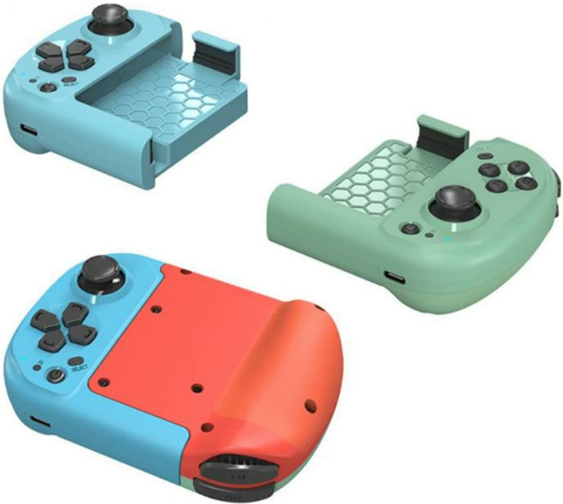
Image: The MOCUTE-061 gamepad in a compact, stored configuration, highlighting its portability and ease of storage when not in use.