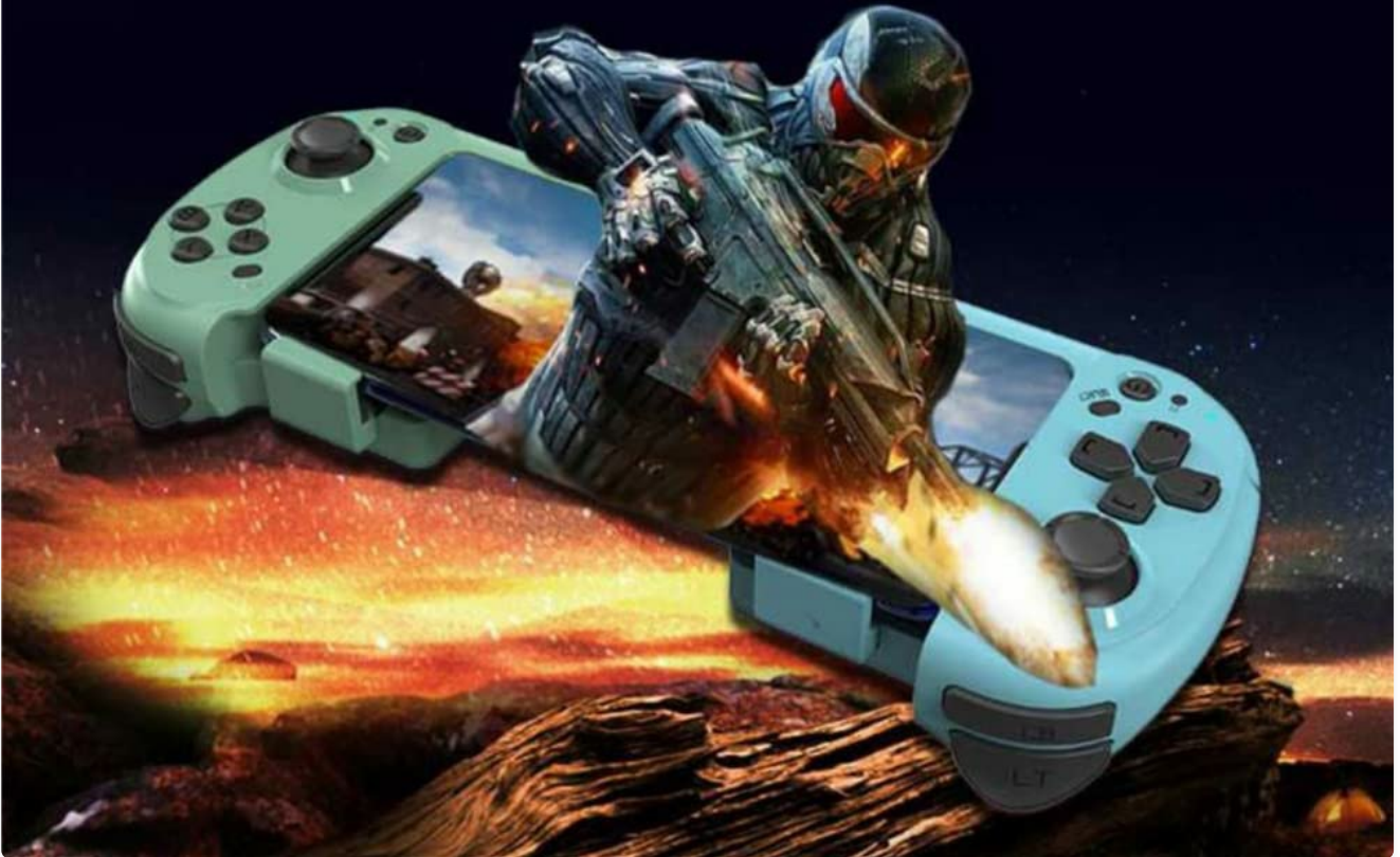
Image: The MOCUTE-061 gamepad with a smartphone securely inserted, demonstrating its split wireless handle design for integrated mobile gaming.

Left and right split design to achieve different combinations of different games