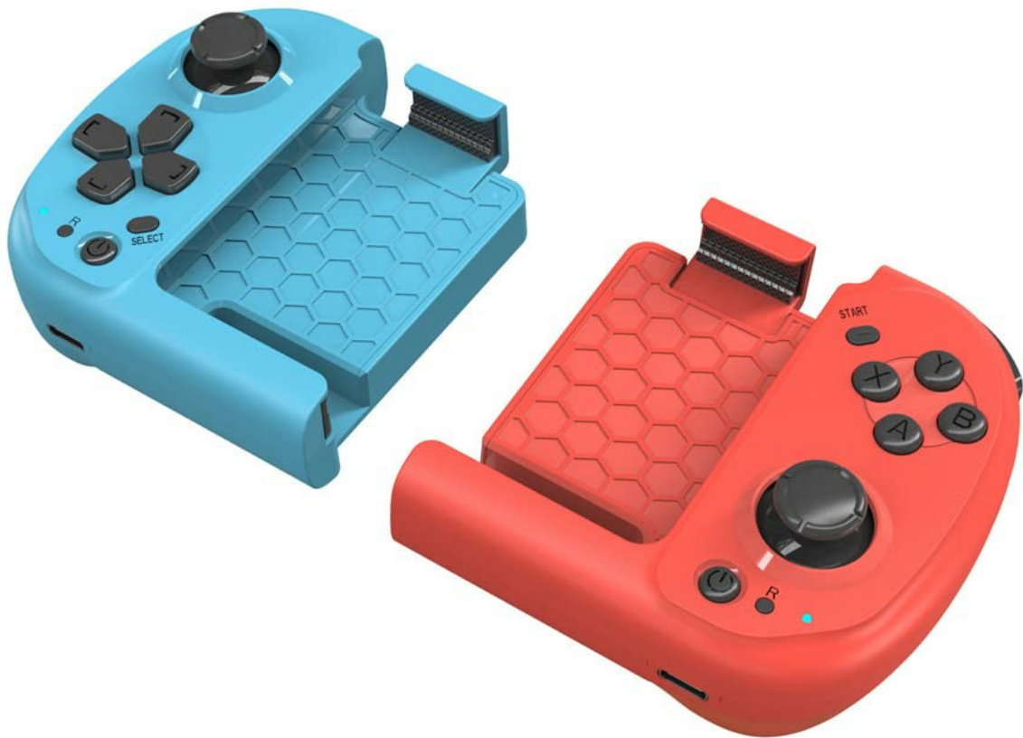
Image: The MOCUTE-061 gamepad separated into its left (blue) and right (red) components, ready for assembly or individual use.