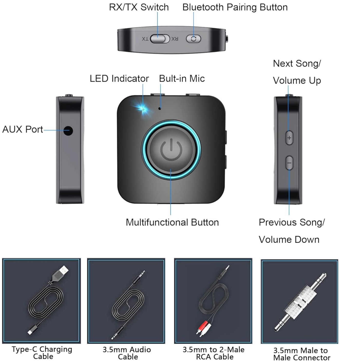
Figure 1: Product Diagram and Included Accessories

This image displays the LAICOMEIN V5.0 2-in-1 Wireless Adapter along with its various connection cables and adapters, including the Type-C charging cable, 3.5mm audio cable, 3.5mm to 2-male RCA cable, and a 3.5mm male-to-male connector. It also highlights the RX/TX switch, Bluetooth pairing button, LED indicator, built-in mic, AUX port, and multifunctional button for volume and track control.