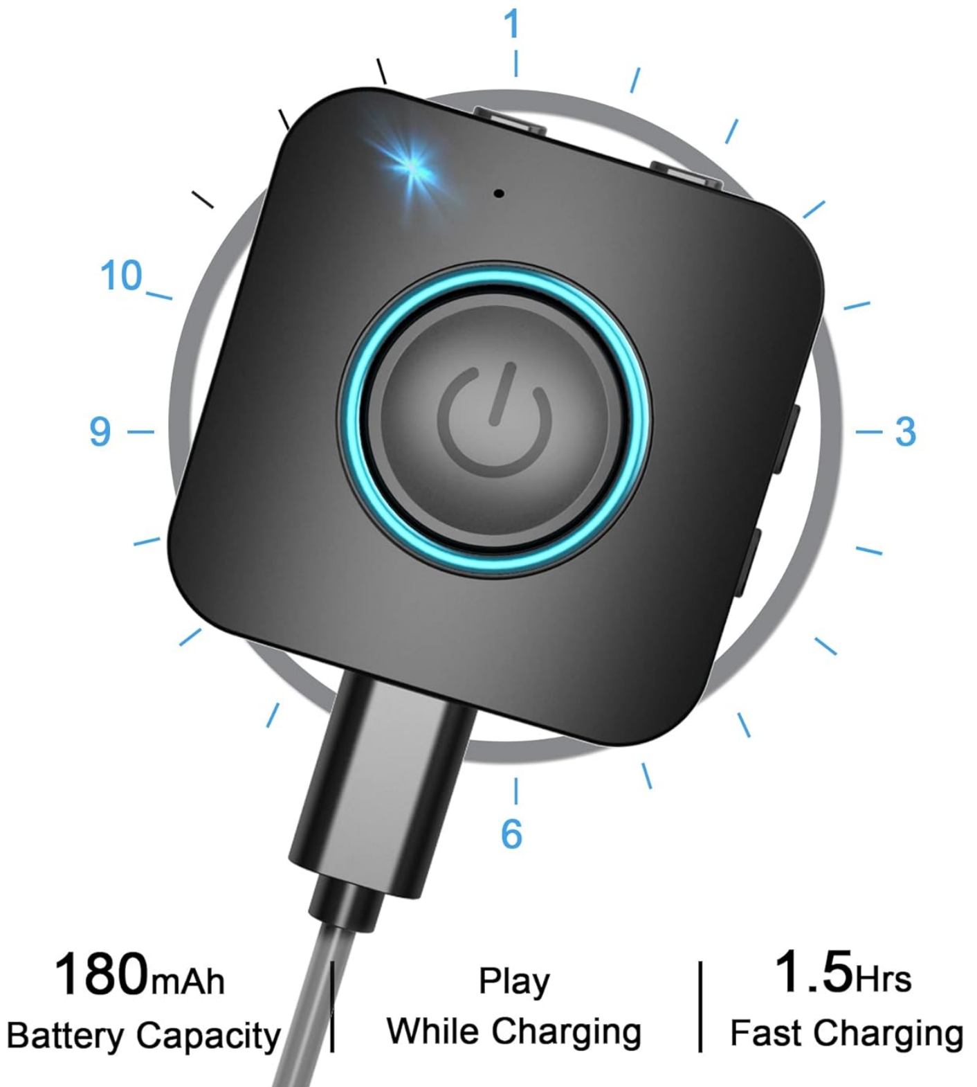
Figure 2: Charging and Battery Life Overview

This image illustrates the charging capability and battery performance of the LAICOMEIN V5.0 adapter. It shows the device connected via its Type-C charging port, highlighting its 180mAh battery capacity, the ability to play while charging, and a fast charging time of 1.5 hours, providing up to 10 hours of working time.