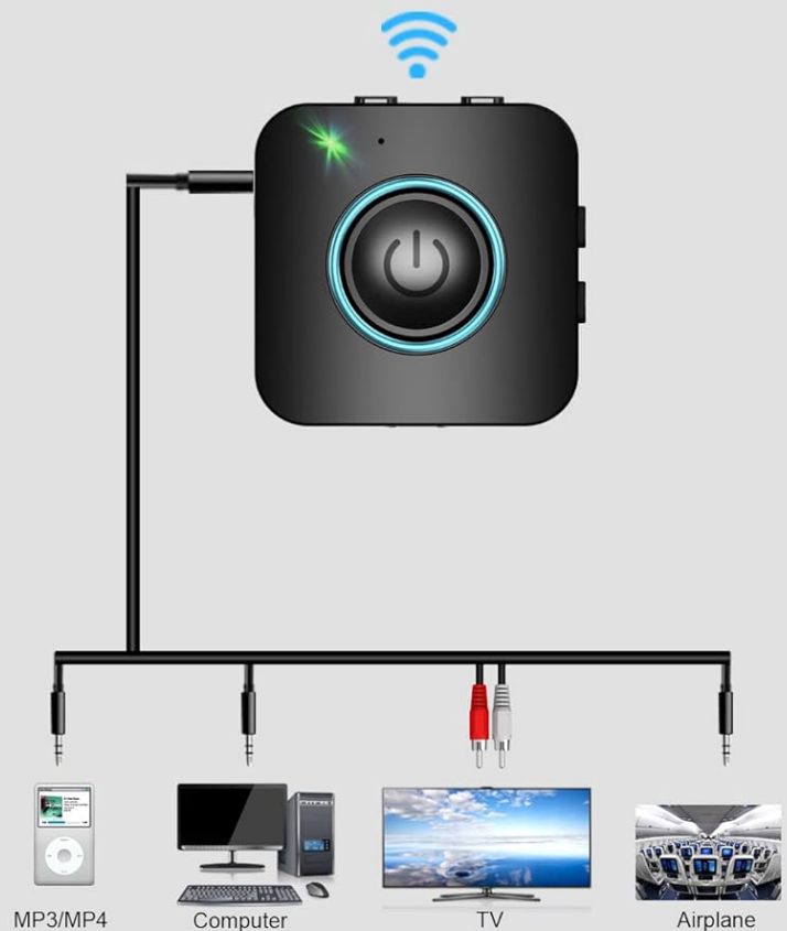
Figure 5: 2-in-1 Bluetooth Transmitter Receiver Modes

This diagram visually explains the dual functionality of the LAICOMEIN V5.0 Bluetooth adapter. On the left, it shows the Receiver (RX) mode, where the adapter connects to wired headphones, speakers, or car audio systems to receive Bluetooth signals from devices like phones, tablets, or laptops. On the right, it depicts the Transmitter (TX) mode, where the adapter connects to non-Bluetooth sources such as MP3/MP4 players, computers, TVs, or airplanes, and transmits audio to Bluetooth speakers, headphones, or soundbars.