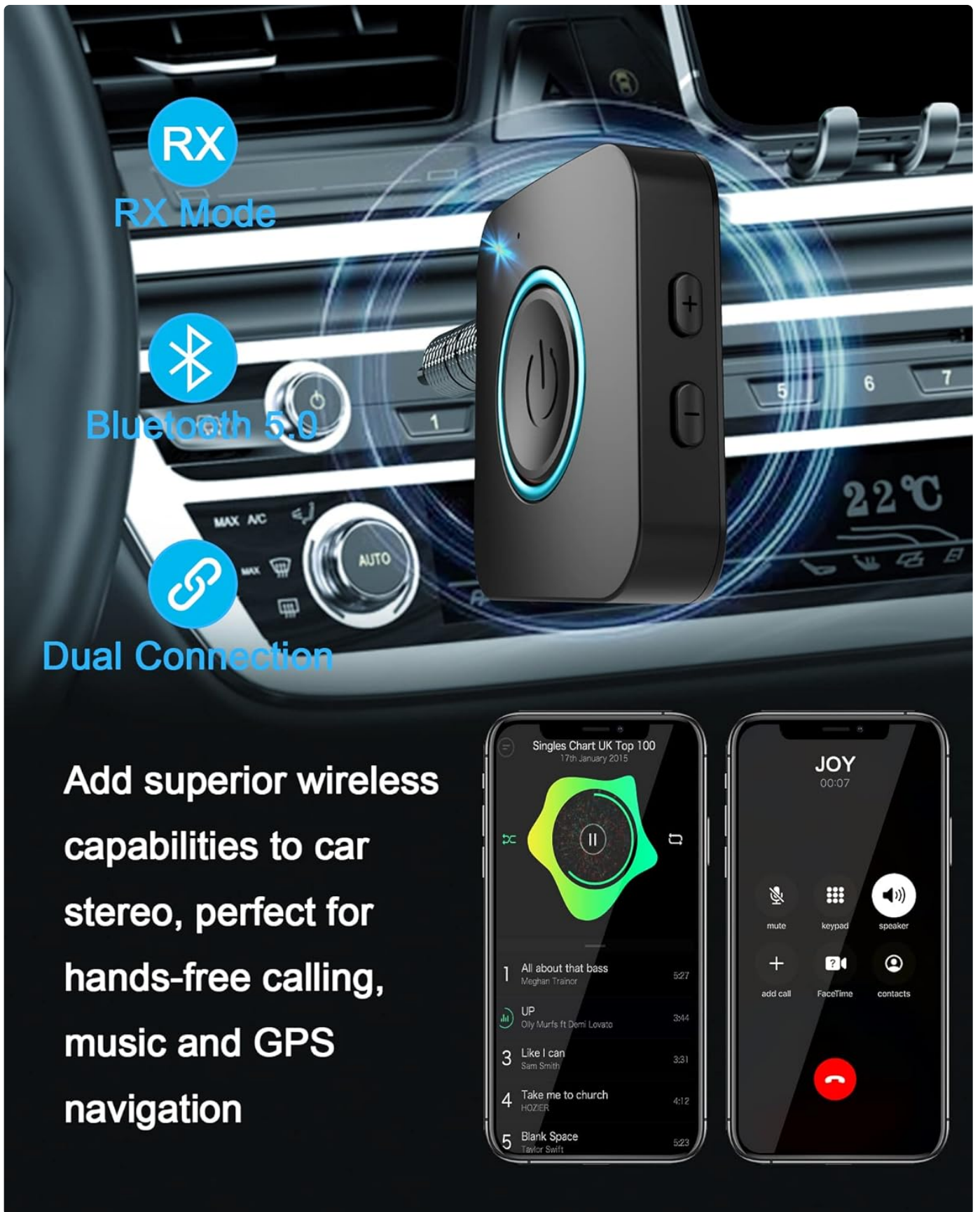
Figure 4: RX Mode Usage Example (Car)

This image illustrates the LAICOMEIN V5.0 adapter in Receiver (RX) mode, connected to a car's audio system. A smartphone is shown displaying a music application, indicating that audio is being wirelessly streamed from the phone to the car's speakers via the adapter, enabling hands-free calling and music playback.