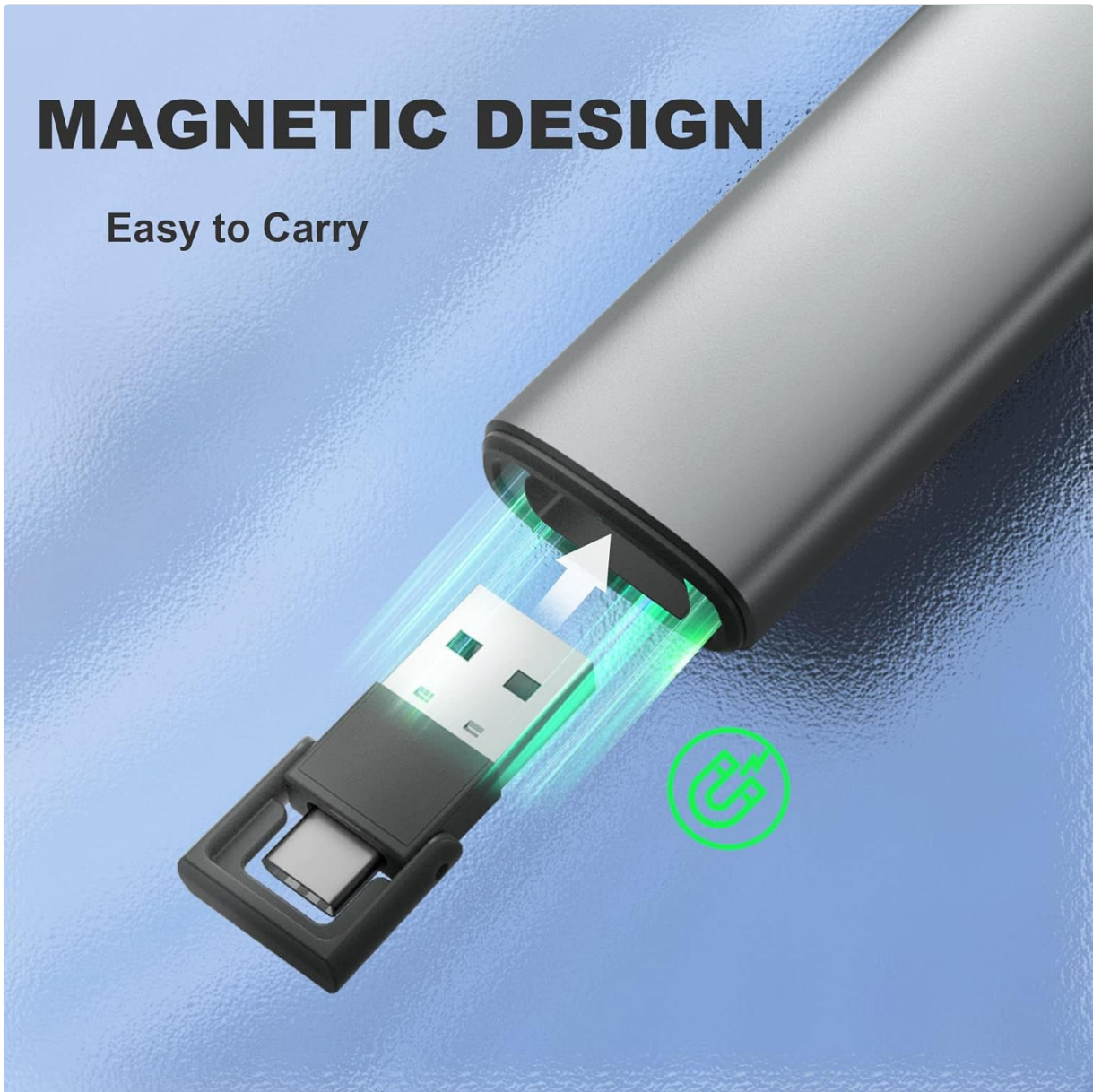
Image 2.2: The magnetic design allows for secure storage of the USB receiver within the clicker body.