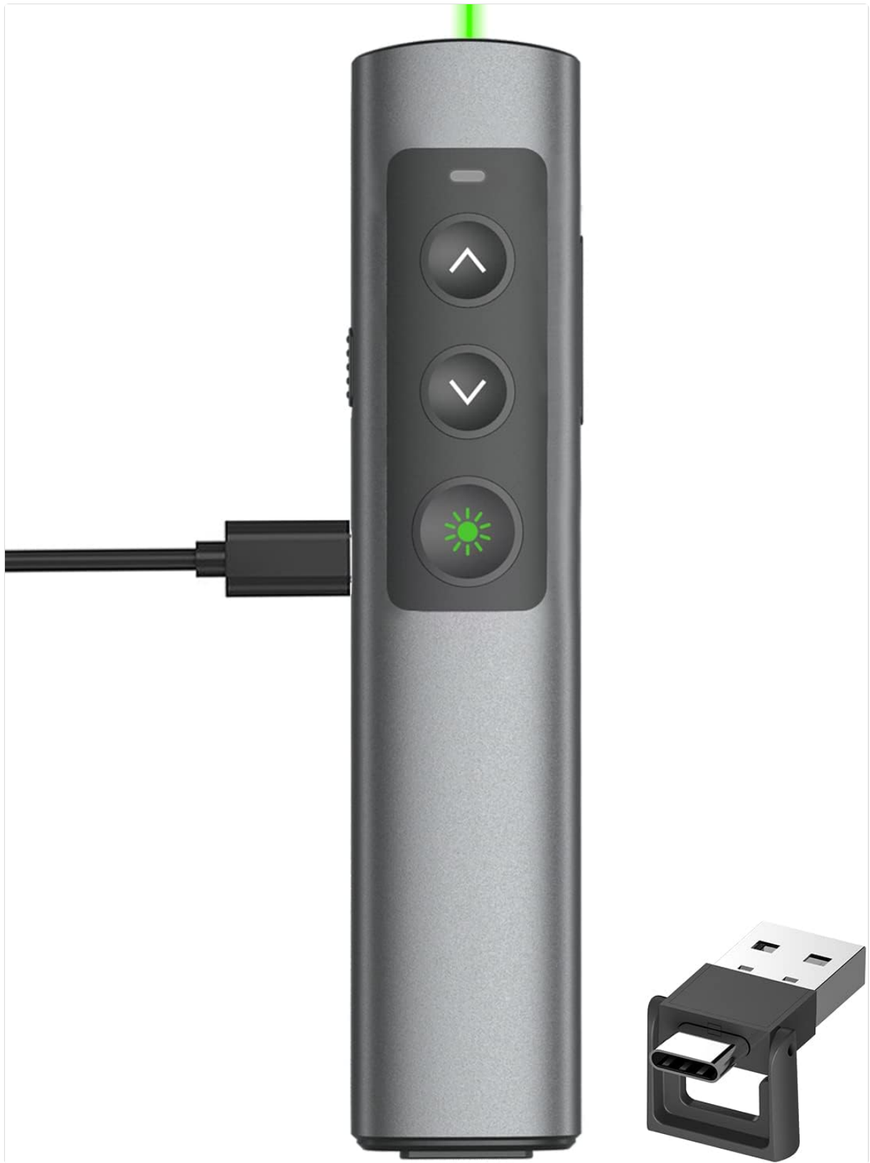
Image 1.1: The CLIKBUTM BYJ76-G Presentation Clicker, showcasing its sleek design.