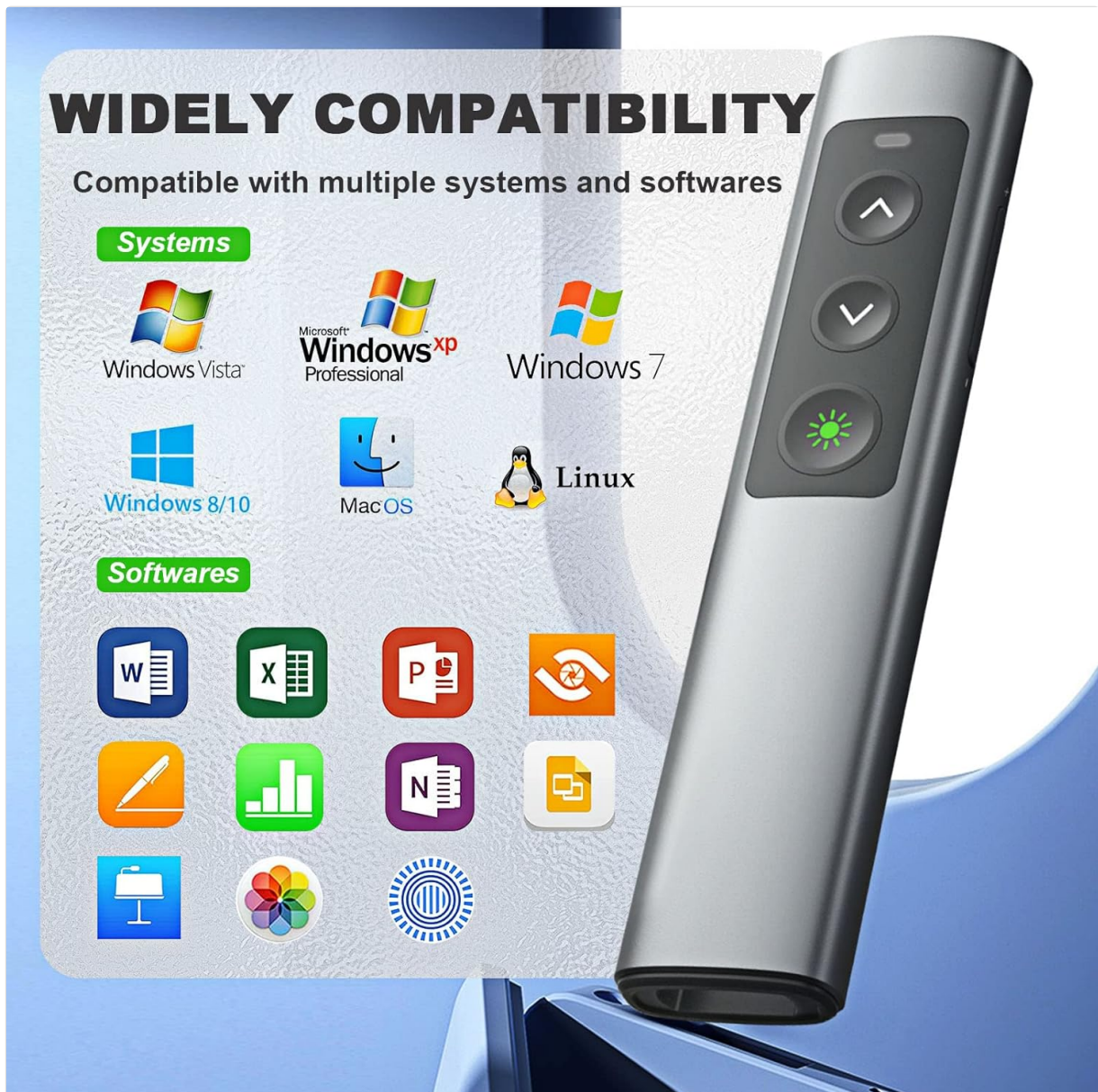
Image 6.1: Visual representation of the clicker's compatibility with various systems and applications.