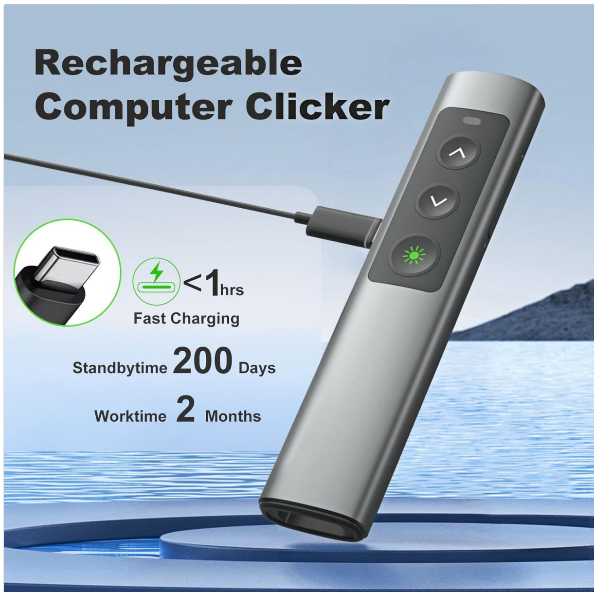
Image 5.1: The presentation clicker being charged via its USB-C port.