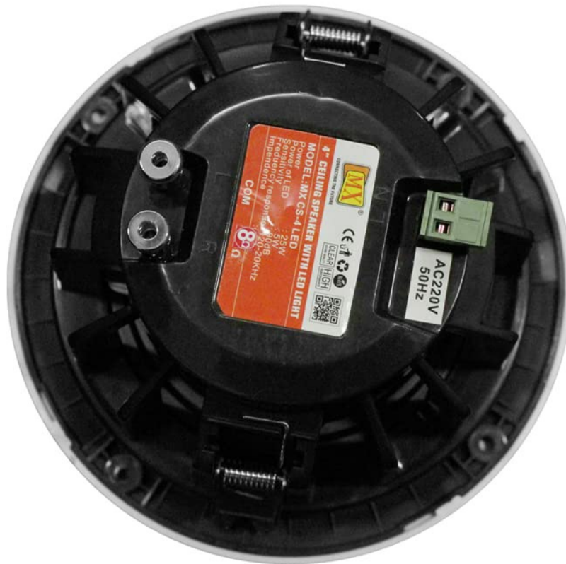
Image 1: Rear view of the MX CS-4 L ceiling speaker, illustrating the audio input terminals and the AC power connection for the LED light.