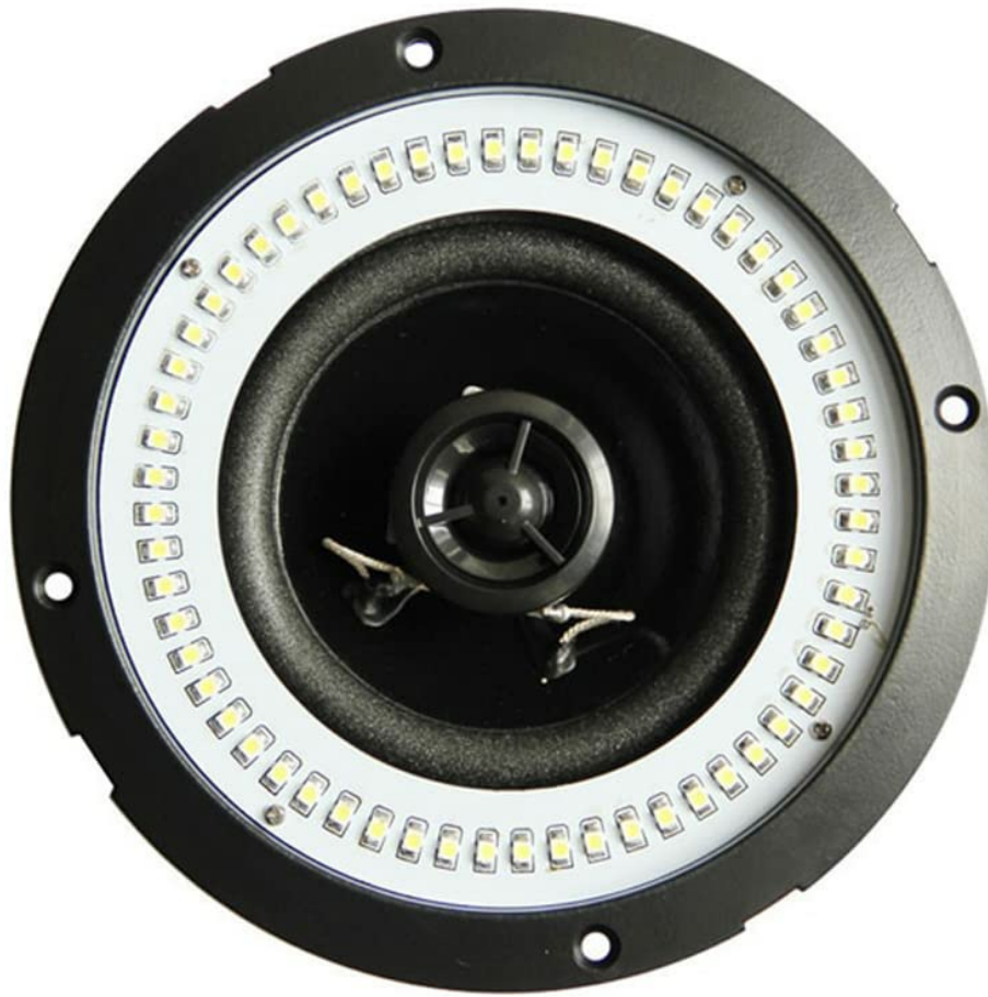
Image 2: Front view of the MX CS-4 L ceiling speaker with the grill removed, highlighting the integrated LED light ring and the spring-loaded mounting clips.