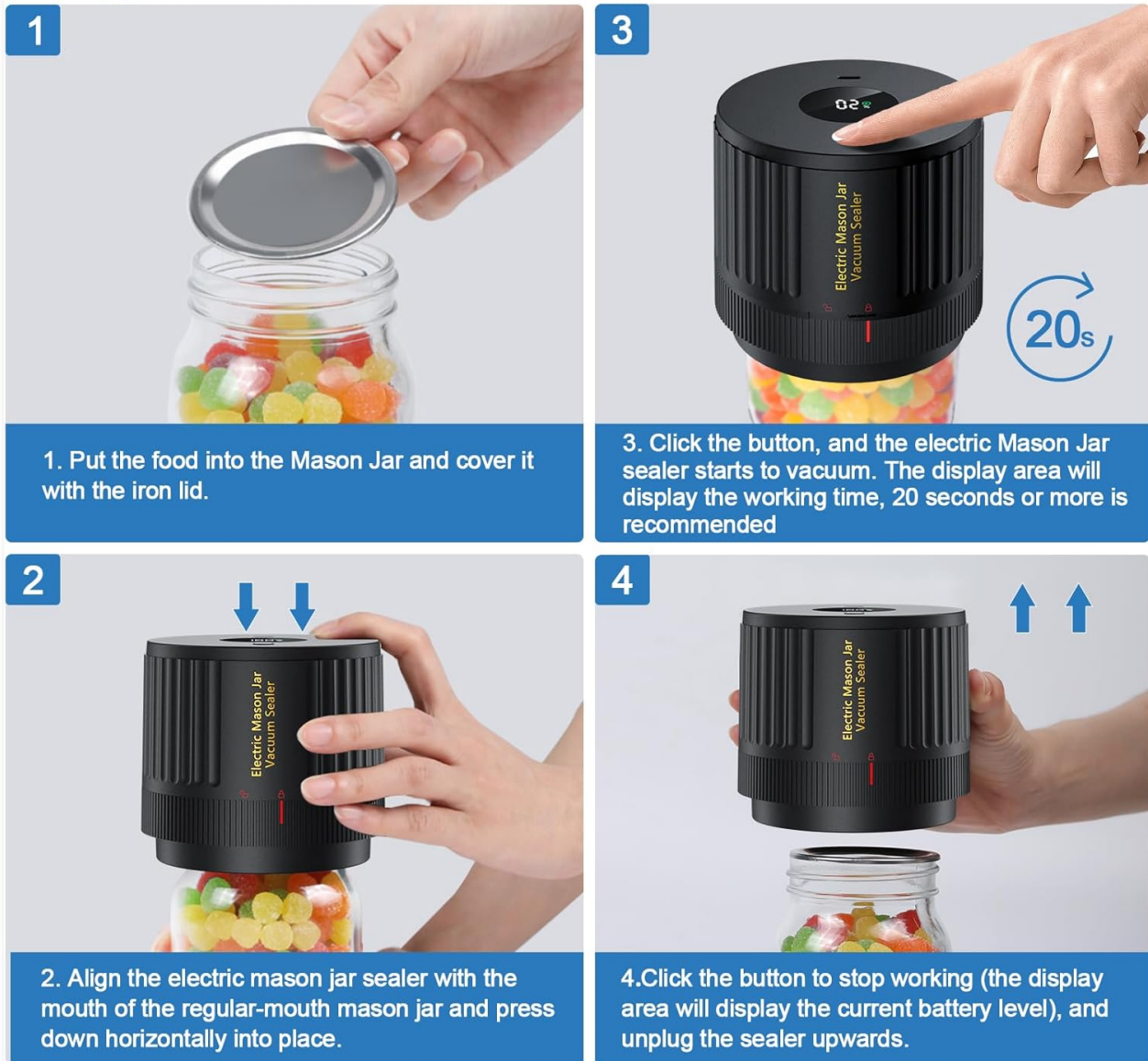
Image: Visual instructions for regular mouth jar sealing. Steps include placing the lid, aligning the sealer, pressing the button to start (displaying working time), and lifting the sealer after completion.