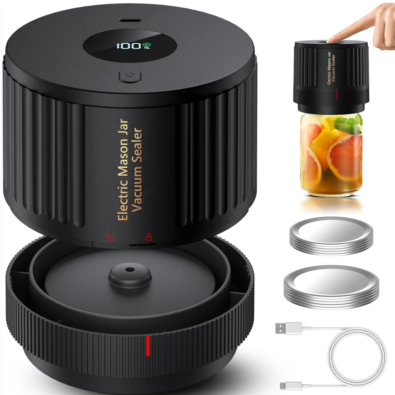
Image: The Electric Mason Jar Vacuum Sealer Kit, showing the main sealer unit, the regular mouth adapter, two types of jar lids, and a USB charging cable. This kit is designed for both wide mouth and regular mouth mason jars.