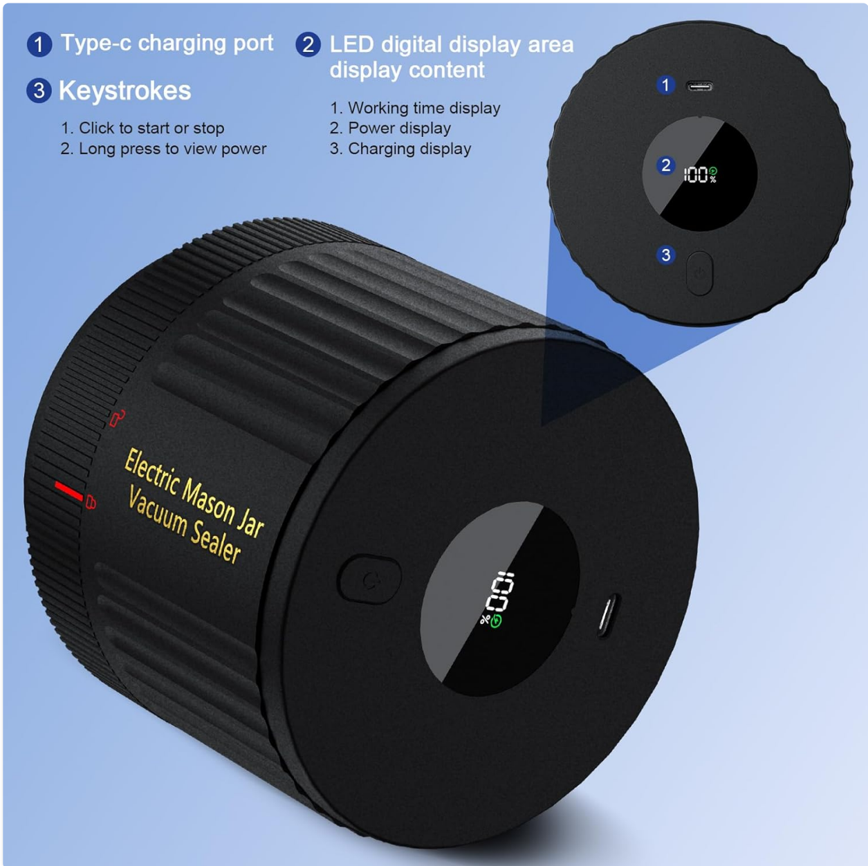
Image: Detailed view of the sealer's top. Labelled are the Type-C charging port (1), the LED digital display area (2) which shows working time, power, and charging status, and the Keystrokes button (3) for starting/stopping and viewing power.

Image: Exploded view of the Electric Mason Jar Vacuum Sealer, highlighting the main unit (Wide Mouth Sealer) and the detachable Regular Mouth Seal Converter. The red arrow indicates the direction to attach or detach the converter.