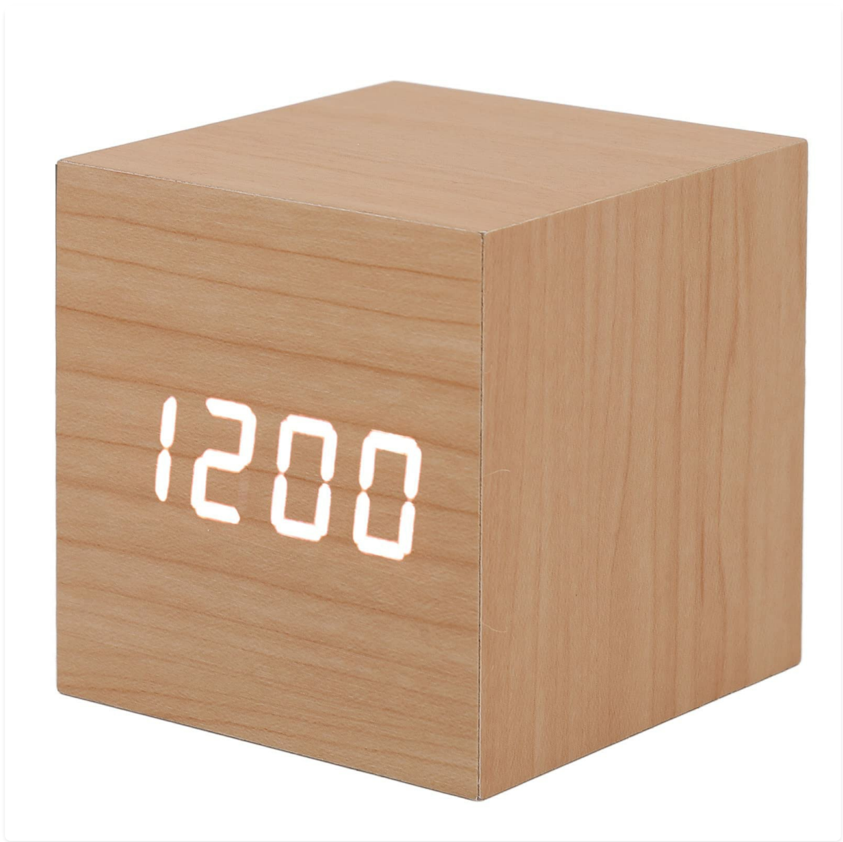
Image 1.1: The Luqeeq Digital Wooden Alarm Clock in a home setting.