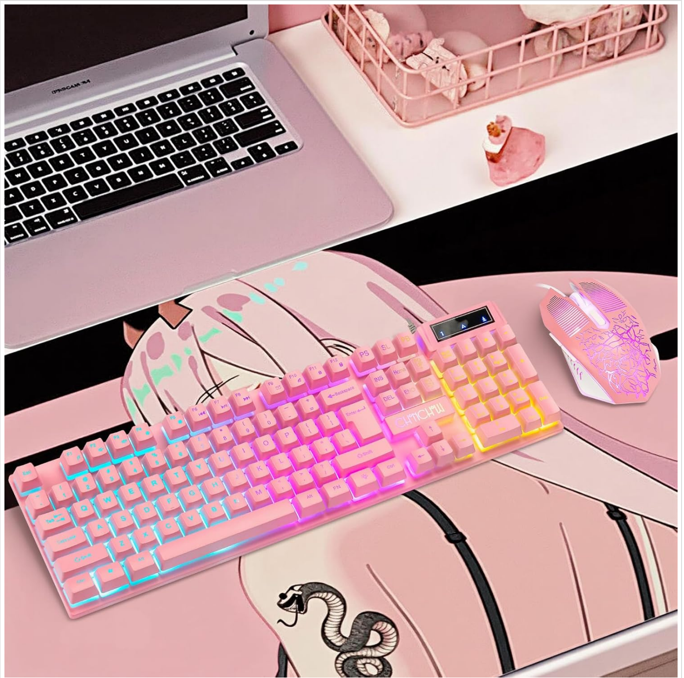
Image: A close-up of the pink keyboard keys, illustrating the crater structure design for improved tactile feedback and response.