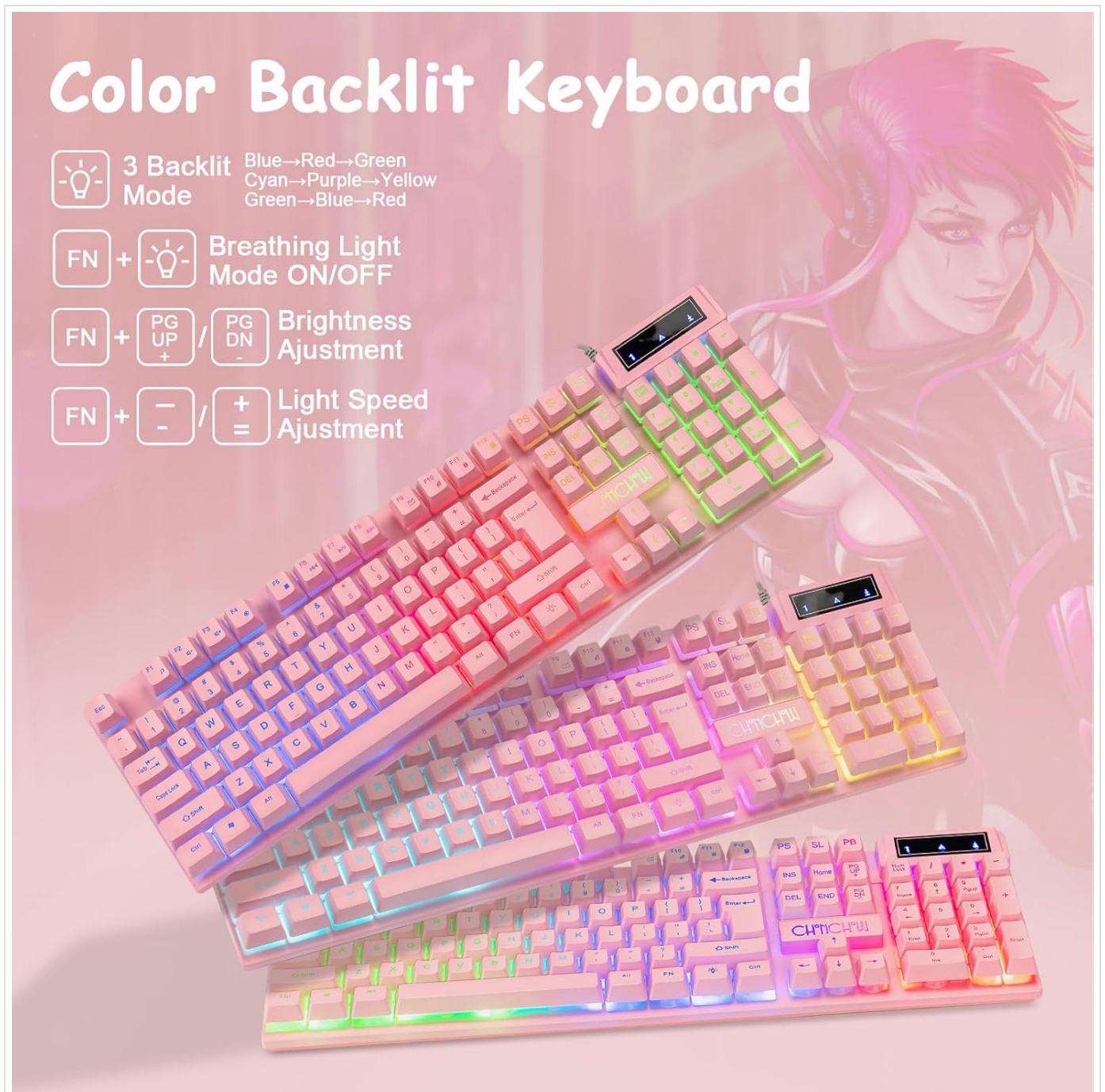
Image: The pink gaming keyboard displaying various LED backlight modes. The image highlights the keys used for controlling the lighting effects.