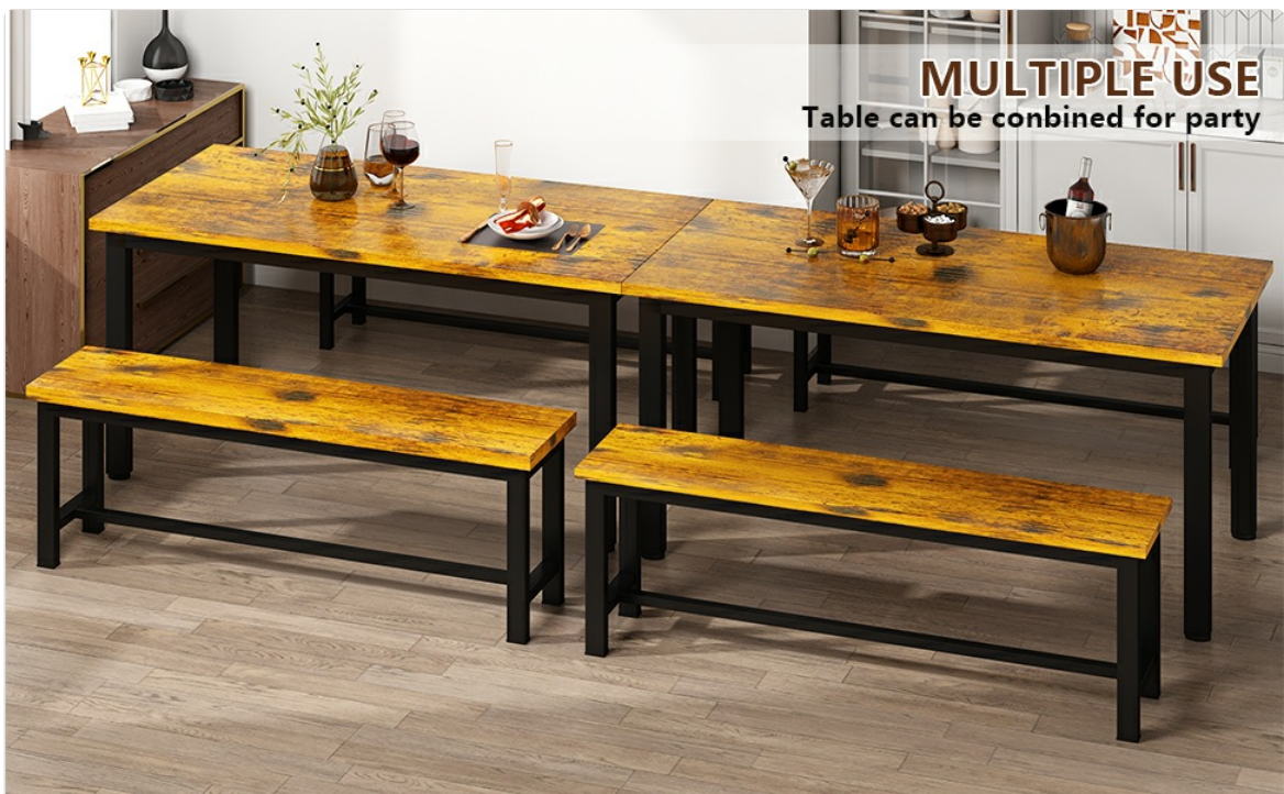
Image: Illustration of multiple AWQM dining sets being combined for larger gatherings or extended use.