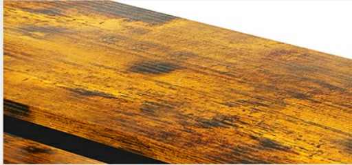
Image: Detailed view showing the spacious surface and the stable metal frame construction.

Thickened metal tubes are used to ensure the stability of the table.