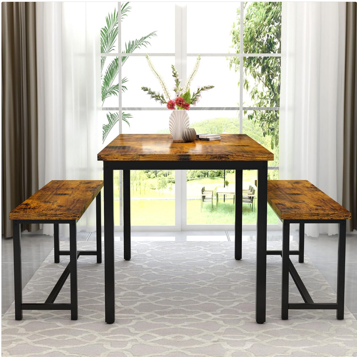
Image: The AWQM 47" Dining Table Set, featuring a brown wooden tabletop and black metal legs, accompanied by two matching benches.