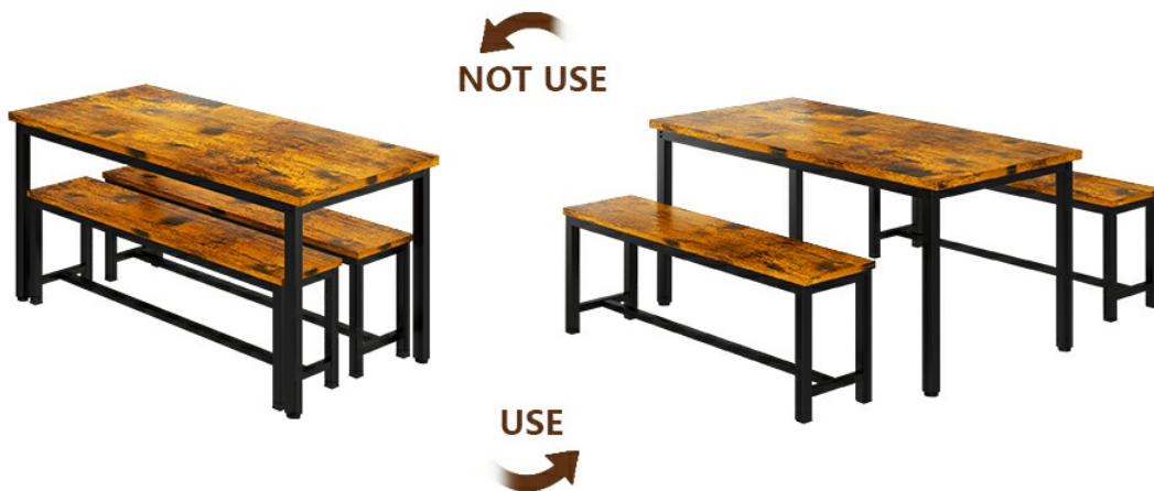
Image: Demonstration of the space-saving feature, showing benches being stored under the table.

Benches can be placed under the table suitable.