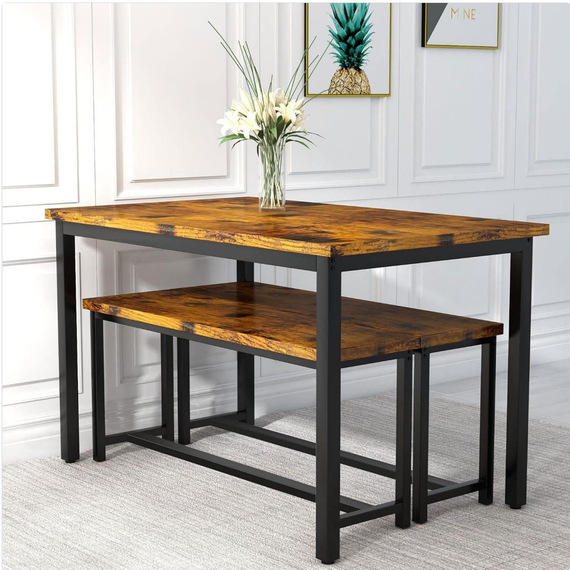
Image: The space-saving design of the AWQM dining set, showing benches stored under the table.