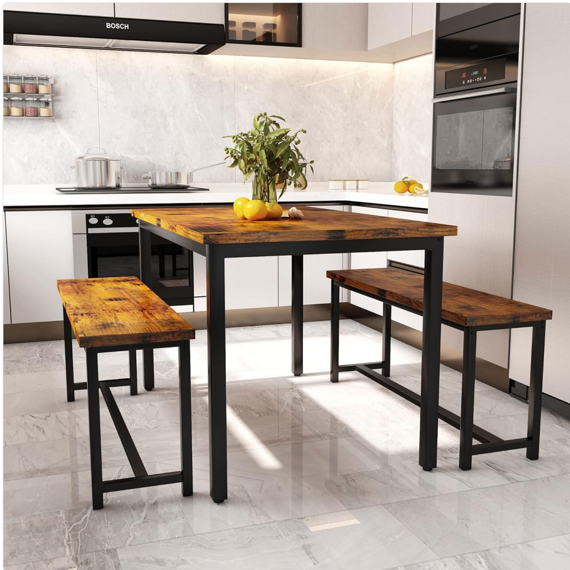
Image: The AWQM dining set in a kitchen, illustrating the assembled product.