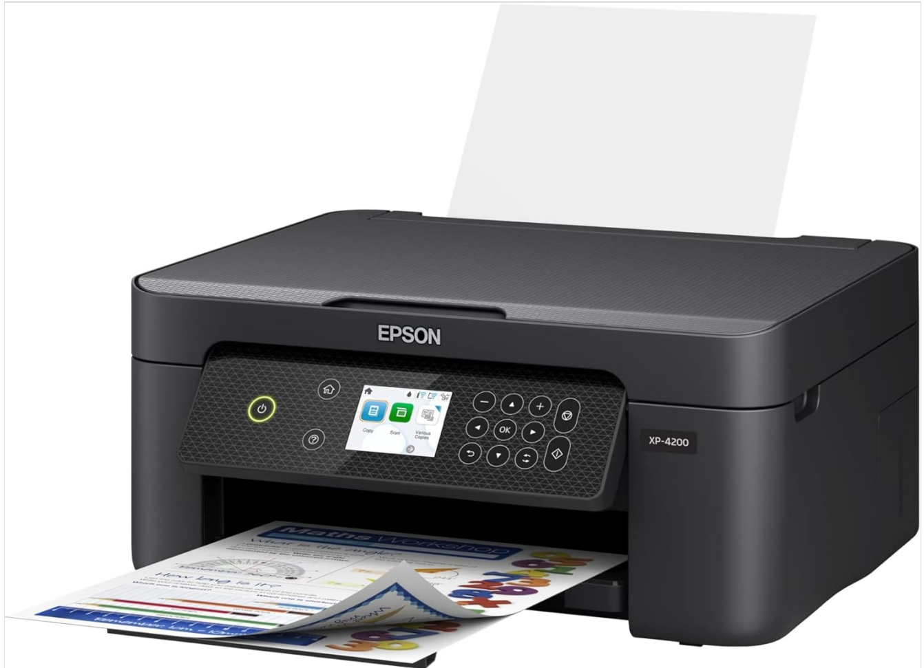
Figure 5.1: Epson Genuine Ink Promise. Use only genuine Epson-brand cartridges.

The printer uses individual ink cartridges, allowing you to replace only the color that runs out. When an ink cartridge is low or expended, a message will appear on the display. Open the printer cover, remove the old cartridge, and insert a new genuine Epson cartridge until it clicks into place.