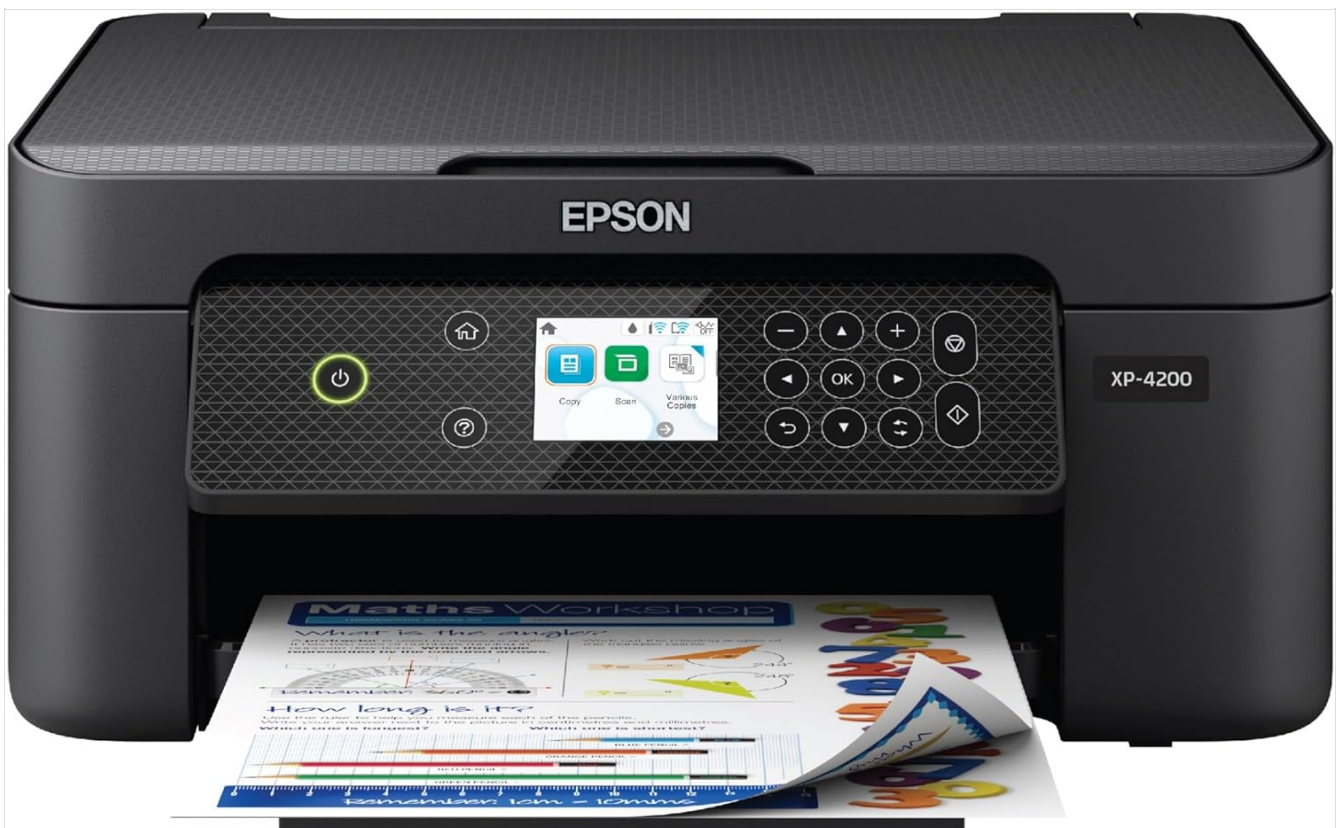
Figure 1.1: Epson Expression Home XP-4200 All-in-One Printer

The Epson Expression Home XP-4200 is a versatile all-in-one printer designed for everyday home and photo printing. It offers high-quality printing, scanning, and copying functionalities with convenient wireless connectivity.