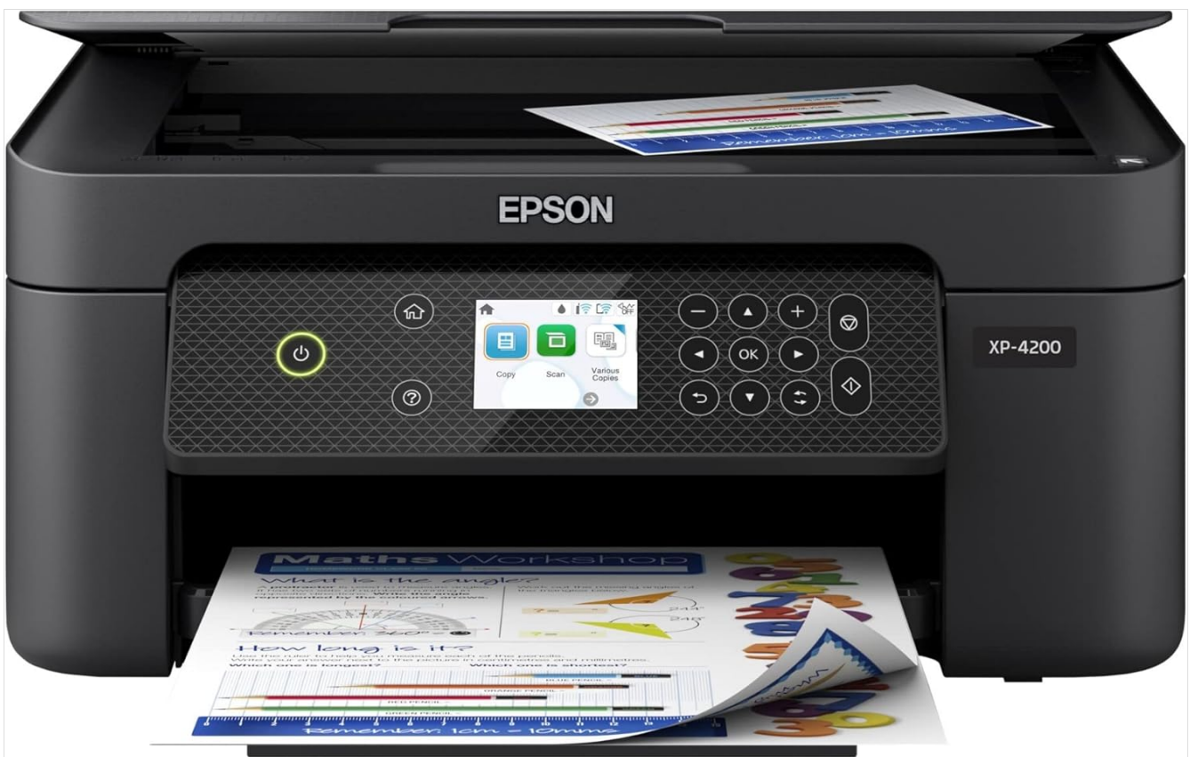
Figure 3.1: Printer with top cover open for ink cartridge installation.

Open the printer cover to access the ink cartridge area. Insert the included Claria® 232 ink cartridges (Black, Cyan, Magenta, Yellow) into their corresponding slots. Ensure they click into place. Close the printer cover.