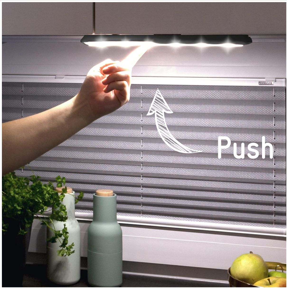
Figure 6.1: A hand demonstrating the push-to-activate function of the Mobina Push 30 LED light, installed under a cabinet.