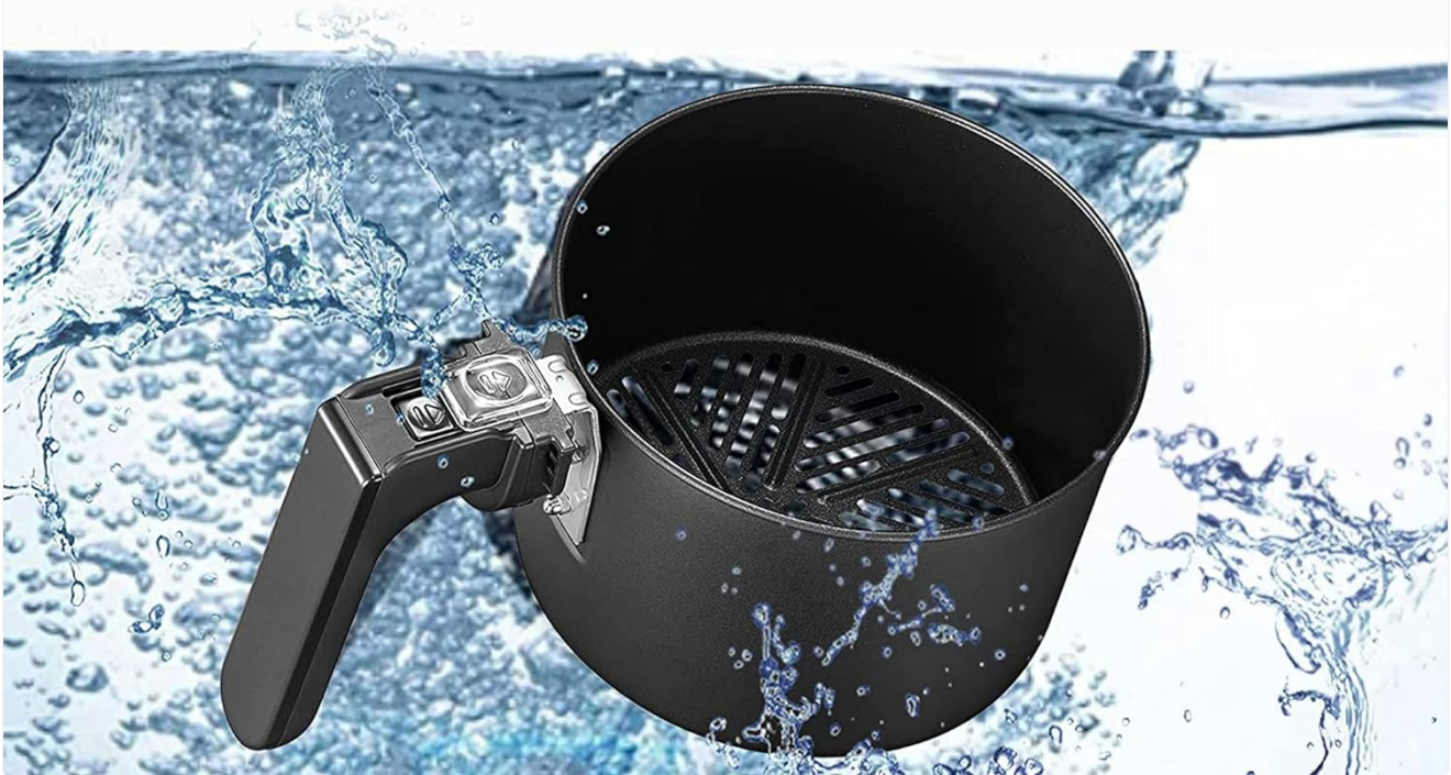
Figure 2: Side view illustrating the air fryer's design and components.