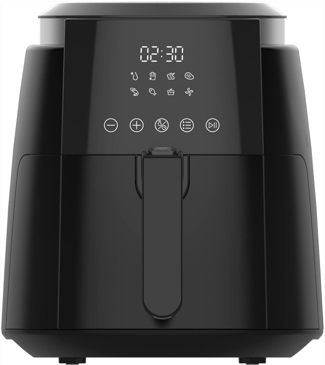
Figure 1: Front view of the KUMTEL HAF-02 Digital XL Air Fryer with digital display.