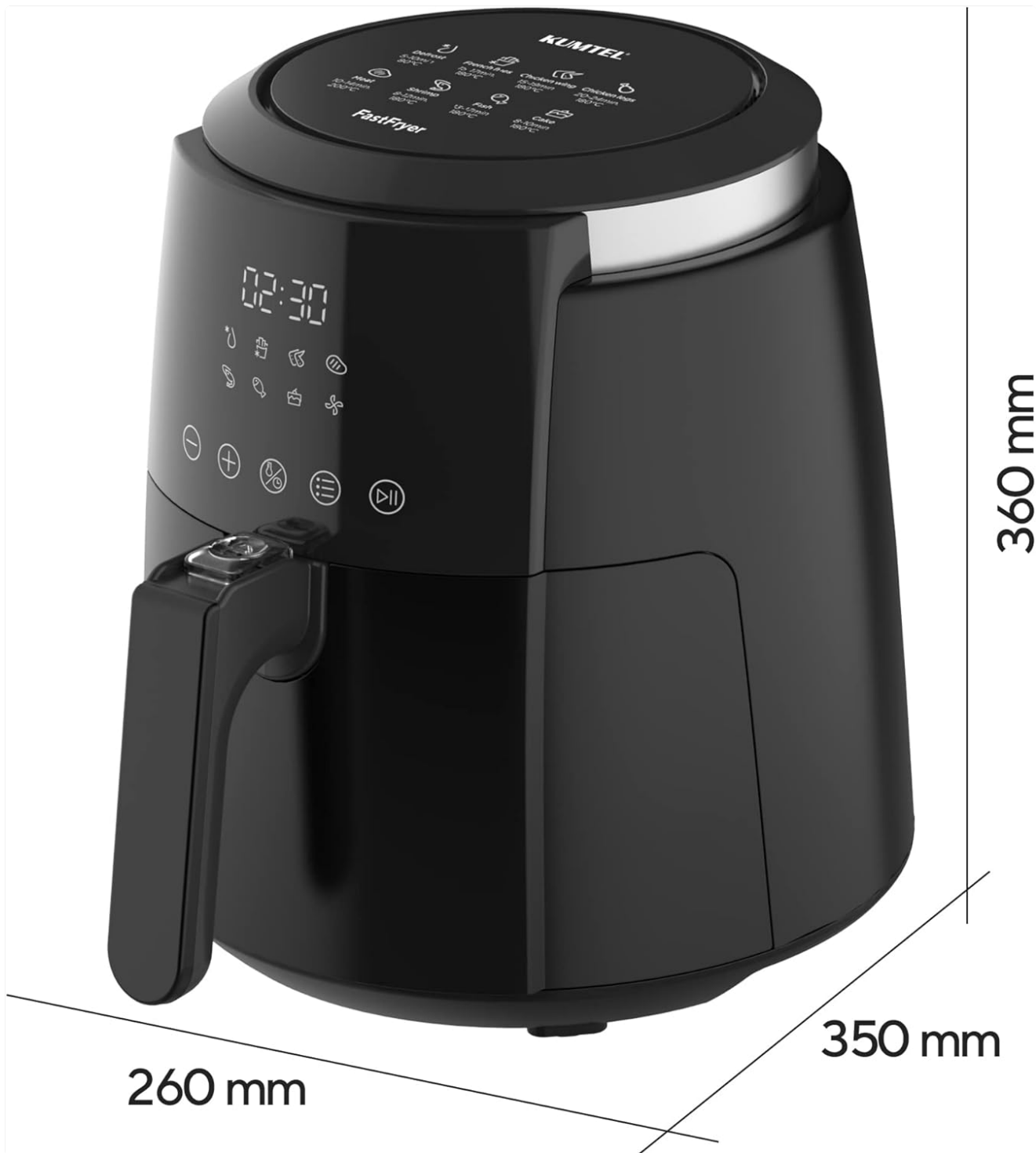
Figure 6: Dimensional diagram of the air fryer, showing length, width, and height.