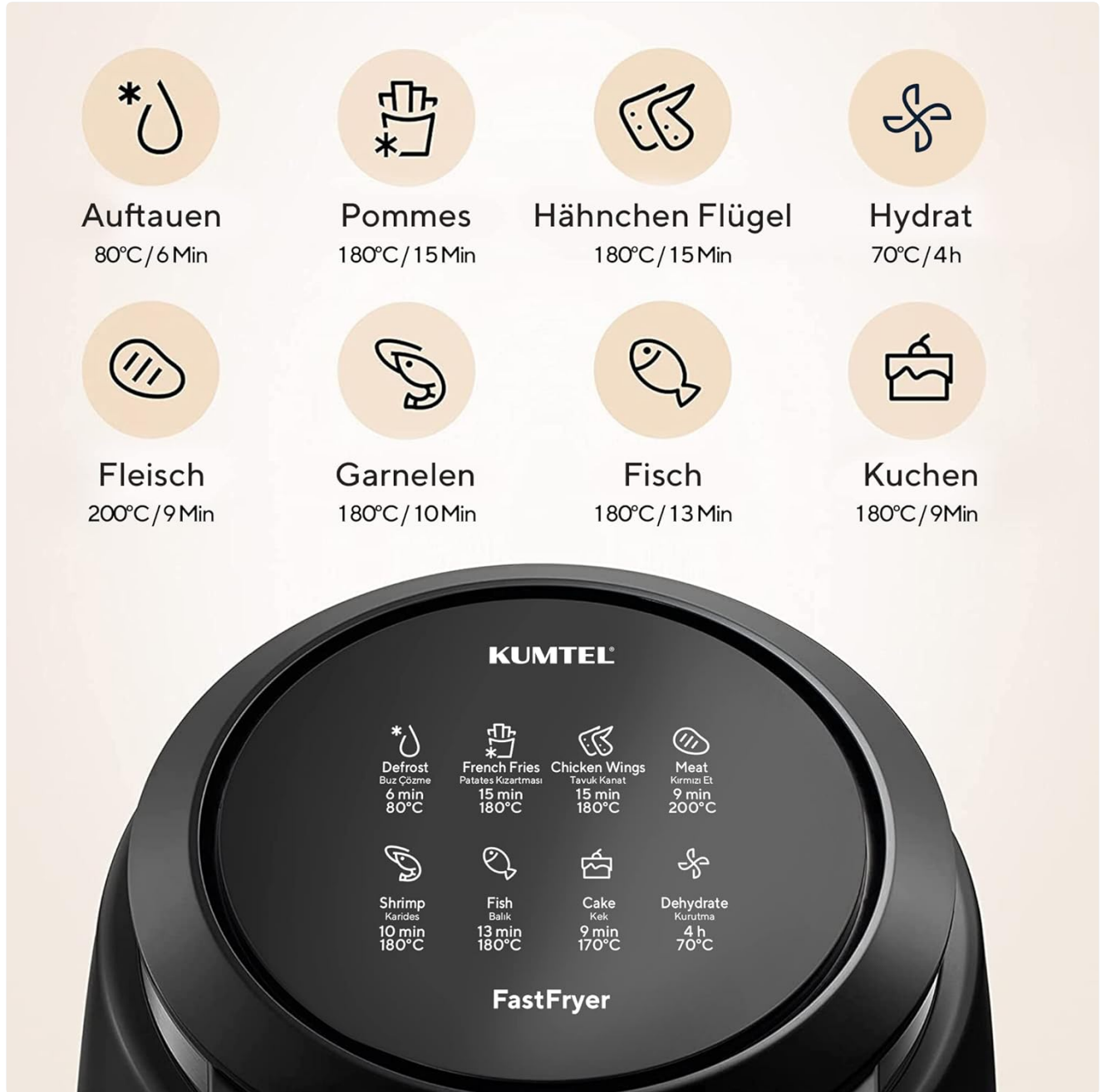
Figure 4: Top panel displaying the 8 preset cooking functions with recommended temperatures and times.

The air fryer includes 8 preset programs for convenient cooking. Simply select the desired program, and the appliance will automatically set the optimal temperature and time. You can manually adjust these settings if needed.