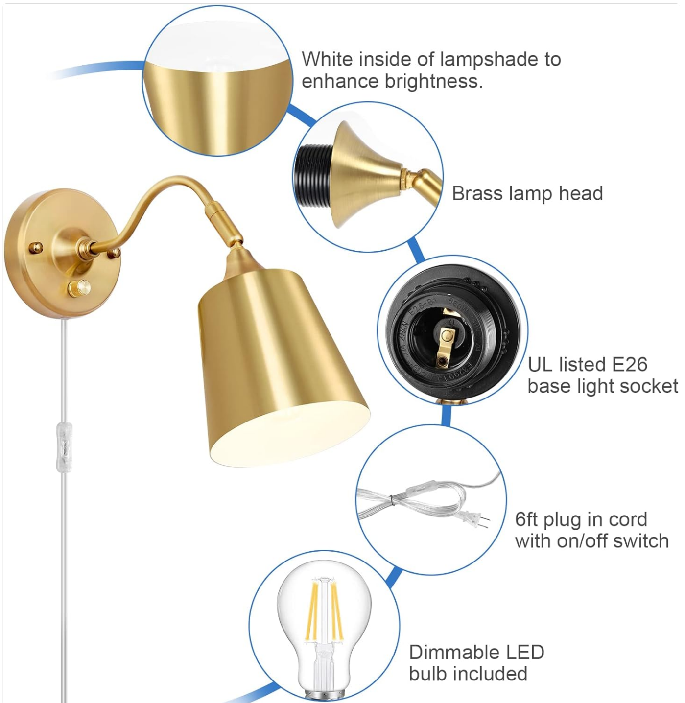
Image: Detailed view of the sconce components, highlighting the brass finish, E26 socket, and included bulb.