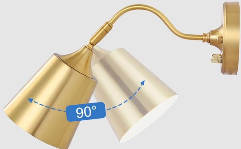
Image: Illustration of the flexible adjustment capabilities of the lamp head, including 350-degree rotation and 90-degree tilt.