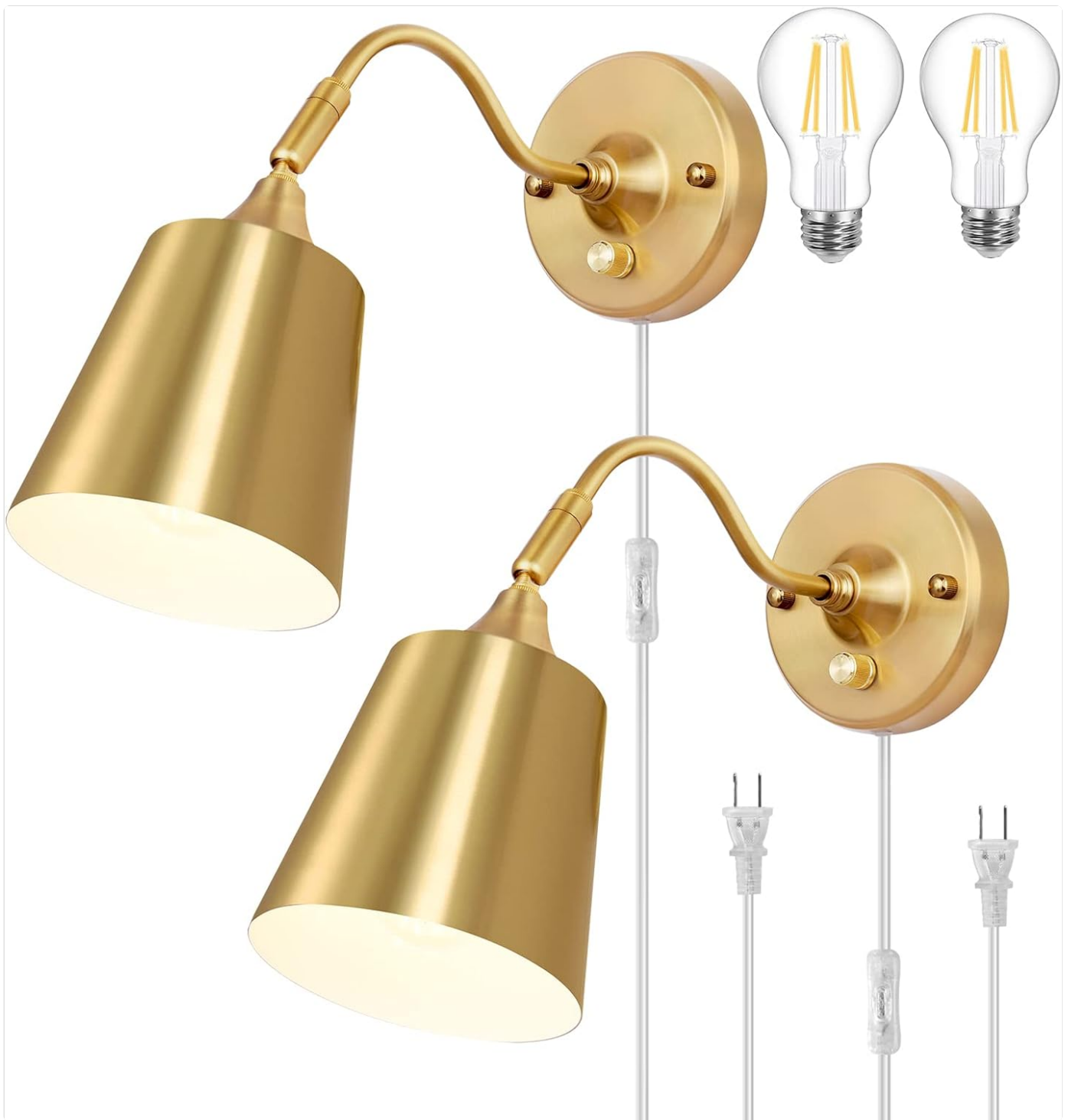
Image: Contents of the TRLIFE Wall Sconce package, showing two sconces, two LED bulbs, and power cords.