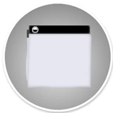
120-inch Projection Screen