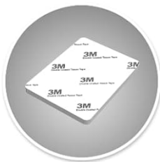
8 x 3M Stickers