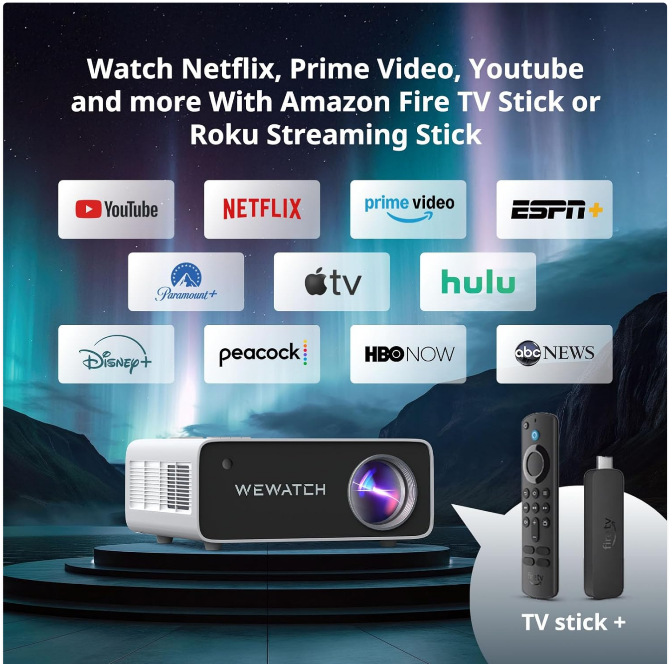
Image: The projector shown with logos of popular streaming services, indicating compatibility with Fire TV Stick or Roku Streaming Stick for accessing content.

Your browser does not support the video tag.