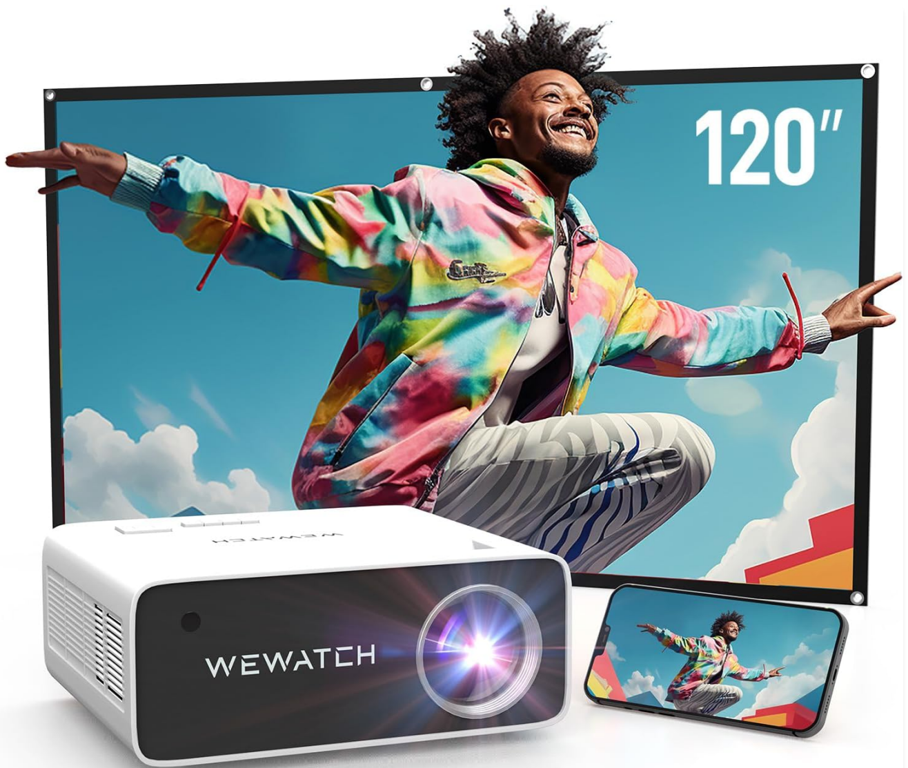
Image: The WEWATCH V51-PS07 projector, a 120-inch projection screen, and a smartphone demonstrating screen mirroring capabilities.