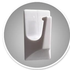
8 x Hooks

Image: A visual representation of the projector, the included 120-inch projection screen, 3M stickers, and hooks.