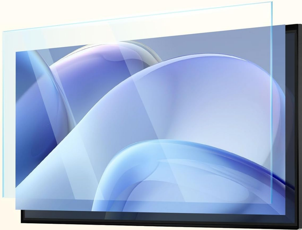
Image: Overview of JYXOIHUB 49 Inch Smart Board key features.