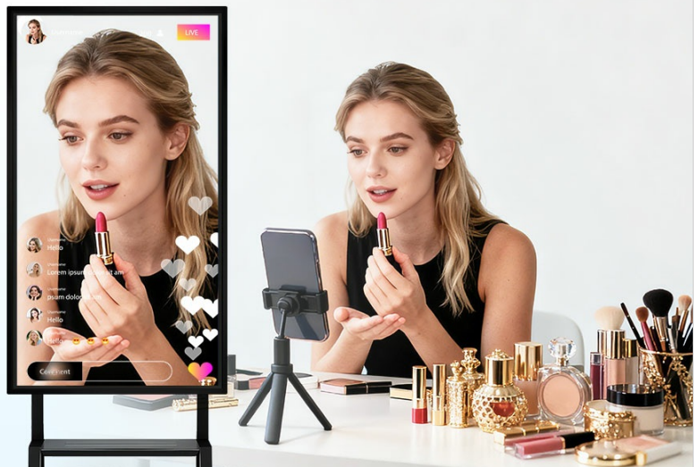
Image: Comprehensive overview of Smart Board functionalities.