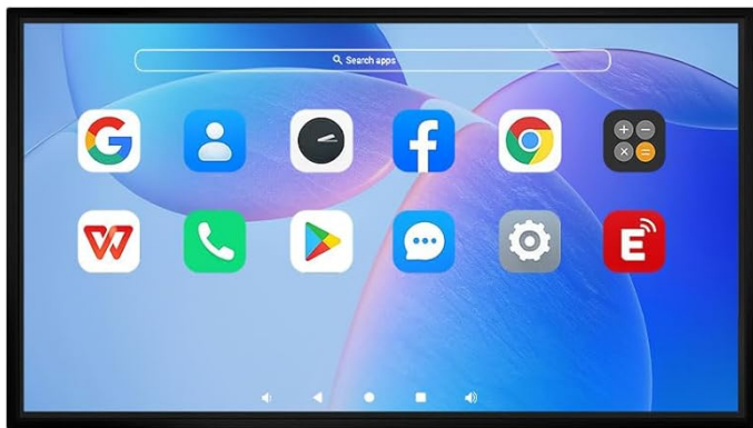
1*49Inch Smart Whiteboard