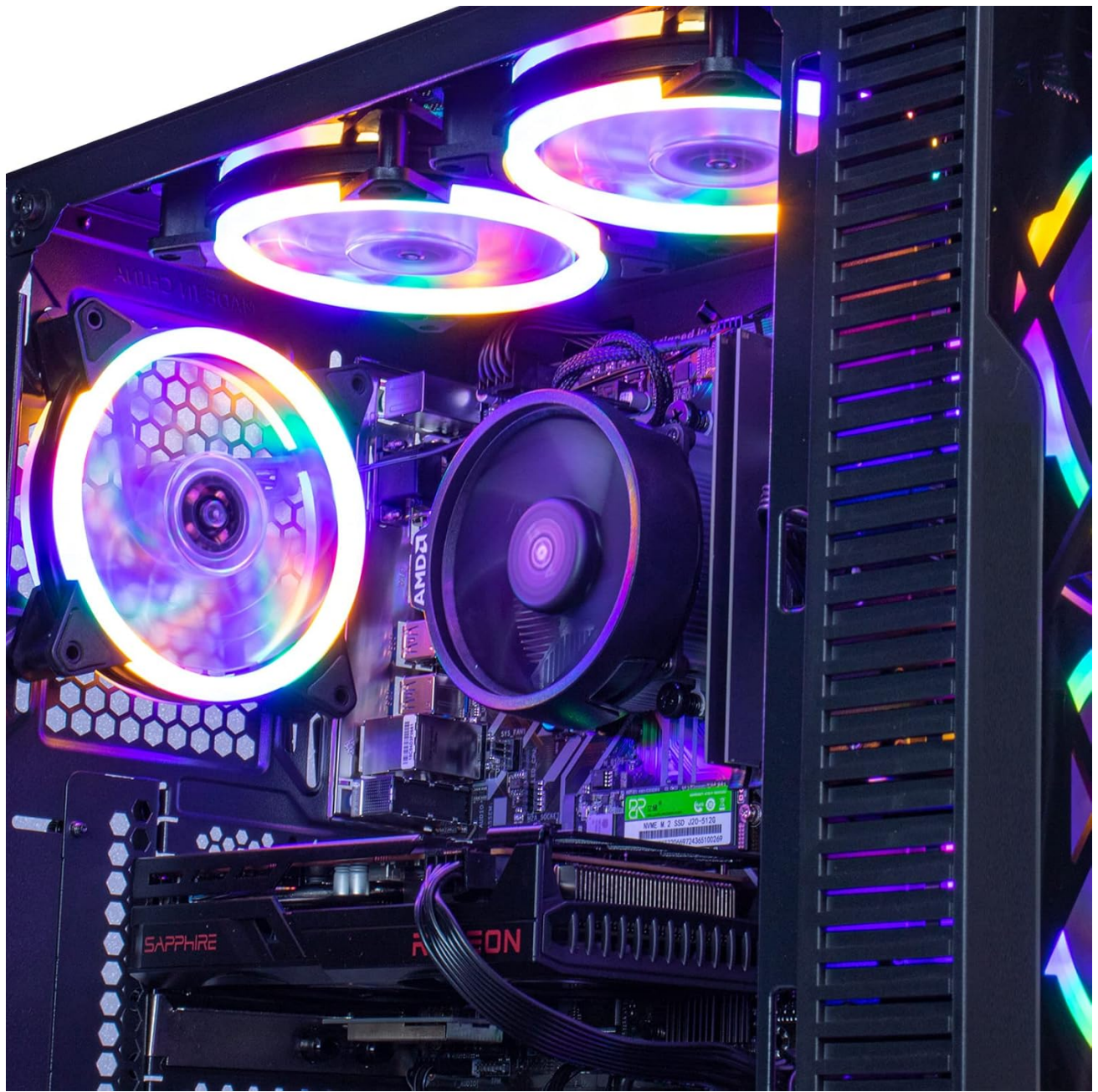
Image: Internal view of the MXZ Gaming PC, highlighting the illuminated RGB fans and core components.

The computer is equipped with 6 RGB fans for cooling and lighting. Use the dedicated RGB button on the top panel to cycle through various lighting modes or turn off the lighting. Refer to the motherboard manual for advanced RGB customization options if available.