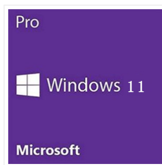
Image: Windows 11 Pro operating system logo.