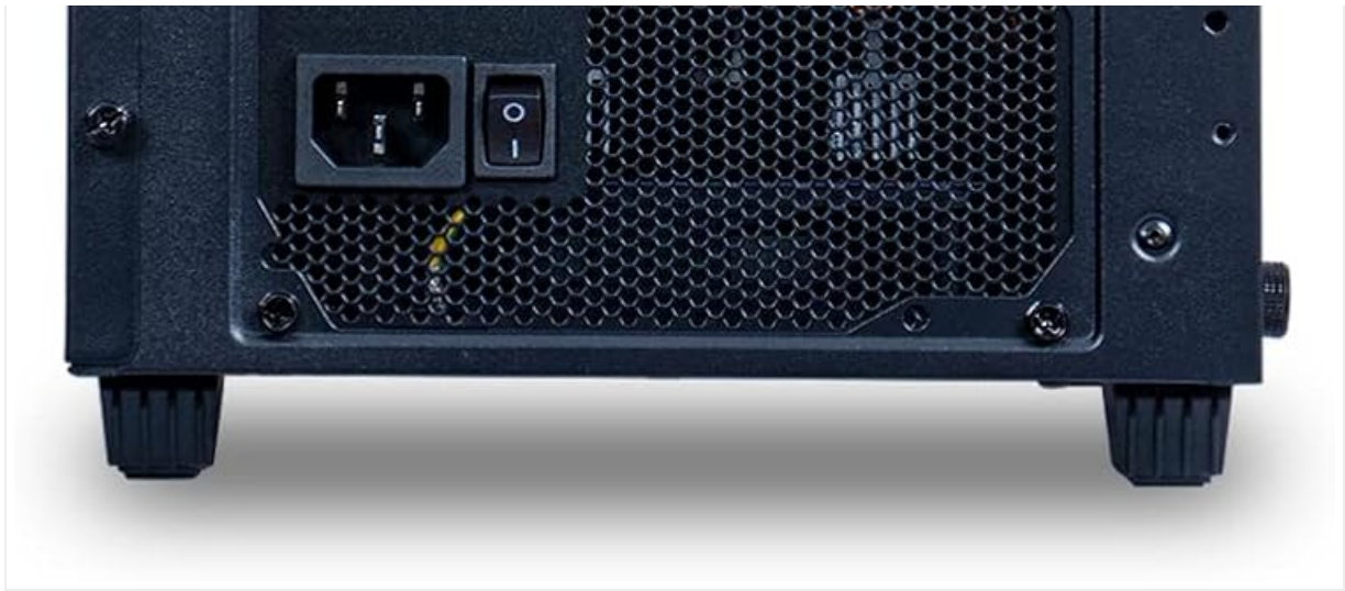
Image: Rear panel of the MXZ Gaming PC, displaying connectivity ports.