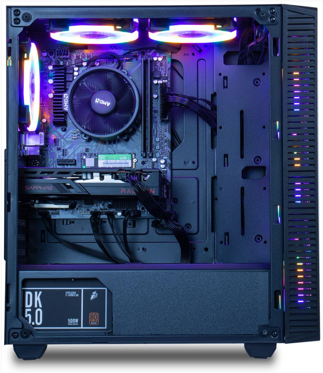
Image: Internal view of the MXZ Gaming PC, illustrating component layout and cable routing.

Ensure internal and external cables are neatly organized to promote better airflow and prevent accidental disconnections.