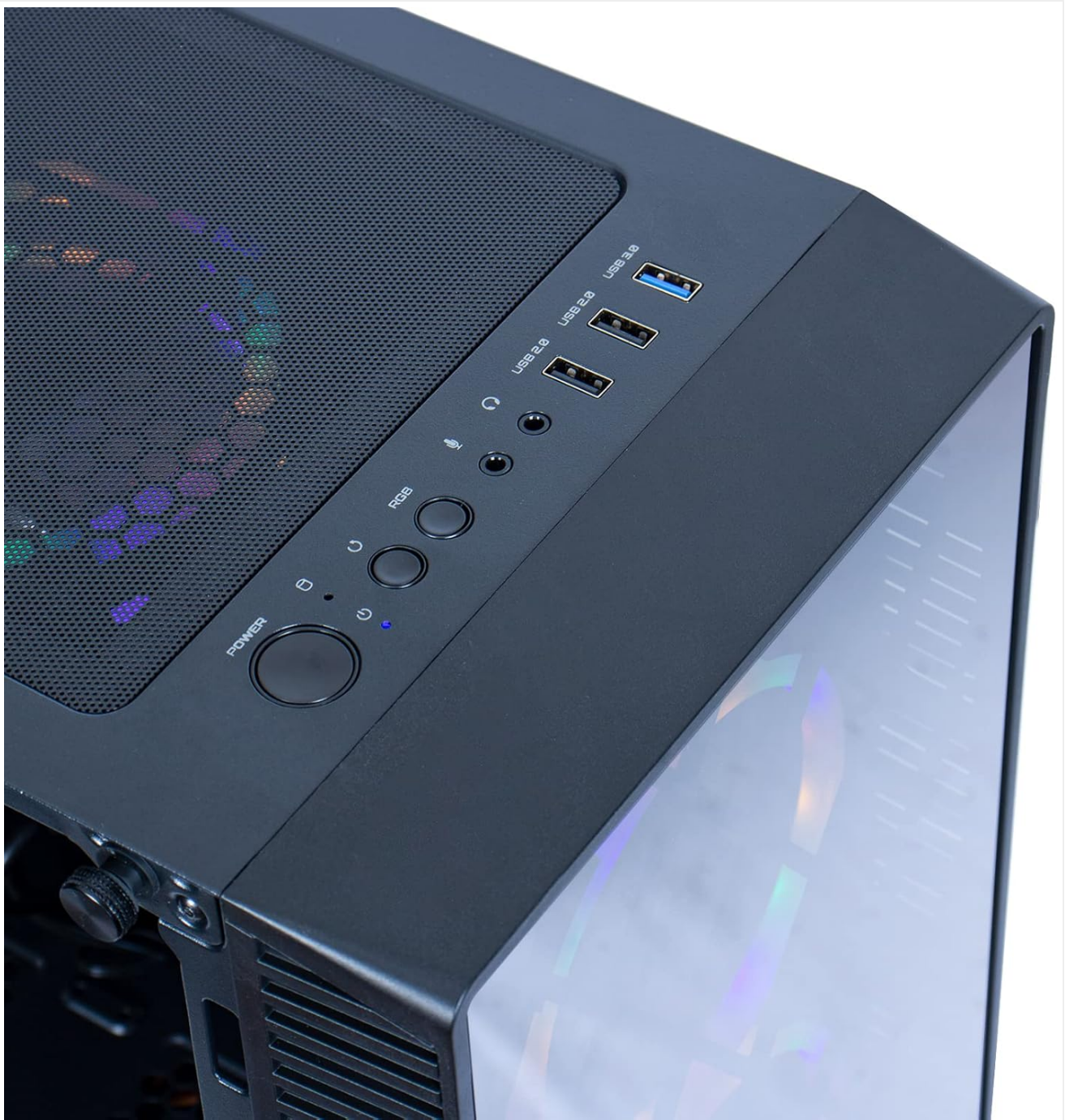
Image: Top panel of the MXZ Gaming PC, featuring the power button, RGB control button, and front USB ports.