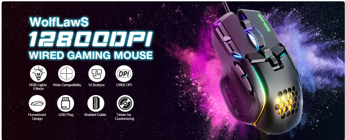
Image: A banner illustrating the key features of the WolfLawS M5 Gaming Mouse, including its high DPI, RGB lighting, and ergonomic design.