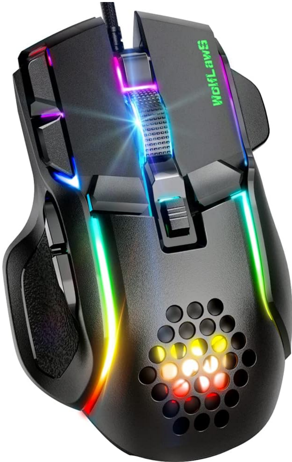
Image: The WolfLawS M5 Wired Gaming Mouse, showcasing its ergonomic design and vibrant RGB lighting.