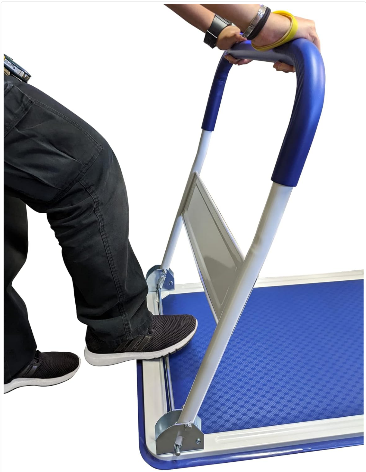
Figure 4: Activating the folding mechanism by pressing the release bar with a foot.