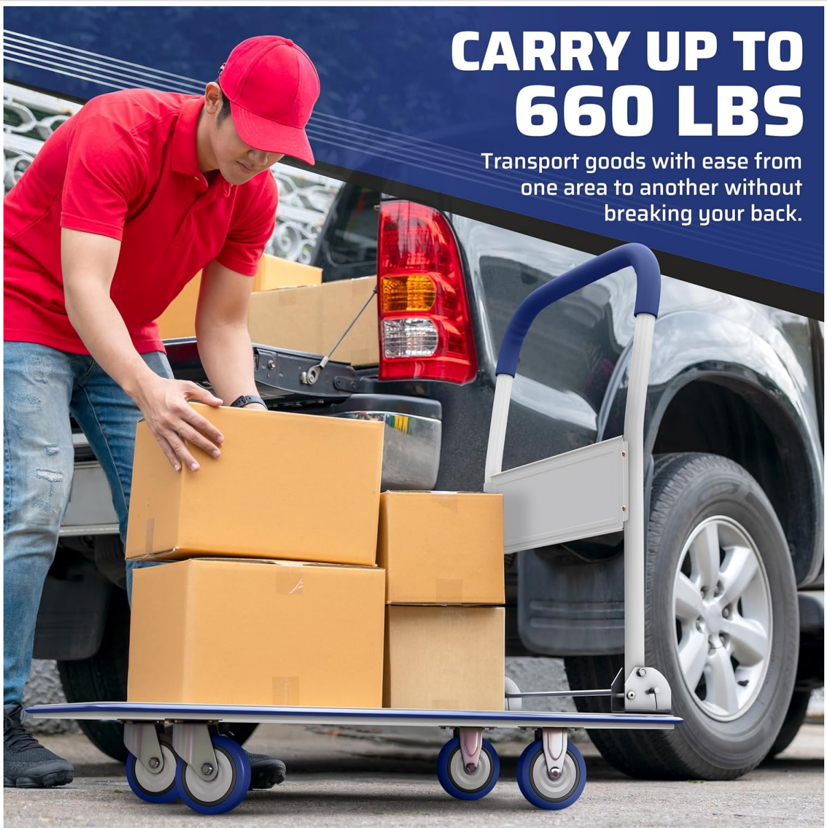
Figure 3: Demonstrating the loading of items onto the dolly for transport.

Transport goods with ease from one area to another without breaking your back.