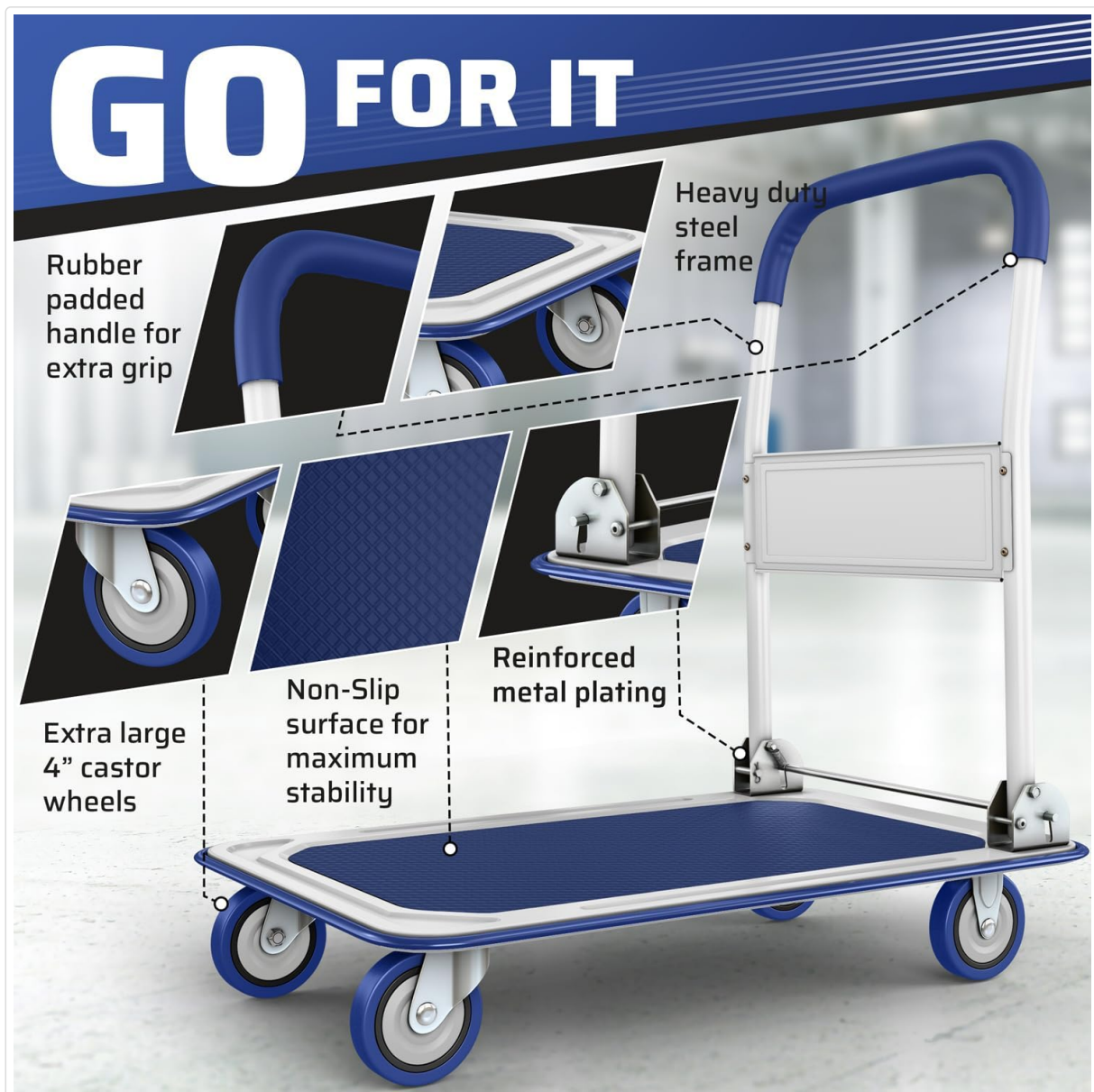
Figure 2: Key features including the rubber padded handle, non-slip platform surface, reinforced metal plating, and 4-inch castor wheels.