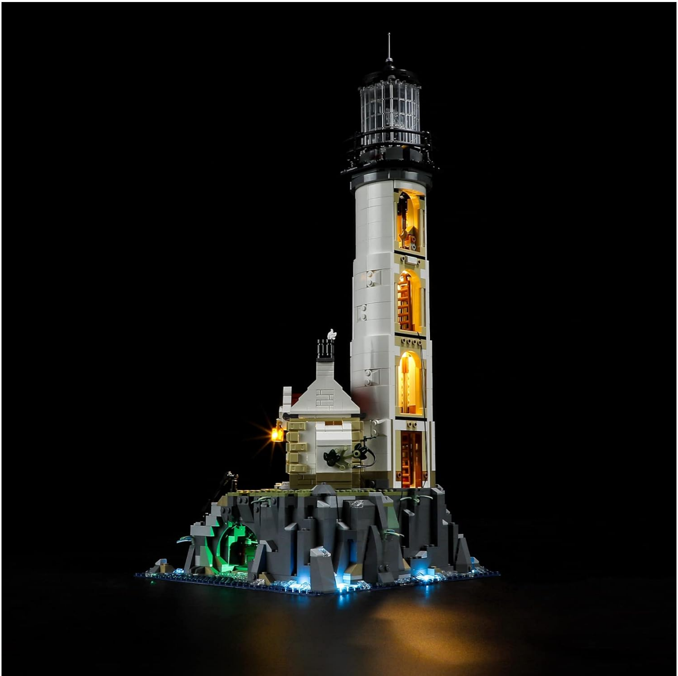
Image: Detailed view of the illuminated interior of the lighthouse tower.

Video: A demonstration of the LIGHTAILING LED Lighting Kit installed on the Lego 21335 Motorized Lighthouse, showing various illuminated sections and effects.