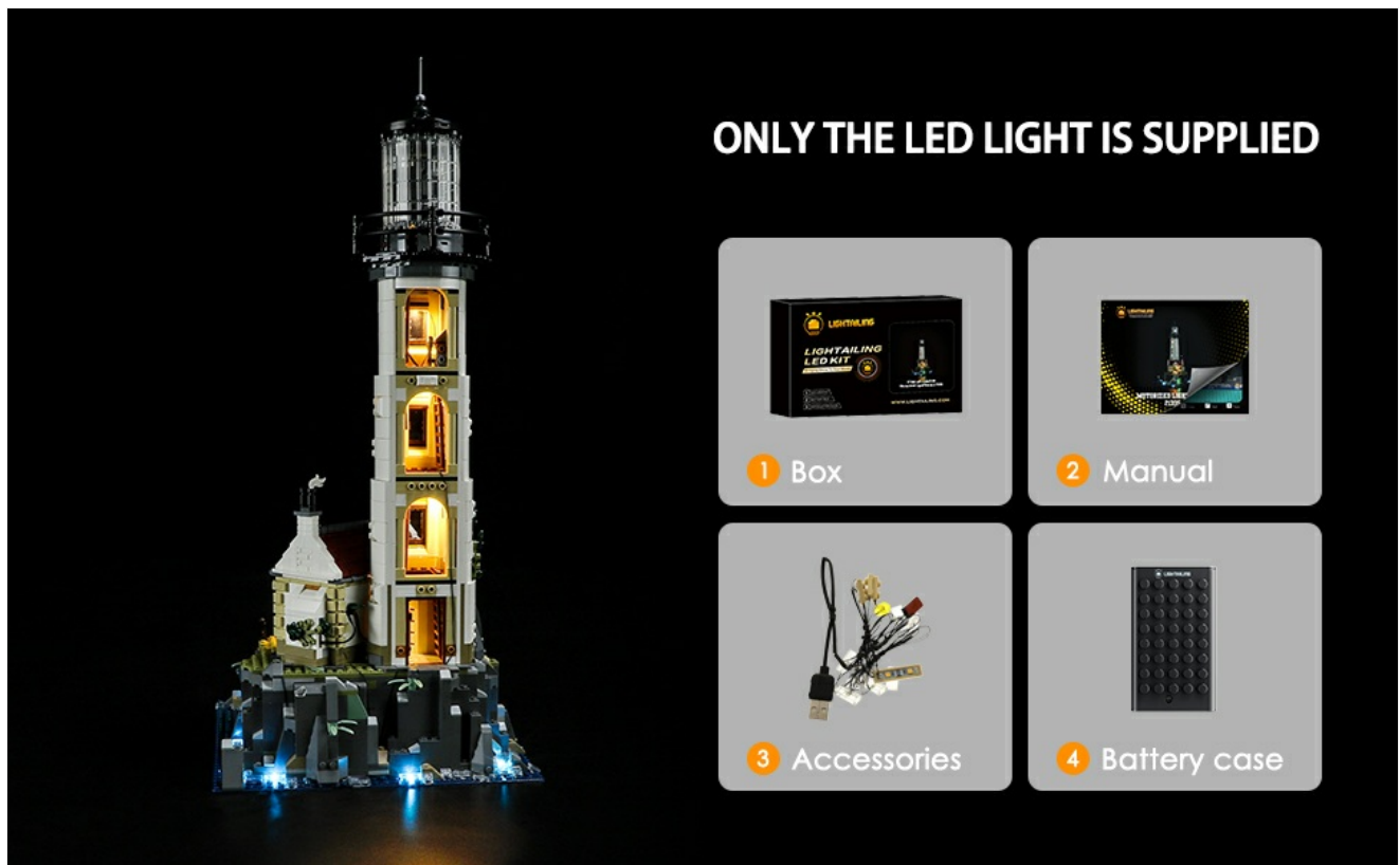
Image: The complete contents of the LIGHTAILING LED Lighting Kit package.