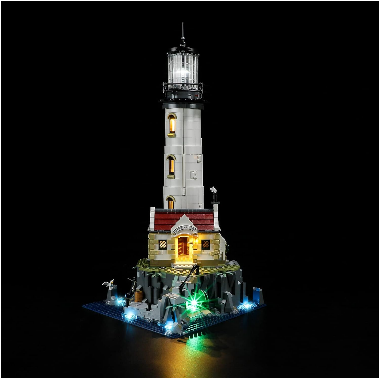
Image: The Lego 21335 Motorized Lighthouse model fully illuminated by the LIGHTAILING LED lighting kit.