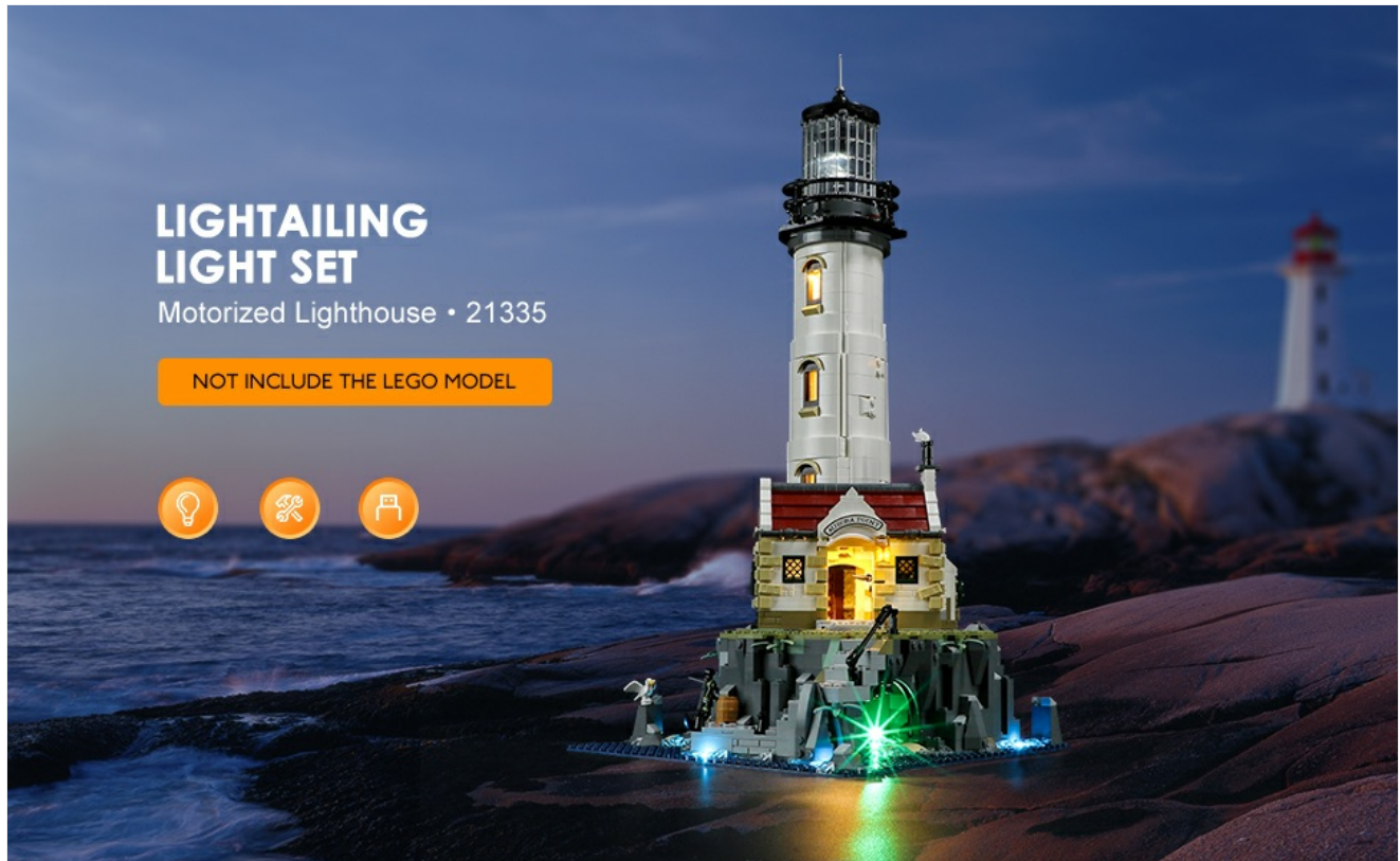
Image: Example of LED light placement within the Lego model.