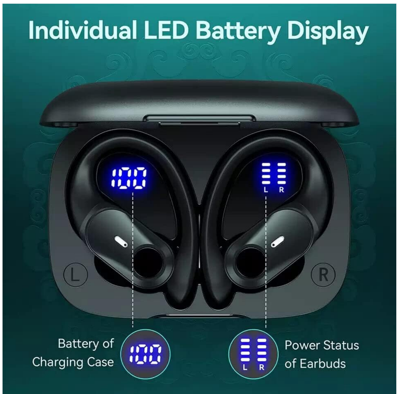
Image: Close-up of the SGNICS T59 charging case's LED display, clearly showing the numerical battery percentage for the case and