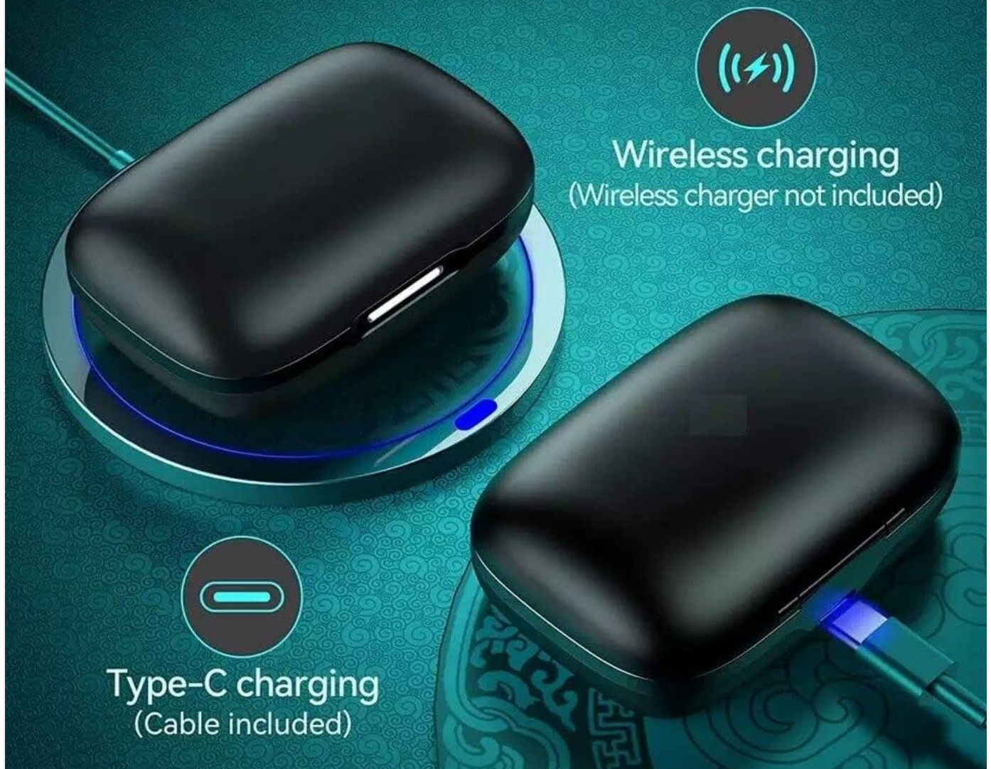
Image: The SGNICS T59 charging case demonstrating both wireless charging on a pad and wired charging via a USB-C cable.