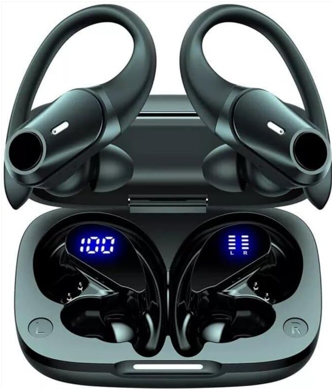
Image: SGNICS T59 Wireless Earbuds shown inside their charging case, displaying battery levels on an LED screen.