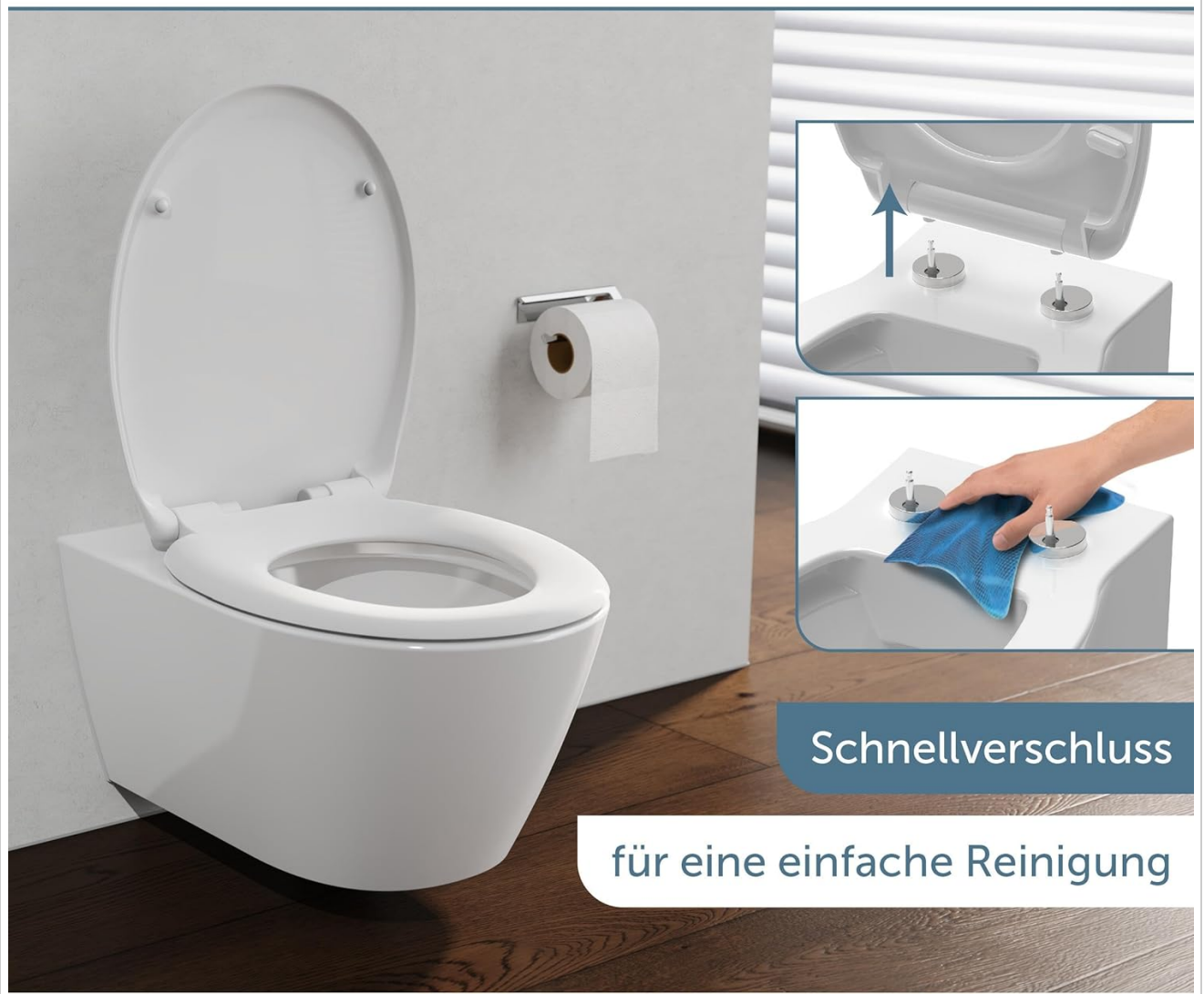
Figure 6.1: Shows the quick-release mechanism, allowing the toilet seat to be easily detached from its hinges for comprehensive cleaning.