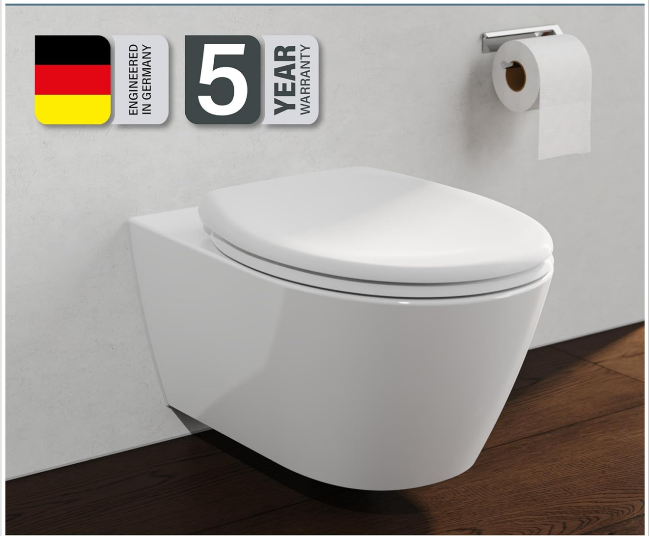
Figure 4.3: The Schütte WC-Seat fully installed on a modern toilet, showcasing its clean design.