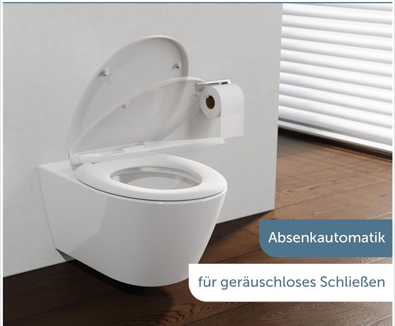
Figure 5.1: Illustrates the soft-close function, showing the toilet seat and lid gently lowering without manual assistance.

Important: Do not force the lid or seat closed, as this can damage the soft-close mechanism.