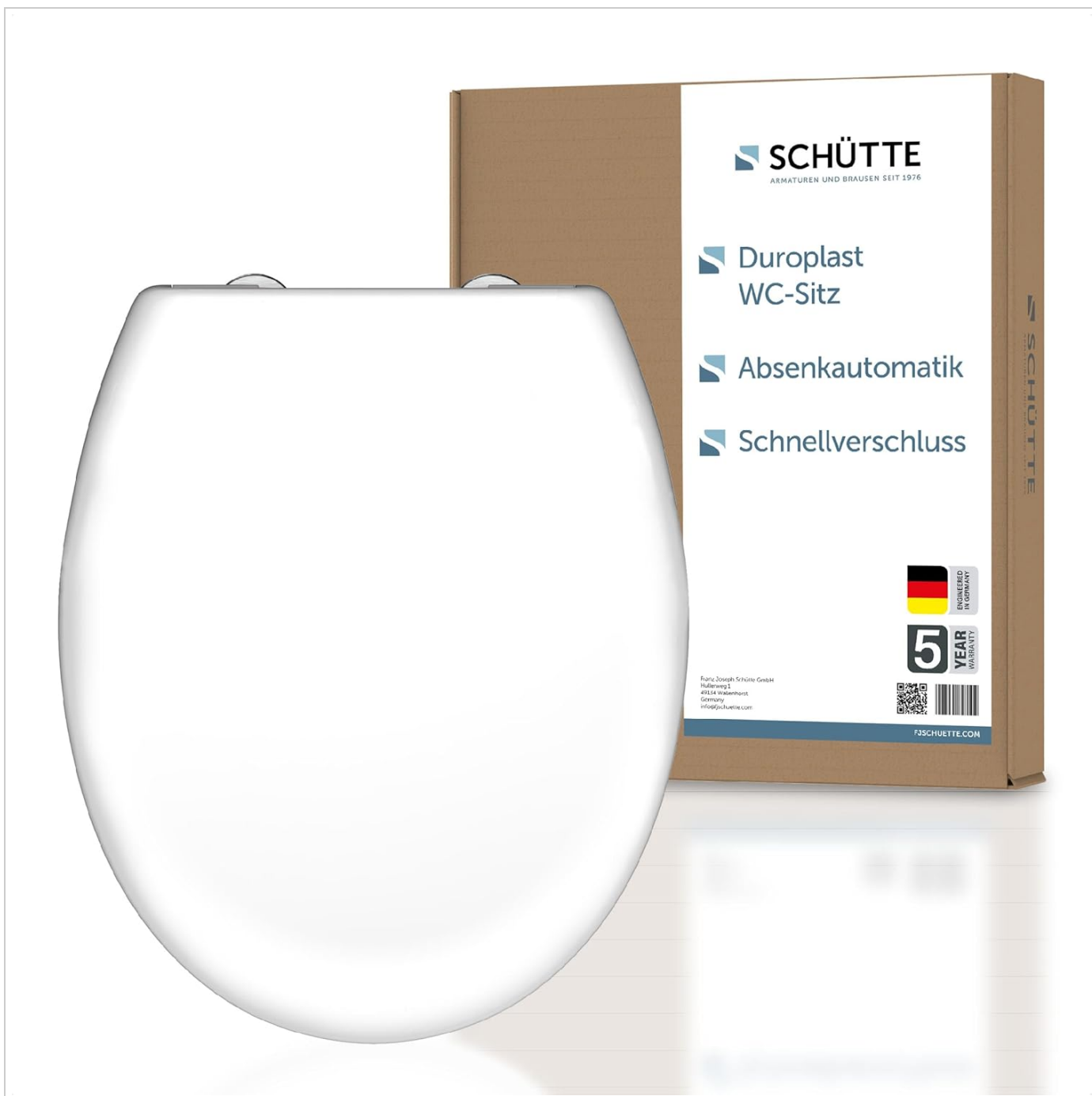
Figure 2.1: Schütte Duroplast WC-Seat with its packaging, highlighting key features like Duroplast material, soft-close mechanism, and quick release.