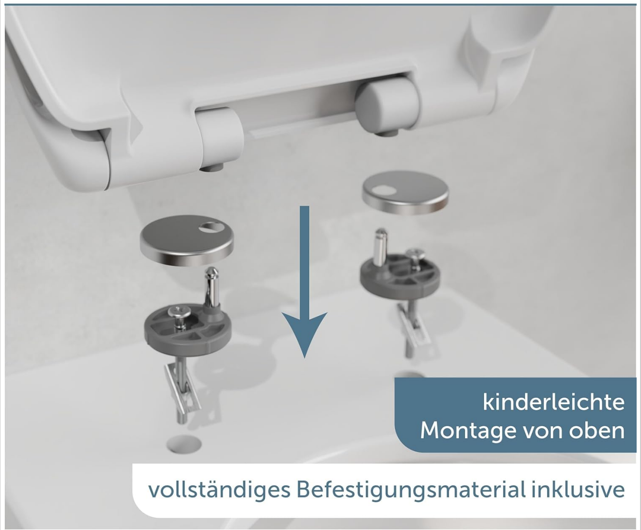
Figure 4.1: Components for the top-fix installation, showing the hinge posts, mounting plates, and expansion anchors.